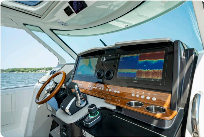
Tiara 43LS helm station