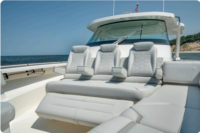
Tiara 43LS fwd seats