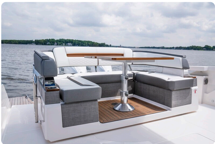
Tiara 43 LS aft dinette