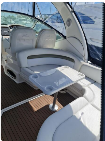
Sea Ray 375 Sundancer Twin Diesel