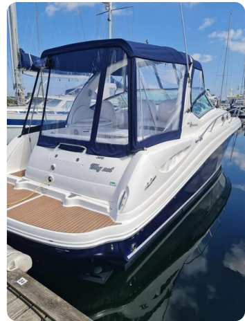
Sea Ray 375 Sundancer Twin Diesel