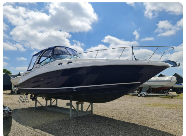
Sea Ray 375 Sundancer Twin Diesel