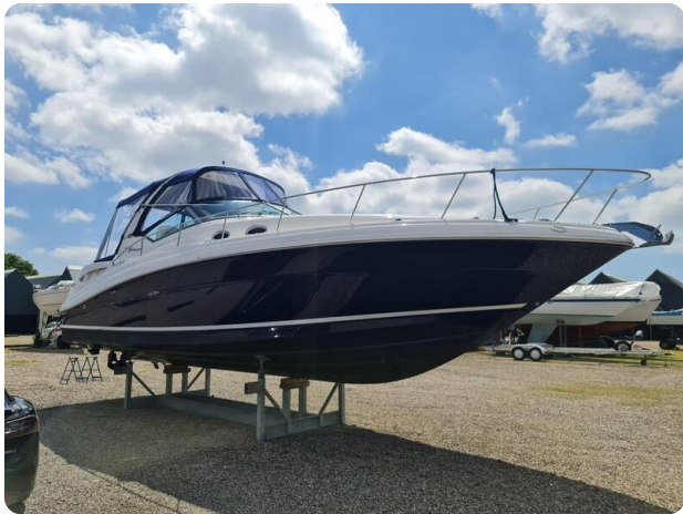
Sea Ray 375 Sundancer Twin Diesel