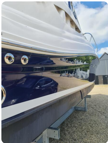
Sea Ray 375 Sundancer Twin Diesel