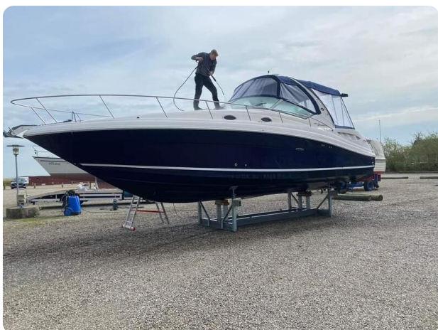
Sea Ray 375 Sundancer Twin Diesel