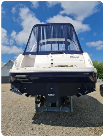
Sea Ray 375 Sundancer Twin Diesel