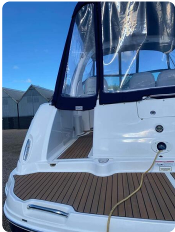
Sea Ray 375 Sundancer Twin Diesel