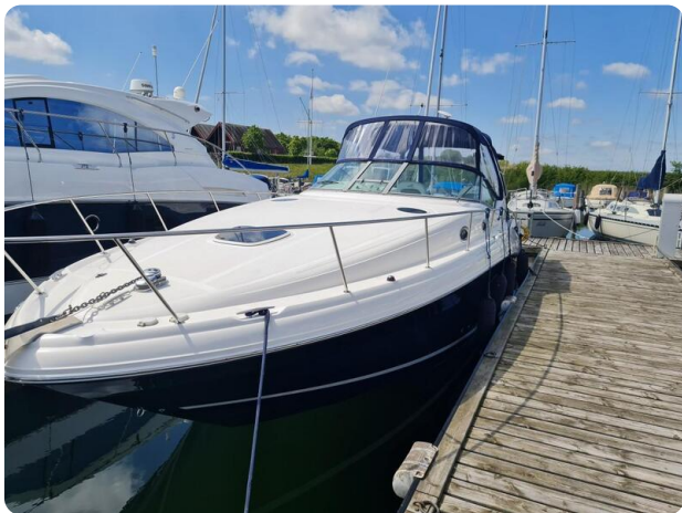
Sea Ray 375 Sundancer Twin Diesel