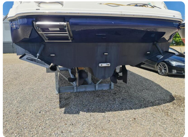
Sea Ray 375 Sundancer Twin Diesel