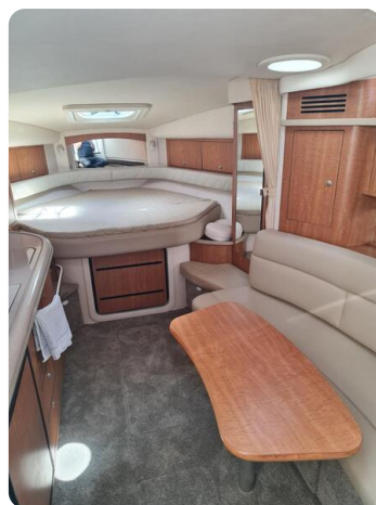
Sea Ray 375 Sundancer