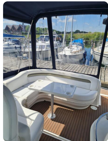
Sea Ray 375 Sundancer