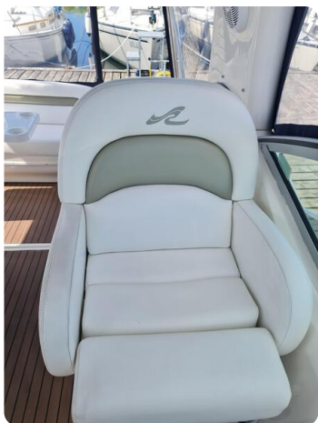
Sea Ray 375 Sundancer