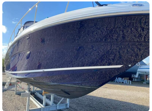
Sea Ray 375 Sundancer