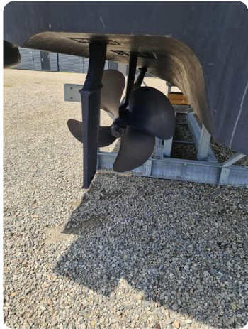
Sea Ray 375 Sundancer