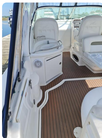
Sea Ray 375 Sundancer