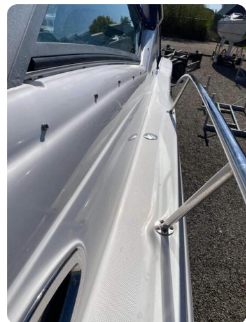
Sea Ray 375 Sundancer