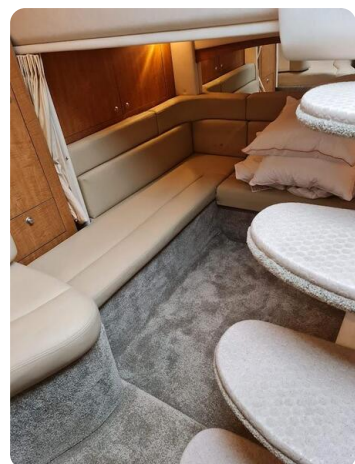
Sea Ray 375 Sundancer