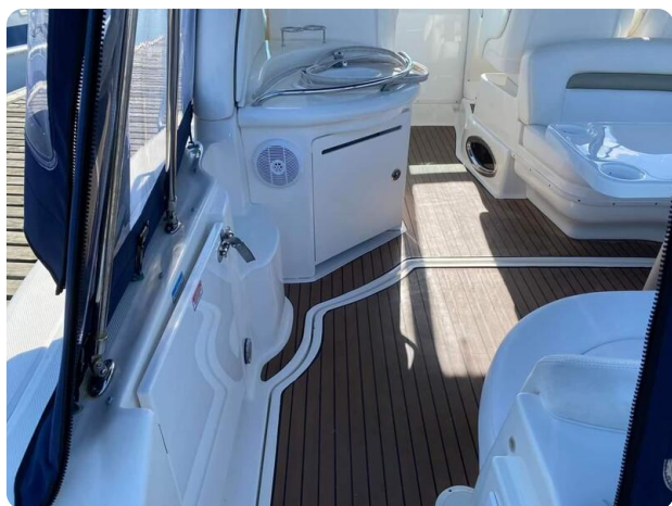
Sea Ray 375 Sundancer