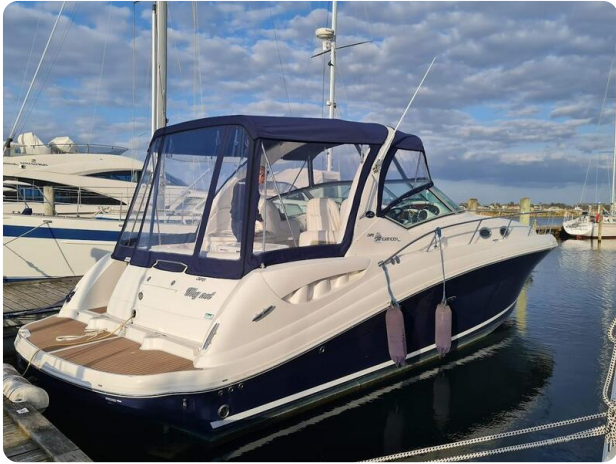
Sea Ray 375 Sundancer