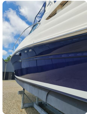
Sea Ray 375 Sundancer