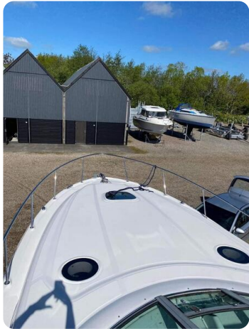
Sea Ray 375 Sundancer