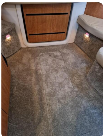
Sea Ray 375 Sundancer