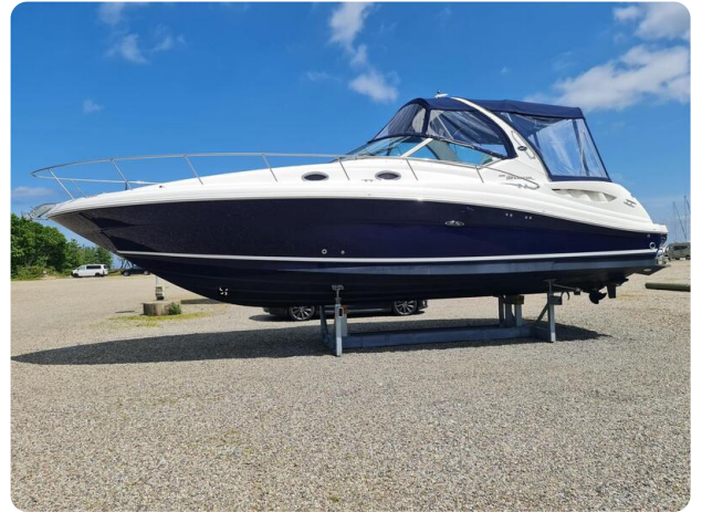
Sea Ray 375 Sundancer