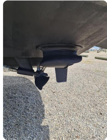
Sea Ray 375 Sundancer