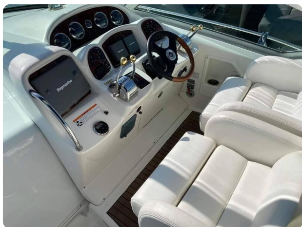
Sea Ray 375 Sundancer