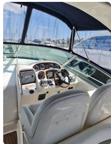
Sea Ray 375 Sundancer