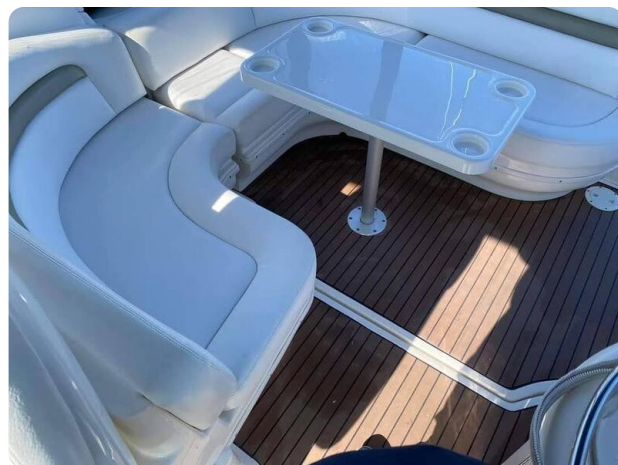
Sea Ray 375 Sundancer