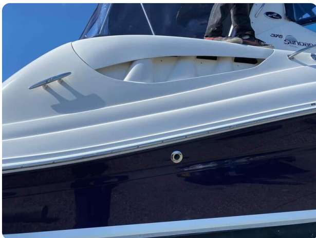
Sea Ray 375 Sundancer