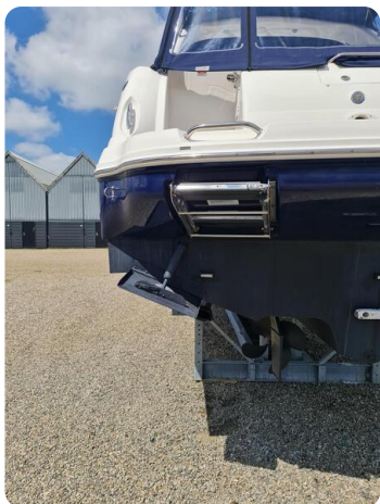
Sea Ray 375 Sundancer