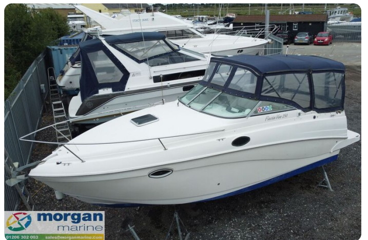
Rinker fiesta vee 250 boat - bow area