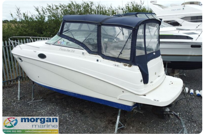
Rinker fiesta vee 250 boat - aft canopy