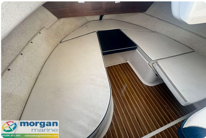
Quicksilver 640 - berth