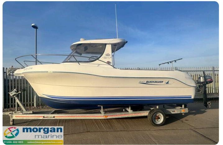
Quicksilver 640 - side