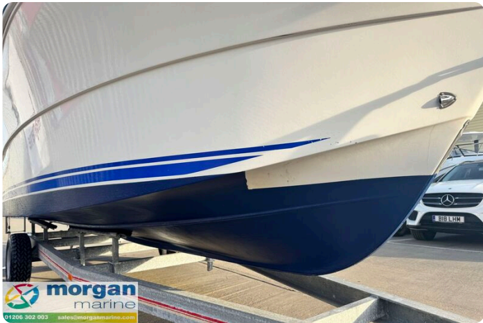
Quicksilver 640 - antifoul