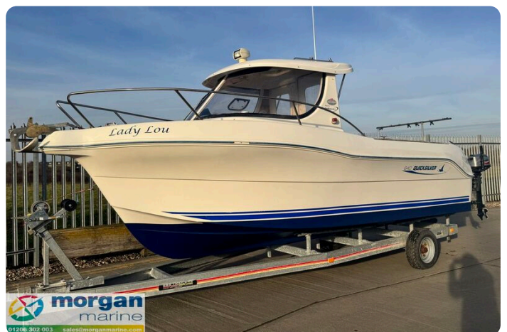
Quicksilver 640 - main photo