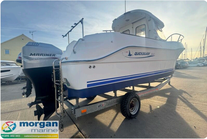
Quicksliver 640 - ladder