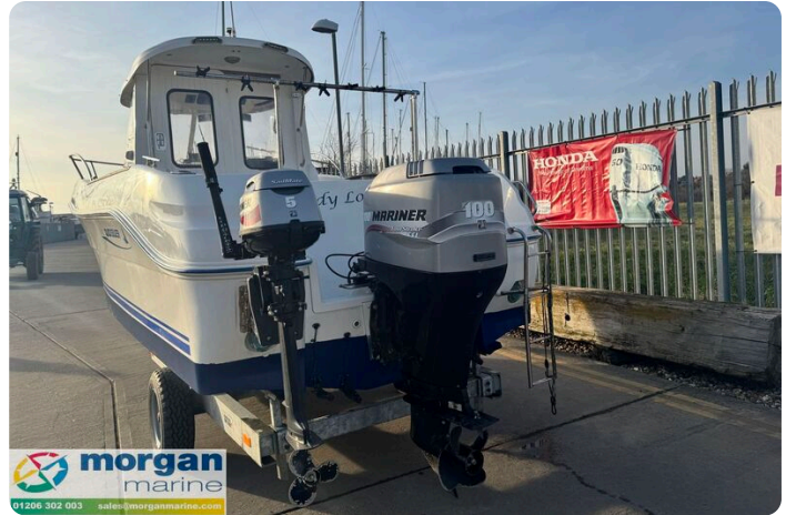
Quicksilver 640 - engine