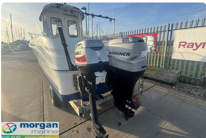
Quicksilver 640 - auxillary