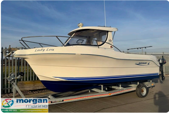
Quicksilver 640 - main picture