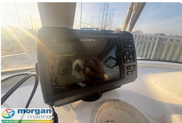
Quicksilver 640 - plotter