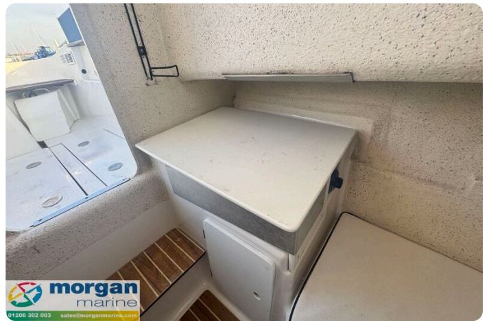
Quicksilver 640 - galley