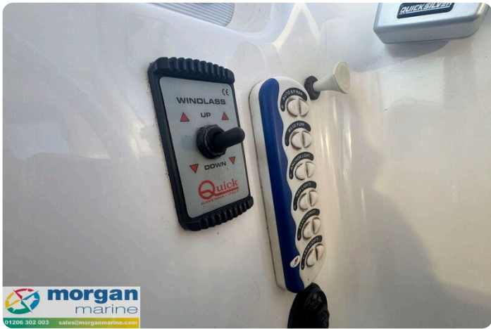
Quicksilver 640 - windlass