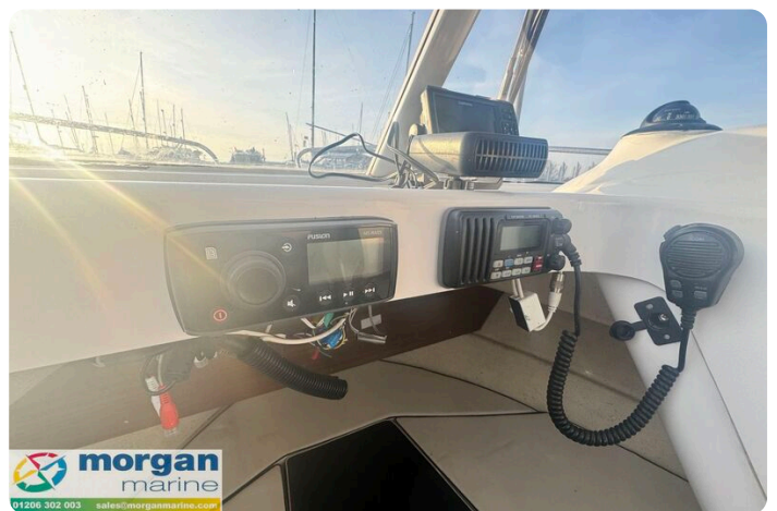
Quicksilver 640 - vhf