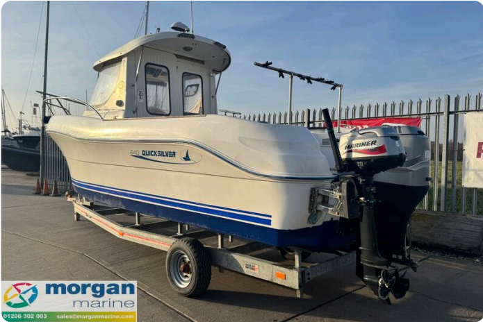
Quicksilver 640 - polished