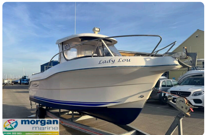
Quicksilver 640 - name