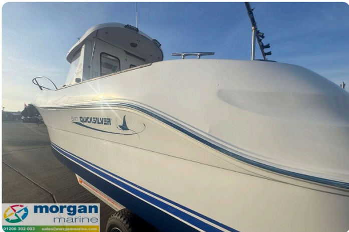
Quicksilver 640 - polished