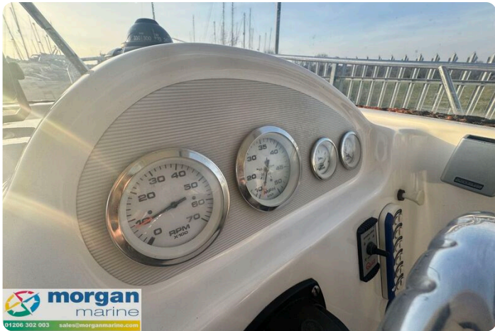
Quicksilver 640 - gauges