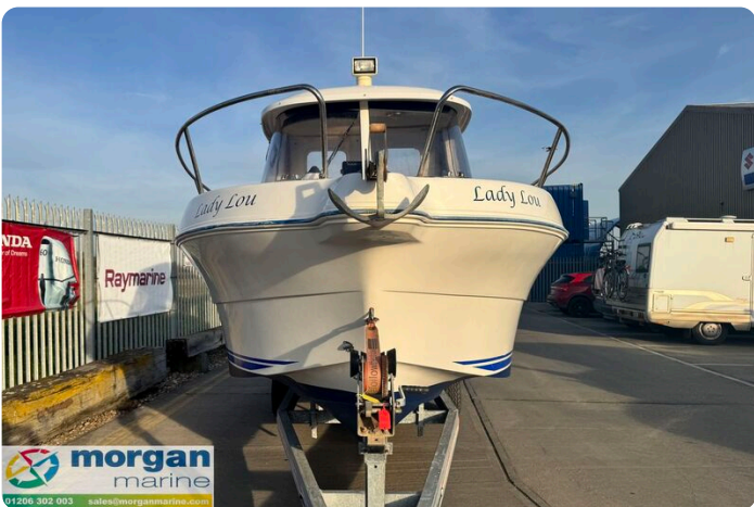
Quicksilver 640 - bow