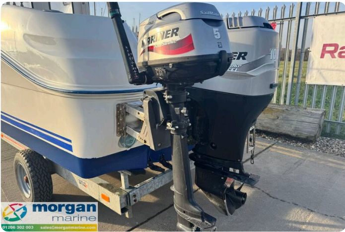
Quicksilver 640 - engine