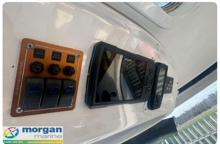
Quicksilver 640 - chart