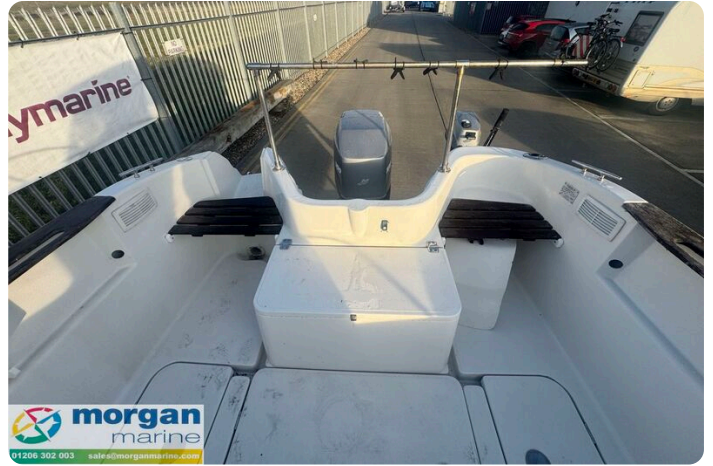
Quicksliver 640 - fishing