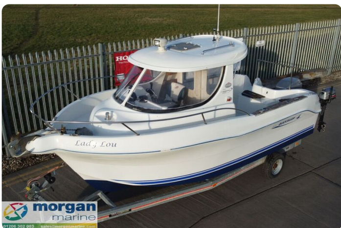
Quicksilver 640 - rails