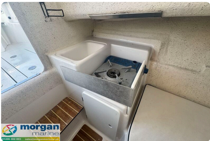
Quicksilver 640 - cooker