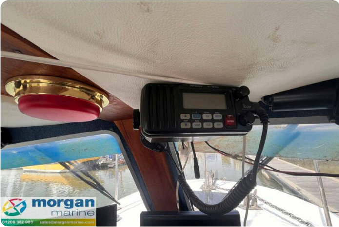
Procharter 36 GRP charter fishing boat - VHF radio