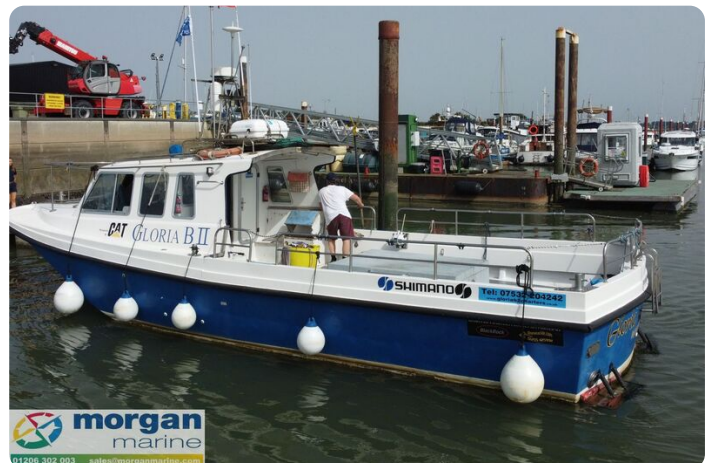
Procharter 36 GRP charter fishing boat - in the cockpit