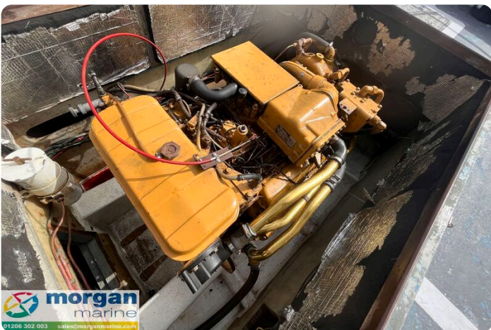
Procharter 36 GRP charter fishing boat - Caterpillar 380hp diesel shaft drive