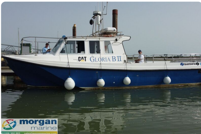
Procharter 36 GRP charter fishing boat - port side view of wheelhouse