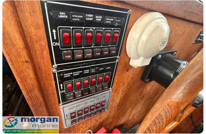
Procharter 36 GRP charter fishing boat - switch panel