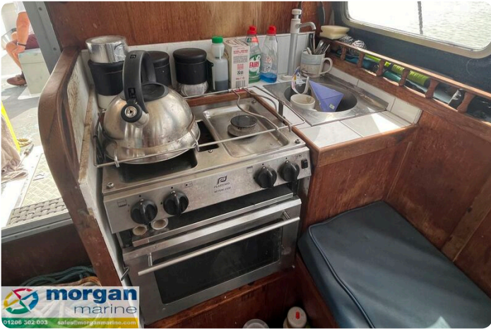
Procharter 36 GRP charter fishing boat - galley with cooker and sink