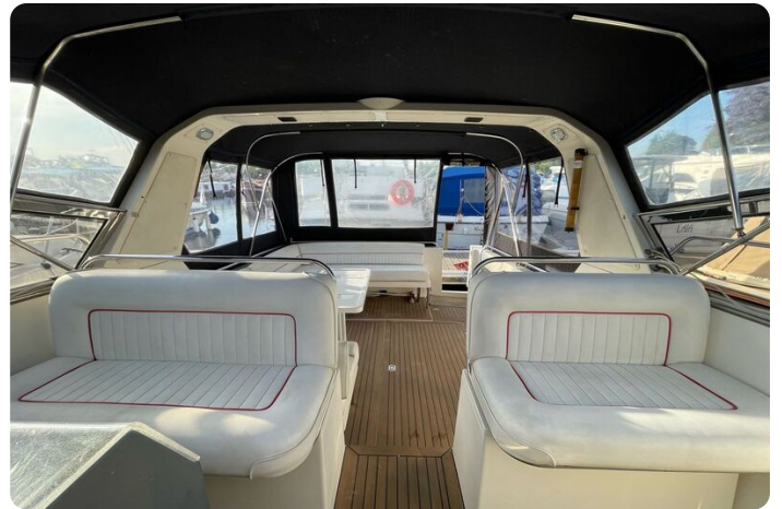
Princess 36 Riviera-overview