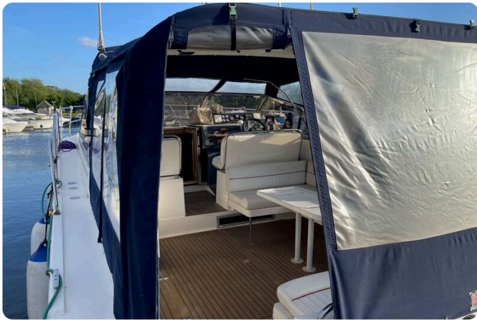
Princess 36 Riviera-canopy