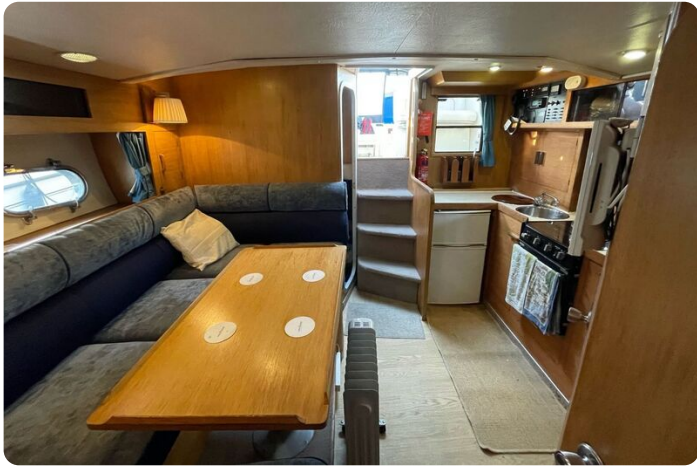
Princess 36 Riviera-saloon-seating