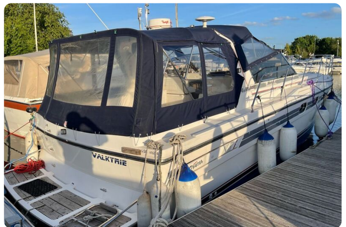
Princess 36 Riviera-back