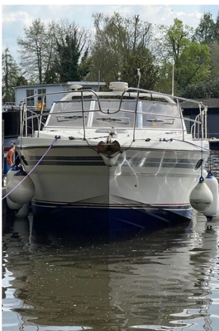
Princess 36 Riviera-front