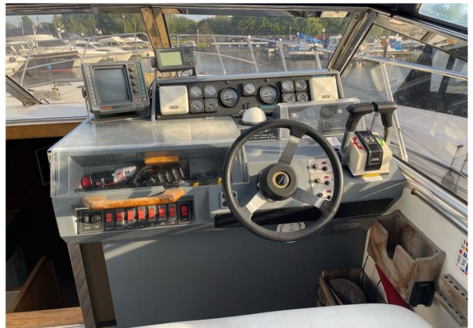
Princess 36 Riviera-dash