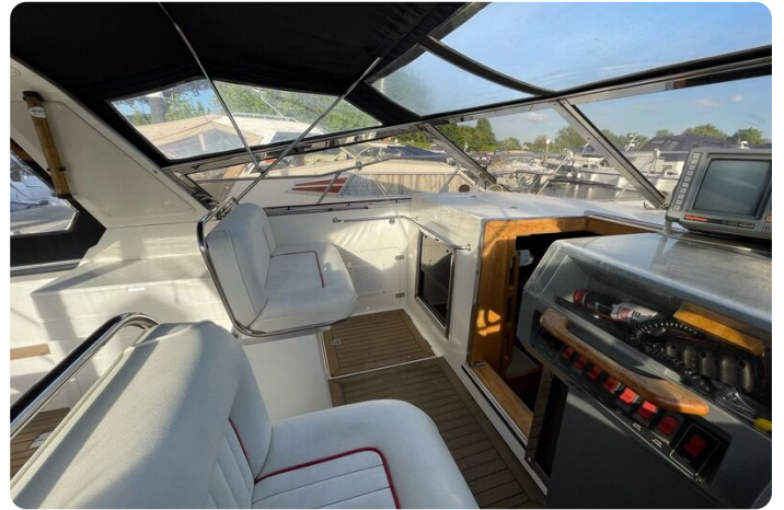
Princess 36 Riviera-co-pilot-seating