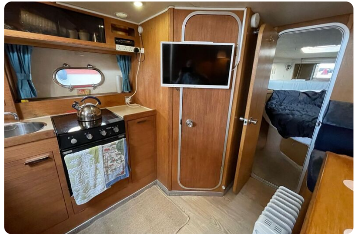
Princess 36 Riviera-tv