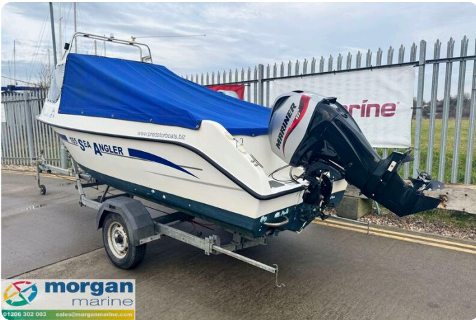
Predator 165 sea angler - back