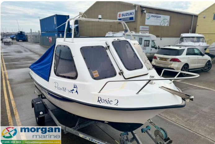
Predator 165 sea angler - bow rails