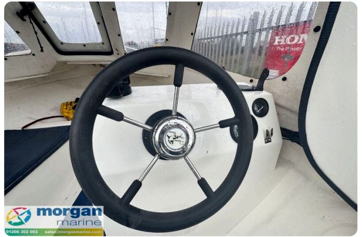
Predator 165 sea angler - wheel 2