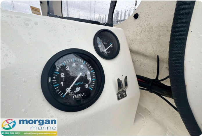
Predator 165 sea angler - gauges