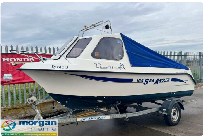
Predator 165 sea angler - main