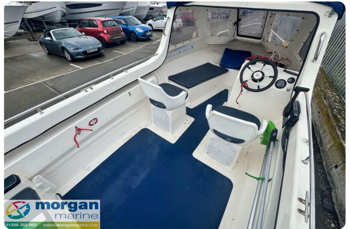
Predator 165 sea angler - cockpit deck