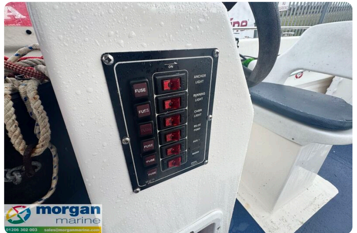
Predator 165 sea angler - Switch panel