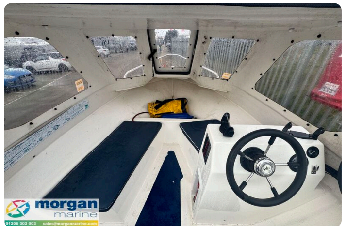
Predator 165 sea angler - wheelhouse