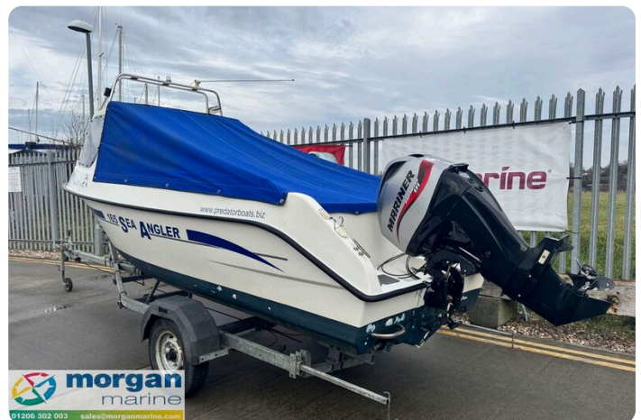
Predator 165 sea angler - mariner engine