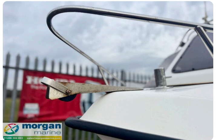
Predator 165 sea angler - bow roller