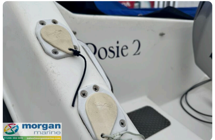
Predator 165 sea angler - rod holders