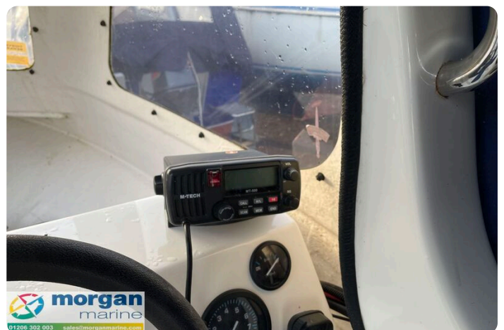
Predator 165 sea angler - VHF radio