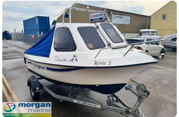
Predator 165 sea angler - front windscreen