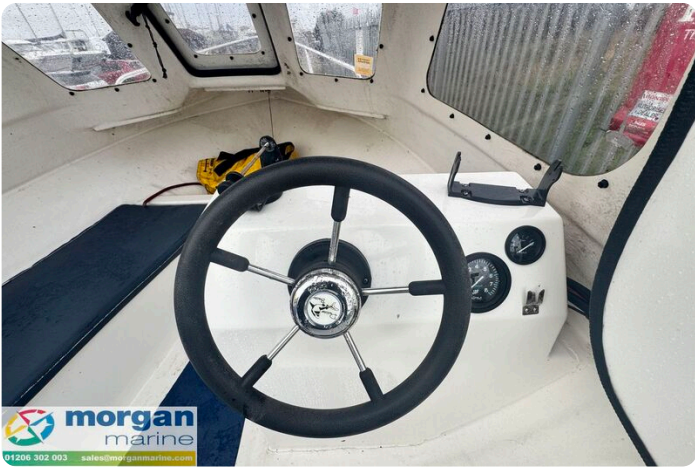
Predator 165 sea angler - wheel