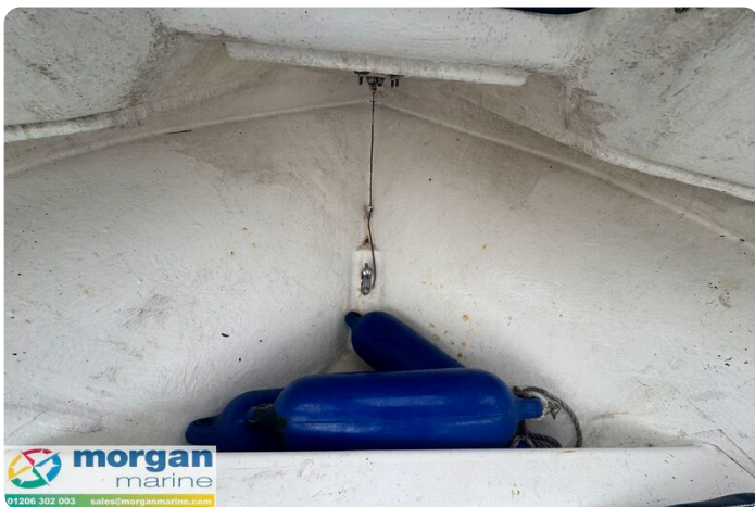
Predator 165 sea angler - fenders