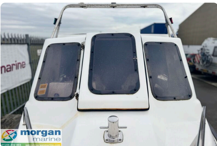
Predator 165 sea angler - bow window