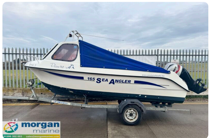
Predator 165 sea angler - Side