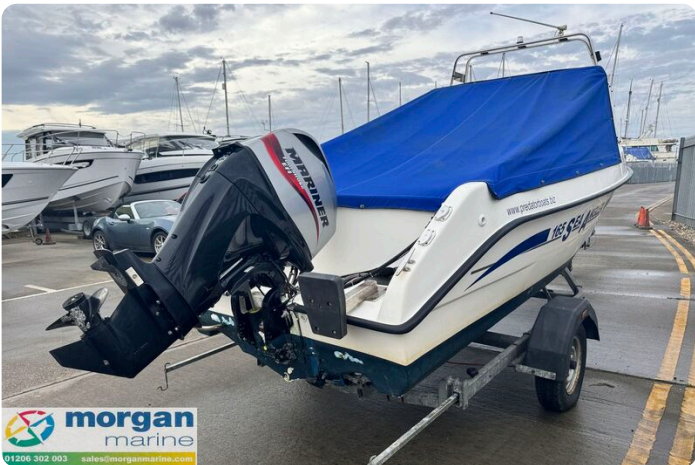
Predator 165 sea angler - aux bracket