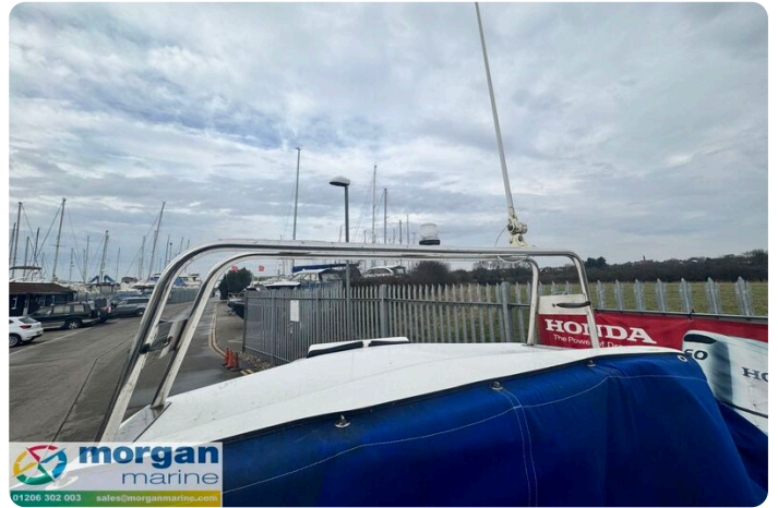
Predator 165 sea angler - arch