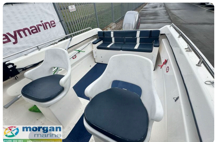
Predator 165 sea angler - co pilot