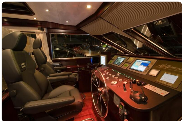
Pacific Prestige 200