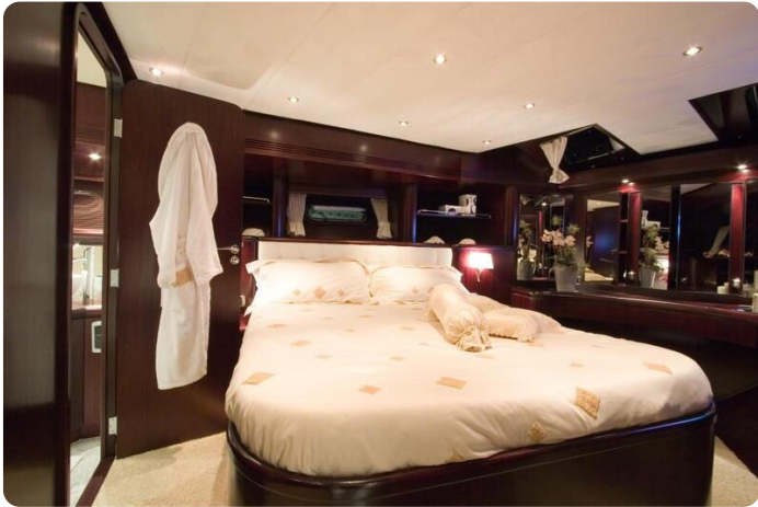
Pacific Prestige 200