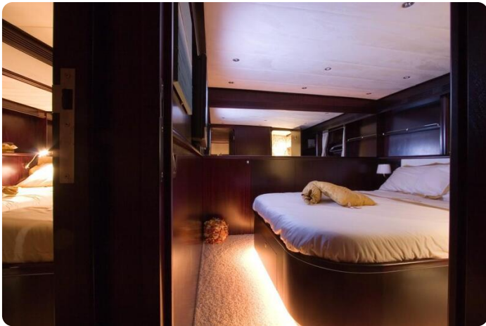
Pacific Prestige 200