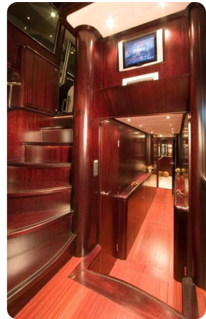
Pacific Prestige 200