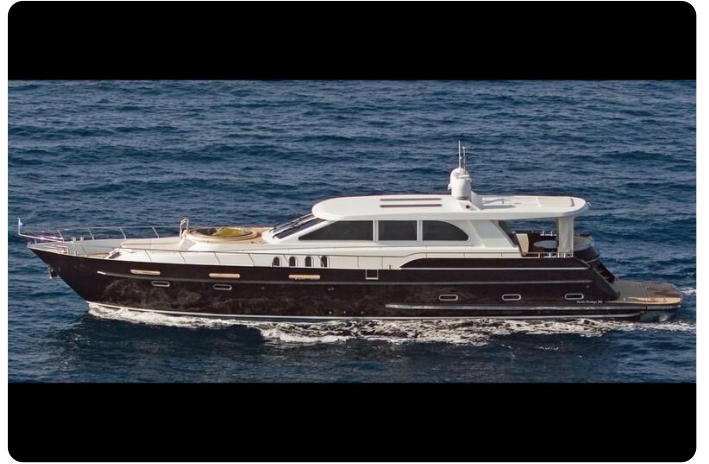
Pacific Prestige 200