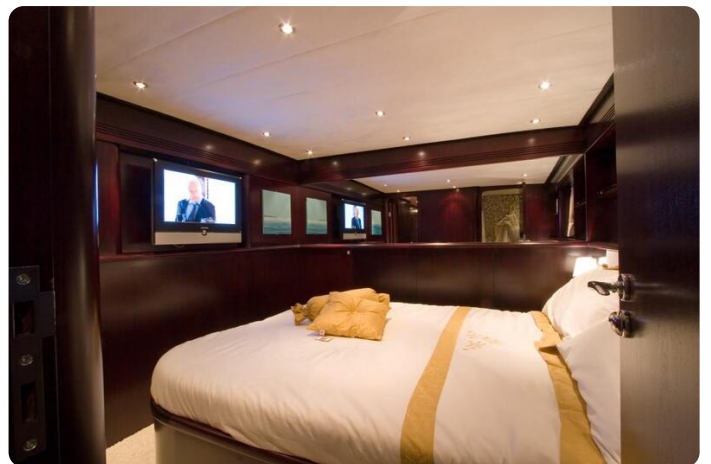
Pacific Prestige 200