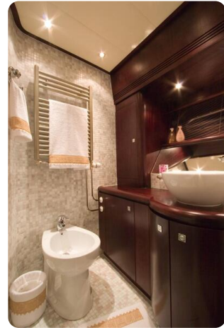
Pacific Prestige 200