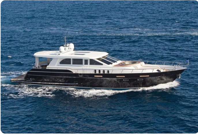
Pacific Prestige 200