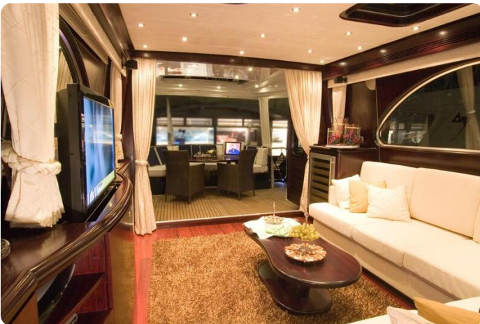
Pacific Prestige 200