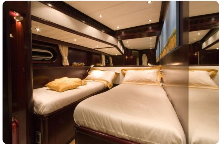
Pacific Prestige 200