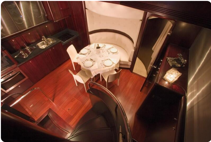
Pacific Prestige 200