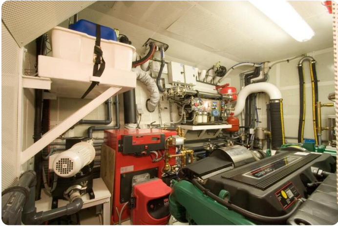
Pacific Prestige 200