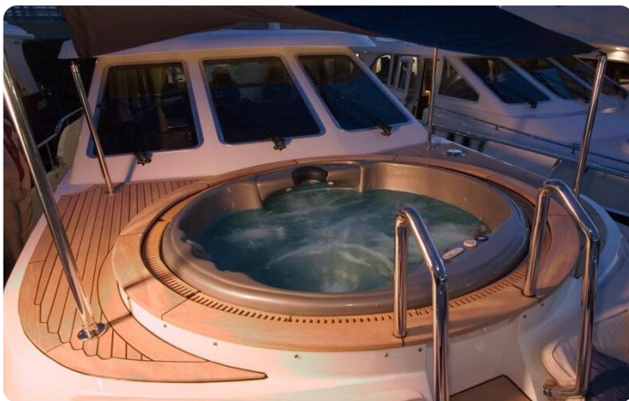
Pacific Prestige 200