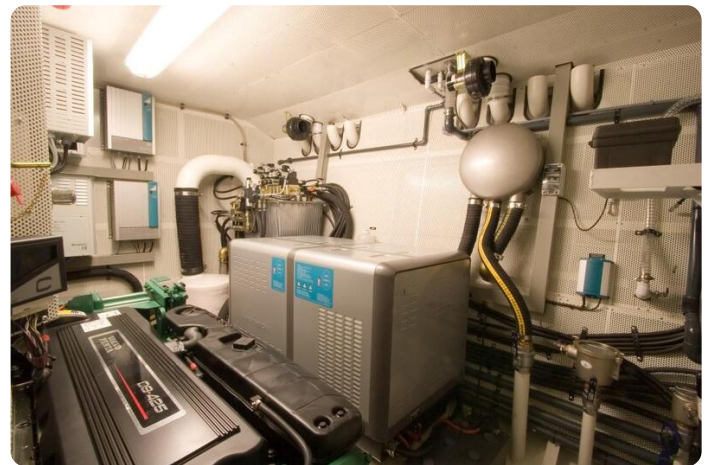
Pacific Prestige 200