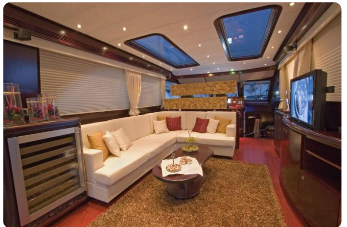
Pacific Prestige 200