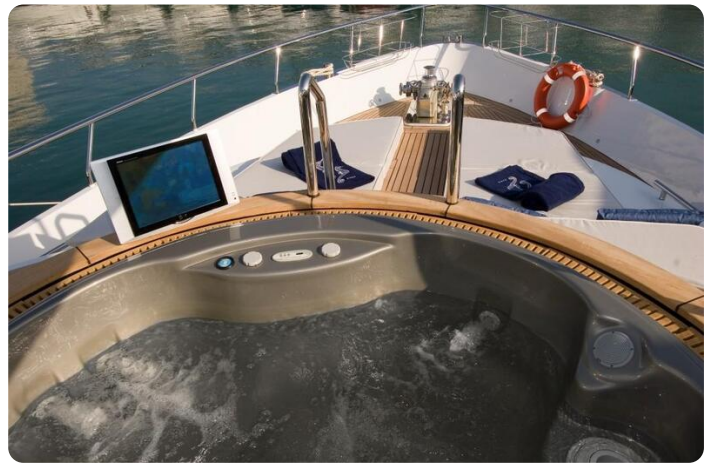
Pacific Prestige 200