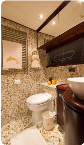
Pacific Prestige 200