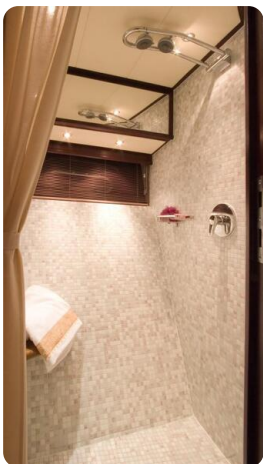
Pacific Prestige 200