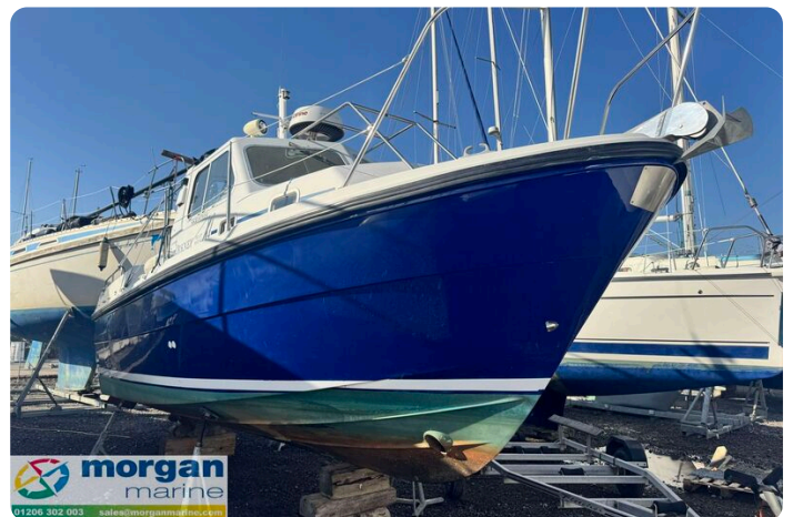
Orkney Day Angler 24 - side