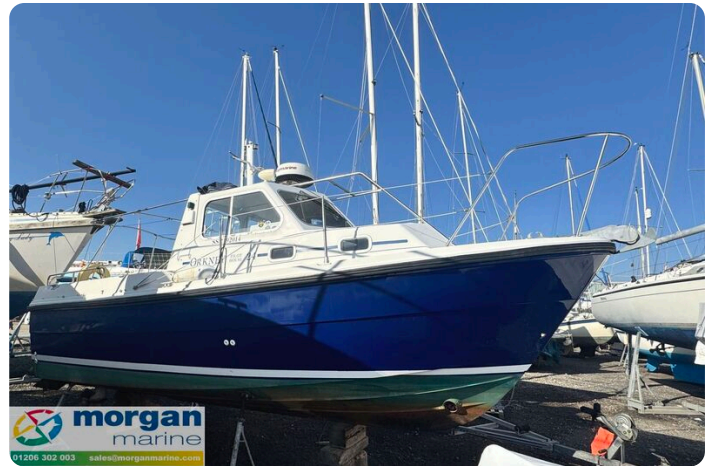
Orkney Day Angler 24 - blue