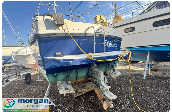
Orkney Day Angler 24 - ladder