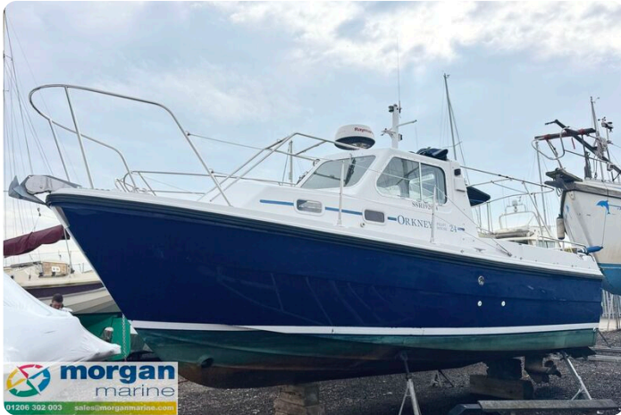
Orkney Day Angler 24 - Main