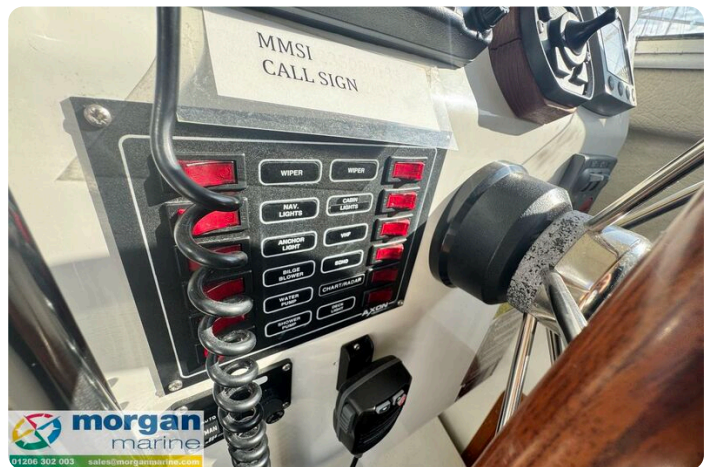
Orkney Day Angler 24 - controls