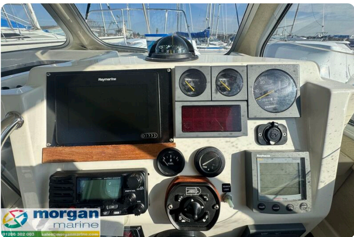
Orkney Day Angler 24 - dash