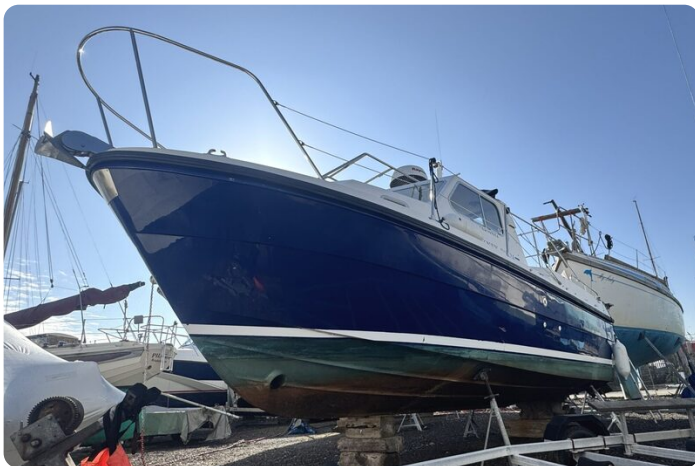
Orkney Day Angler 24 - bow