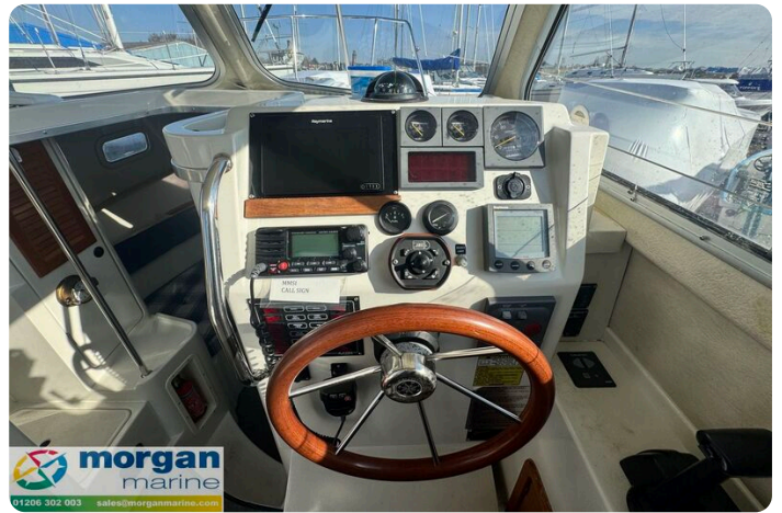
Orkney Day Angler 24 - wheel