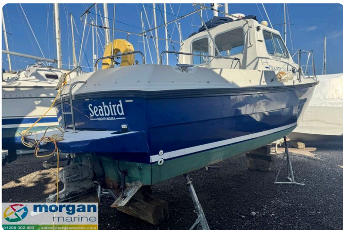
Orkney Day Angler 24 - trim tabs