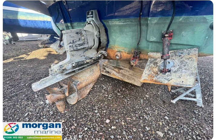
Orkney Day Angler 24 - engine prop