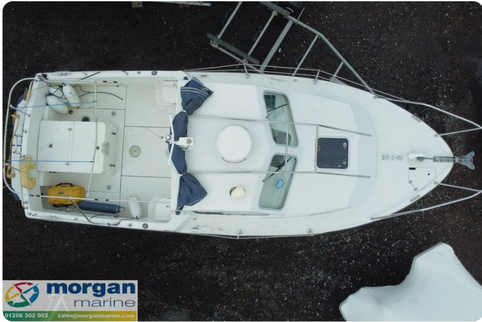
Orkney Day Angler 24 - roof