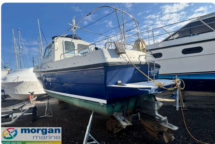
Orkney Day Angler 24 - bracket