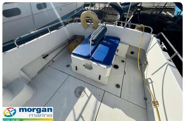
Orkney Day Angler 24 - seating