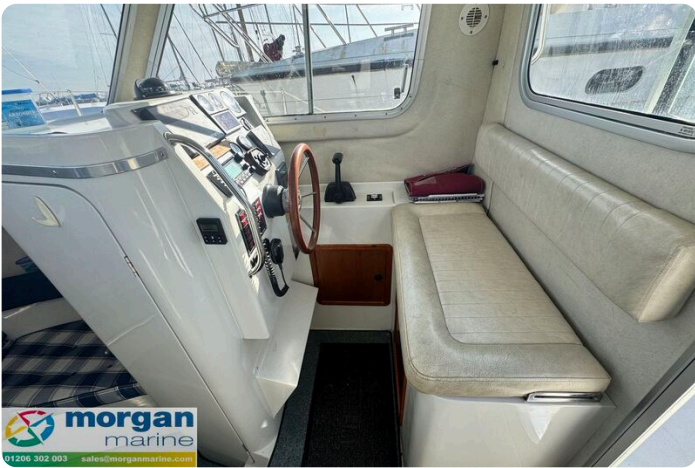
Orkney Day Angler 24 - pilot seat