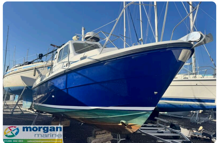
Orkney Day Angler 24 - Main