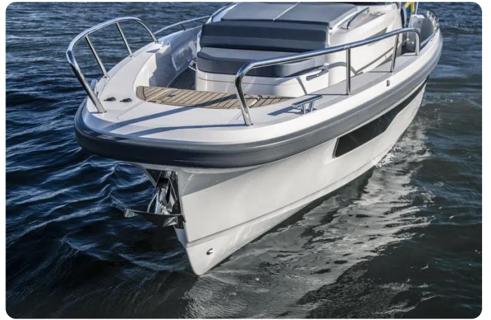
Nimbus Tender 11 (T11) Exterior 4