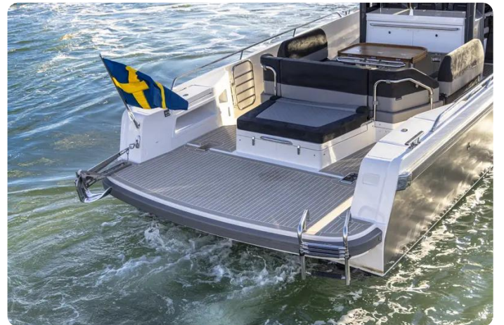
Nimbus Tender 11 (T11) Exterior 14