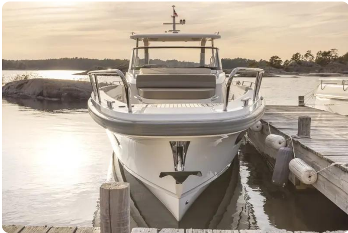
Nimbus Tender 11 (T11) Exterior 5