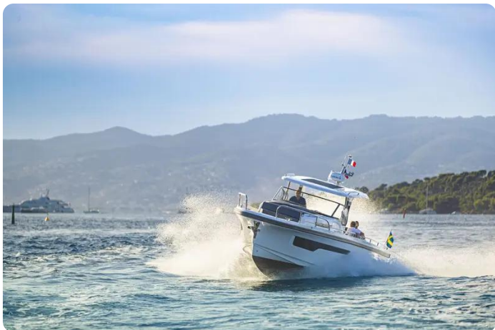
Nimbus Tender 11 (T11) Exterior 3