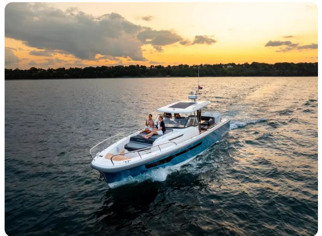
Nimbus Tender 11 (T11) Exterior 1