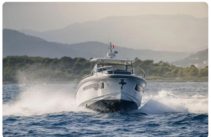
Nimbus Tender 11 (T11) Exterior 2