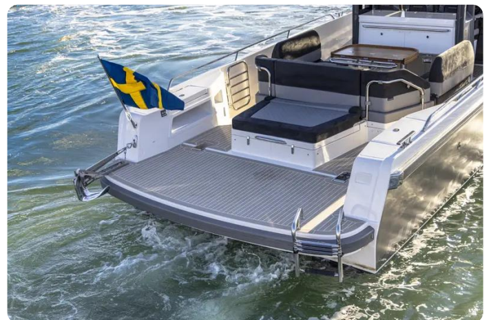
Nimbus Tender 11 (T11) Exterior 14