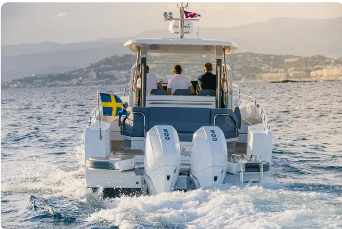
Nimbus Tender 11 (T11) Exterior 13