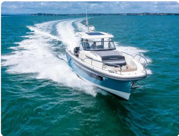
Nimbus Tender 11 (T11) Exterior 6