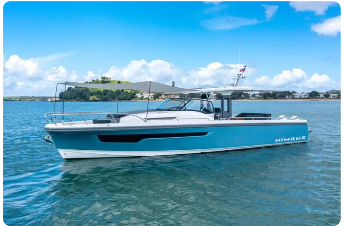
Nimbus Tender 11 (T11) Exterior 7