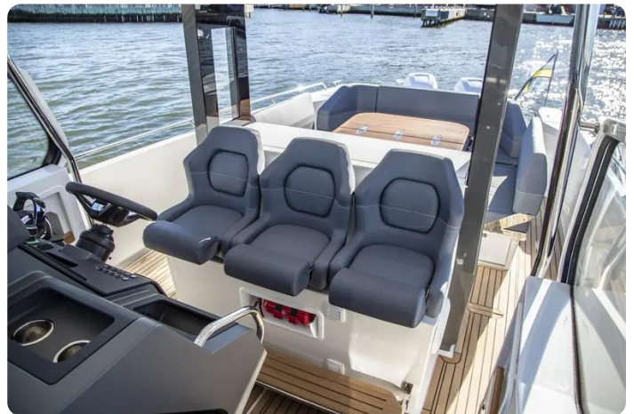
Nimbus Tender 11 (T11) Deck 1