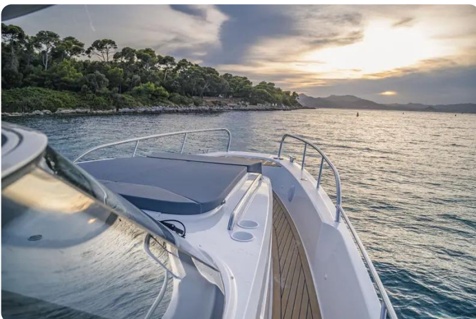
Nimbus Tender 11 (T11) Deck 2