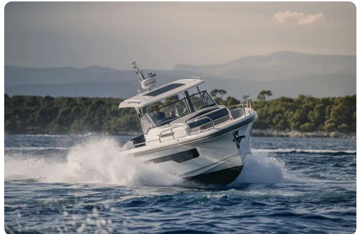
Nimbus Tender 11 (T11) Exterior 12