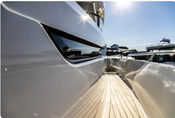
Nimbus Tender 11 (T11) Deck 3