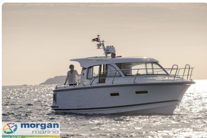
Nimbus 305 Coupe Exterior 1