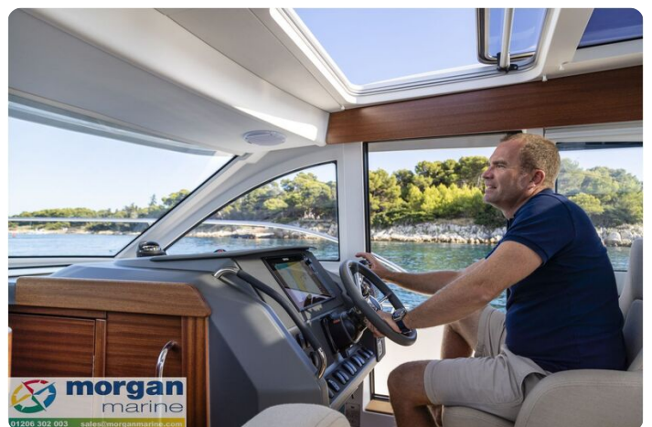
Nimbus 305 Coupe Interior 2