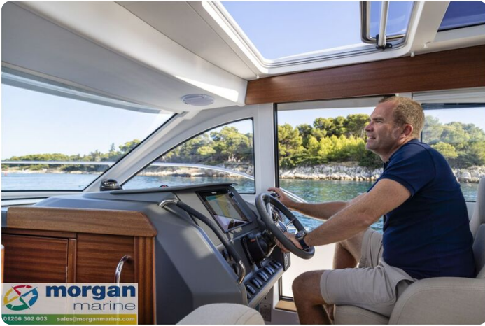
Nimbus 305 Coupe Interior 2