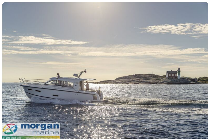
Nimbus 305 Coupe Exterior 2