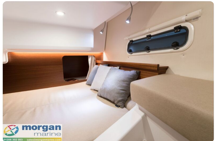
Nimbus 305 Coupe Cabin 4