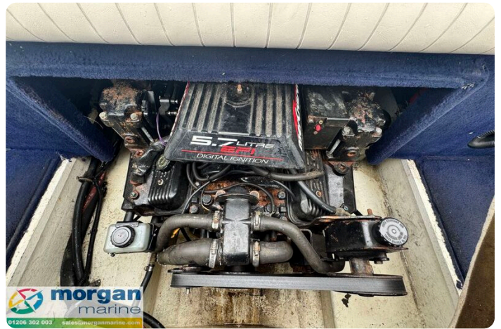
Monterey 236 - engine