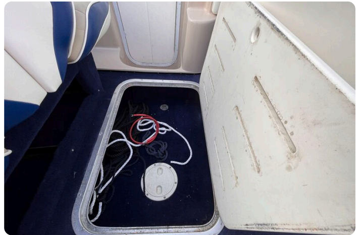
Monterey 236 - locker