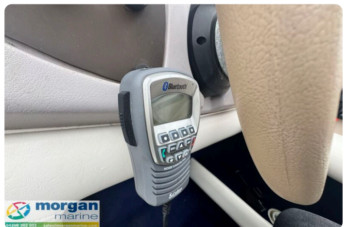
Monterey 236 - VHF