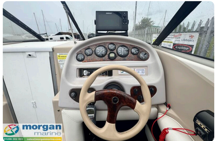
Monterey 236 - wheel