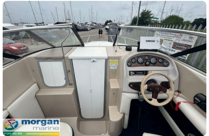
Monterey 236 - walk through