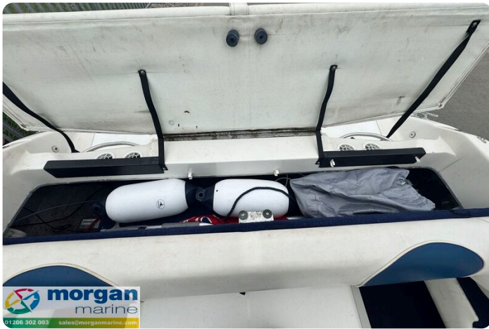
Monterey 236 - fenders