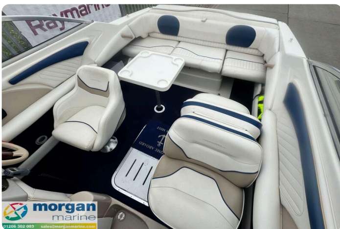
Monterey 236 - table