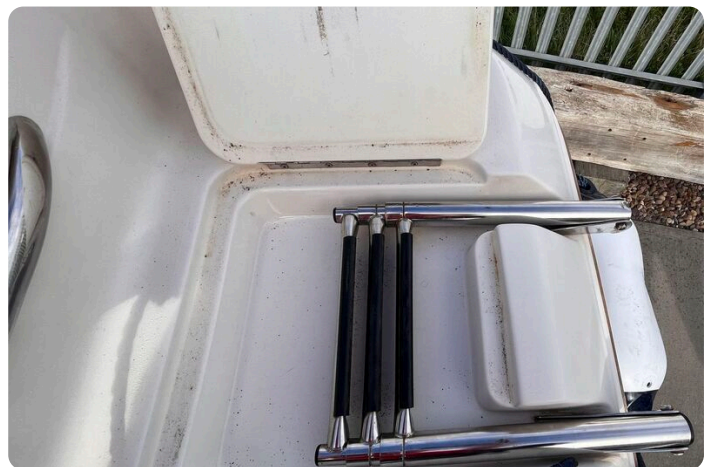
Monterey 236 - ladder folded up