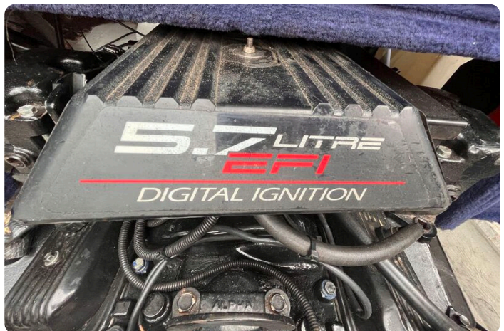
Monterey 236 - engine make