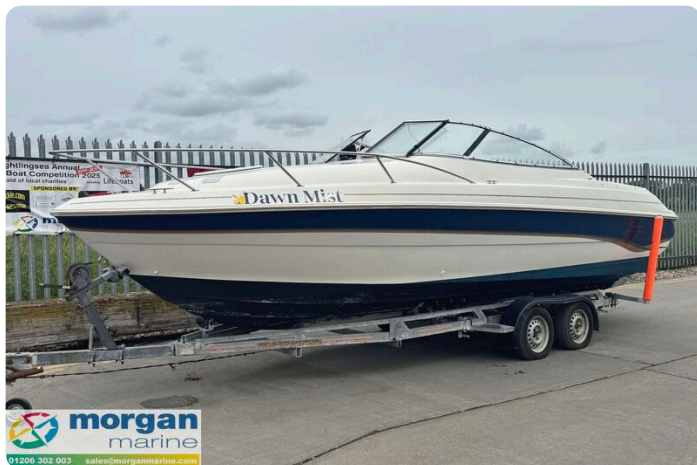
Monterey 236 - Main