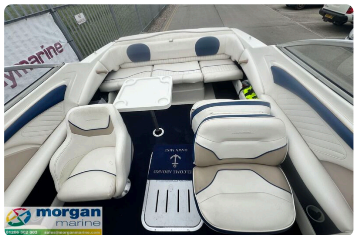
Monterey 236 - seats