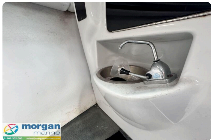
Mariah Shabah 218 - sink