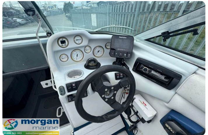
Mariah Shabah 218 - wheel