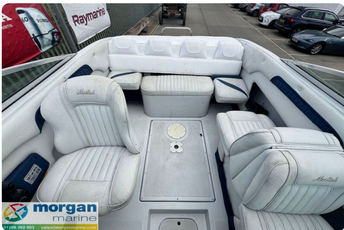
Mariah Shabah 218 - cockpit