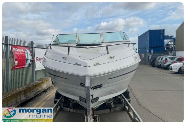
Mariah Shabah 218 - bow view