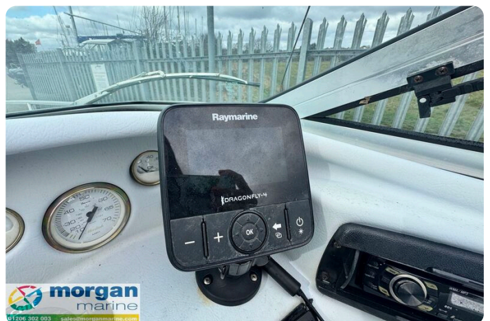
Mariah Shabah 218 - Raymarine