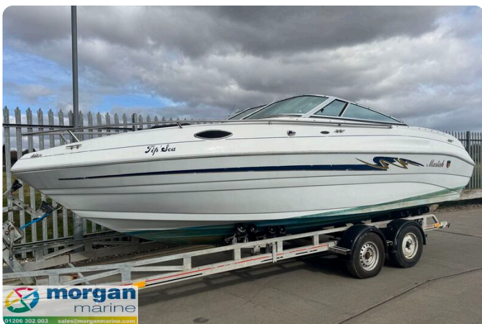
Mariah Shabah 218 - trailer