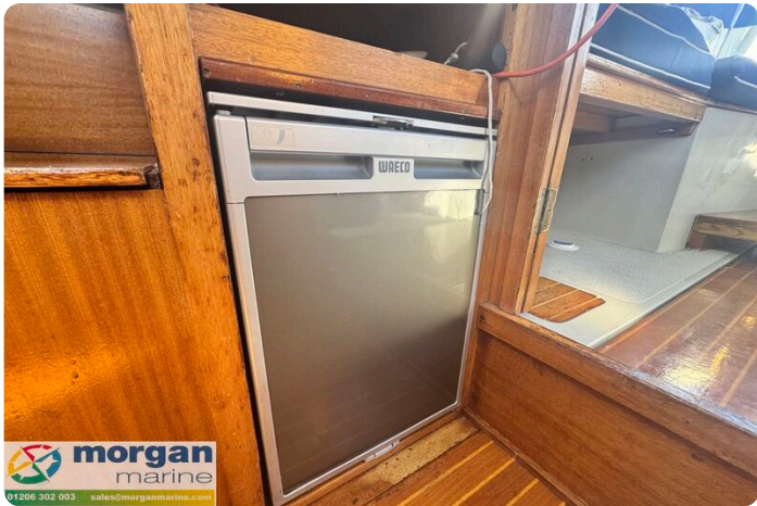
LM 27 Motor Sailer - fridge