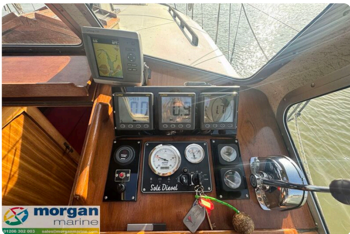
LM 27 Motor Sailer - controls