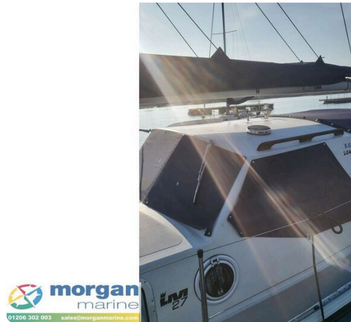
LM 27 Motor Sailer - window covers