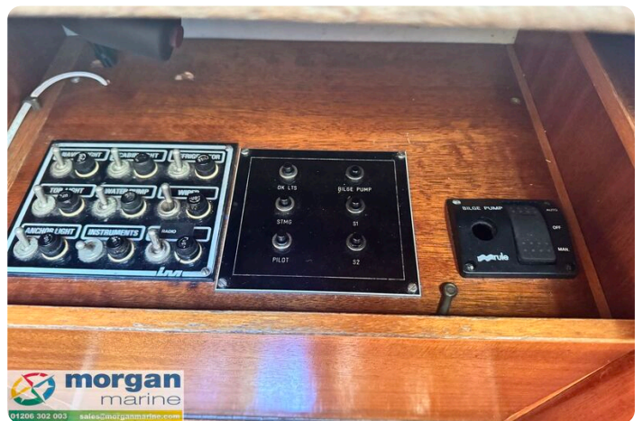
LM 27 Motor Sailer - switch panel