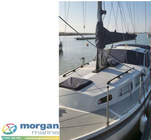
LM 27 Motor Sailer - hatch cover