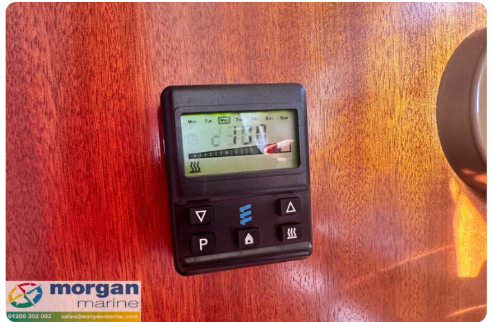
LM 27 Motor Sailer - Heating