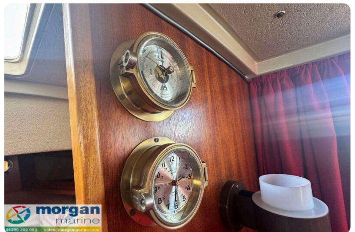
LM 27 Motor Sailer - clocks