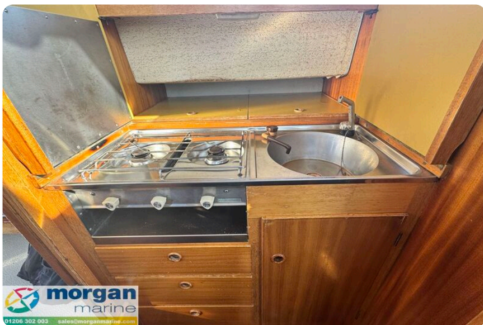
LM 27 Motor Sailer - galley