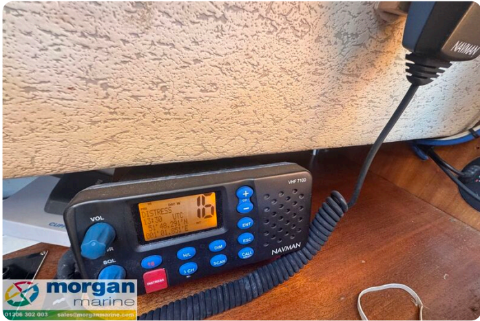
LM 27 Motor Sailer - VHF