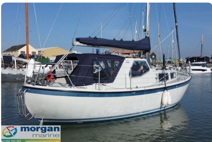
LM 27 Motor Sailer - back