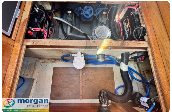
LM 27 Motor Sailer - storage