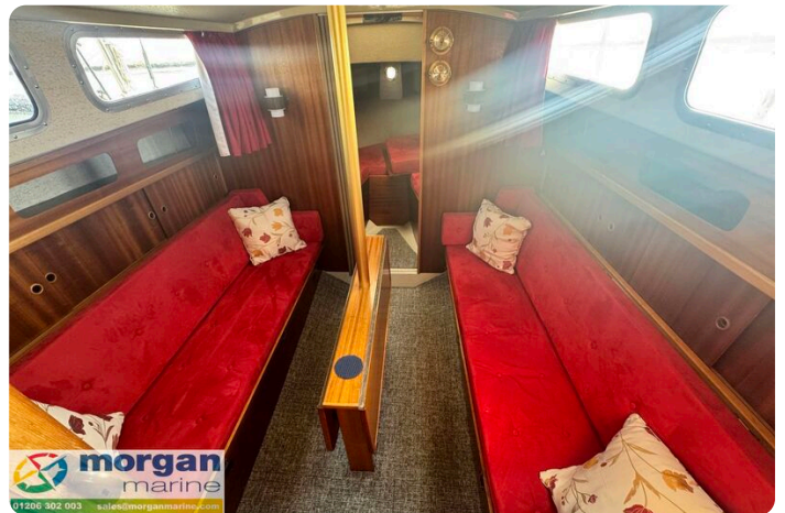
LM 27 Motor Sailer - saloon table