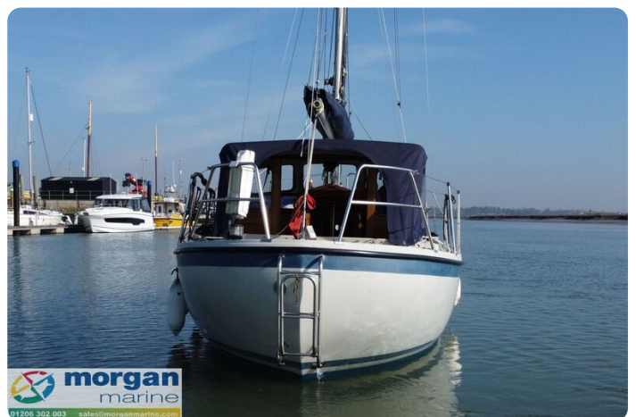
LM 27 Motor Sailer - boarding ladder