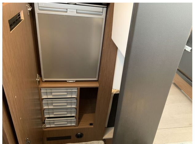
Jeanneau NC 37 twin diesel cruiser - fridge and storage