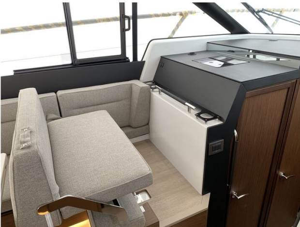
Jeanneau NC 37 twin diesel cruiser - copilot bench