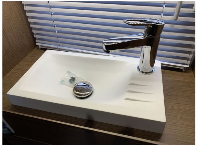
Jeanneau NC 37 twin diesel cruiser - sink in toilet compartment