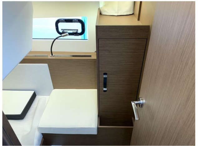
Jeanneau NC 37 twin diesel cruiser - 3rd cabin with berth and cupboard