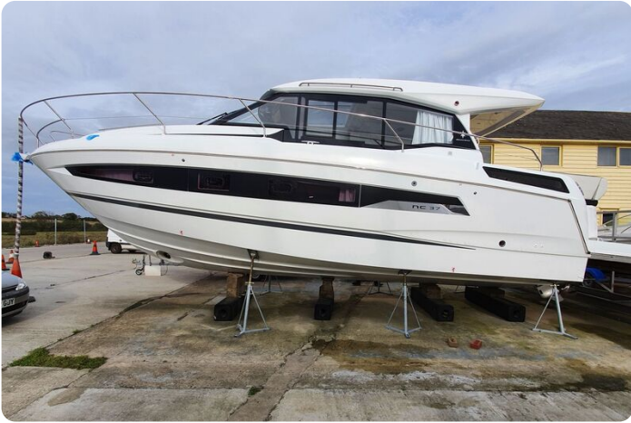
Jeanneau NC 37 twin diesel cruiser