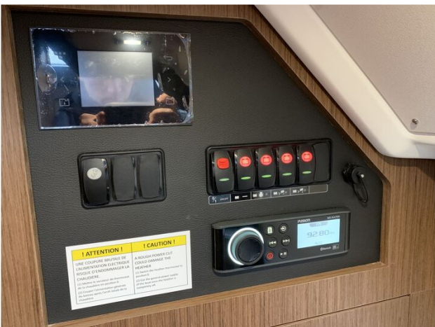
Jeanneau NC 37 twin diesel cruiser - audio controls and switch panel