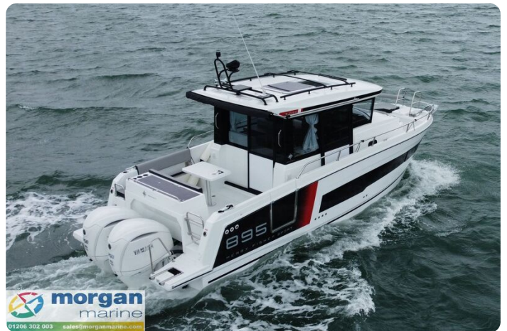
Jeanneau Merry Fisher 895 Sport - Series 2 - starboard side transom and cockpit