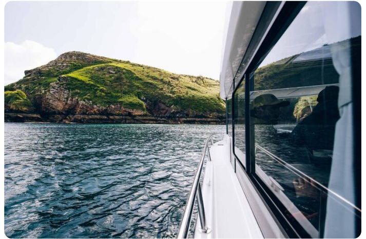
Jeanneau Merry Fisher 895 Sport - Series 2 - port side