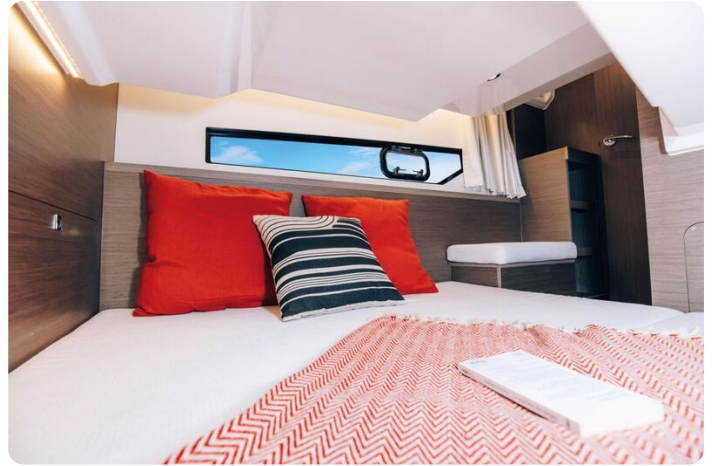
Jeanneau Merry Fisher 895 Sport - Series 2 - aft cabin