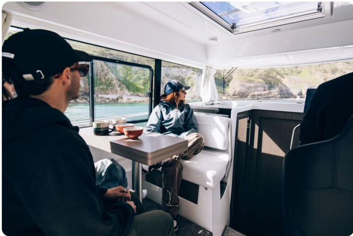
Jeanneau Merry Fisher 895 Sport - Series 2 - co-pilot seat converts to seating at table