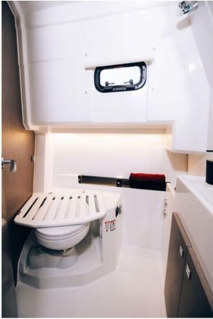
Jeanneau Merry Fisher 895 Sport - Series 2 - toilet and shower compartment