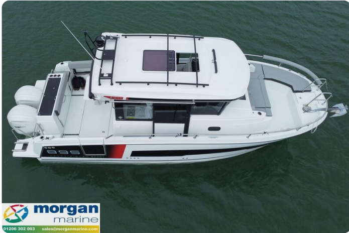
Jeanneau Merry Fisher 895 Sport - Series 2 - overhead view from starboard side