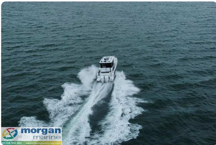
Jeanneau Merry Fisher 895 Sport - Series 2 - on the water