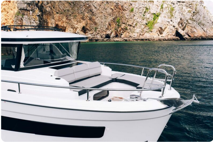
Jeanneau Merry Fisher 895 Sport - Series 2 - bow cushions