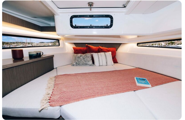
Jeanneau Merry Fisher 895 Sport - Series 2 - forward cabin