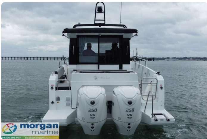
Jeanneau Merry Fisher 895 Sport - Series 2 - twin Yamaha engines