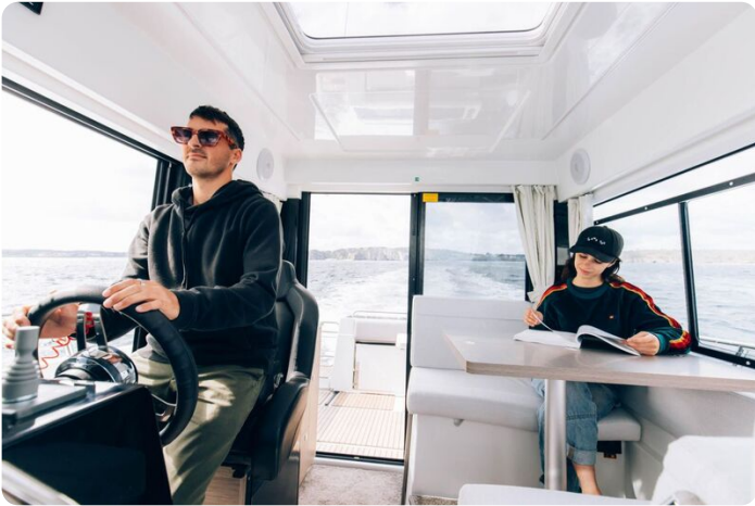
Jeanneau Merry Fisher 895 Sport - Series 2 - helm position and saloon