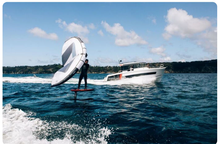
Jeanneau Merry Fisher 895 Sport - Series 2 - great for fun on the water and water sports