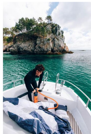
Jeanneau Merry Fisher 895 Sport - Series 2 - bow seating