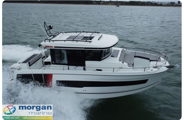
Jeanneau Merry Fisher 895 Sport - Series 2