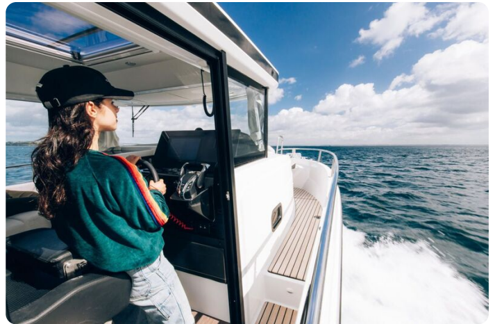
Jeanneau Merry Fisher 895 Sport - Series 2 - helm side door and wide side deck