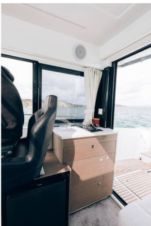
Jeanneau Merry Fisher 895 Sport - Series 2 - wheelhouse galley