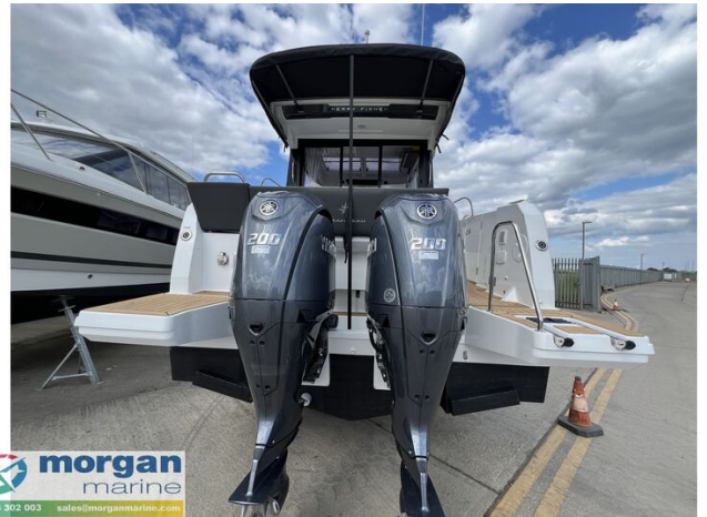
Jeanneau Merry Fisher 895 Series 2 - transom with twin Yamaha 200 outboards