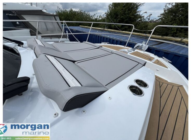
Jeanneau Merry Fisher 895 Series 2 - view from bow seating to pulpits rails