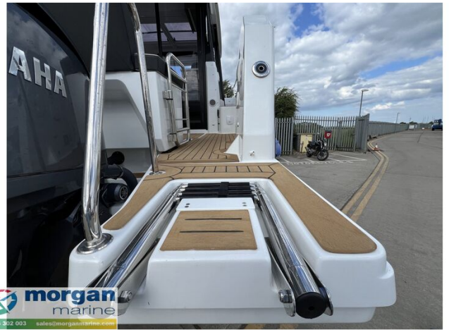
Jeanneau Merry Fisher 895 Series 2 - swim platform with folding boarding ladder