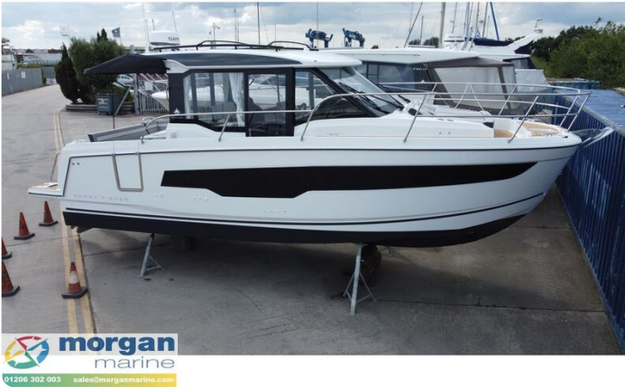
Jeanneau Merry Fisher 895 Series 2 - towards starboard side