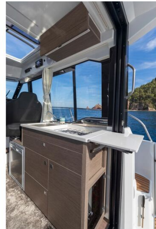
Jeanneau Merry Fisher 895 - starboard side galley