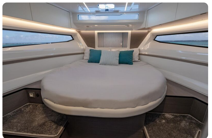
Jeanneau Merry Fisher 895 - forward cabin with double berth