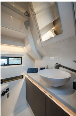
Jeanneau Merry Fisher 895 - toilet compartment