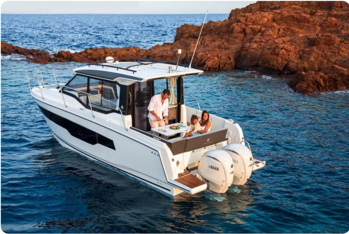
Jeanneau Merry Fisher 895 - view of aft cockpit from port side