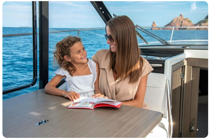
Jeanneau Merry Fisher 895 - sitting at the saloon table