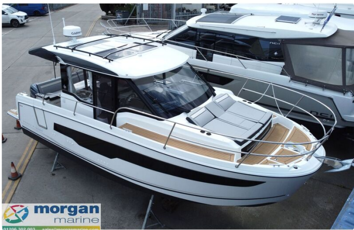
Jeanneau Merry Fisher 895 Series 2