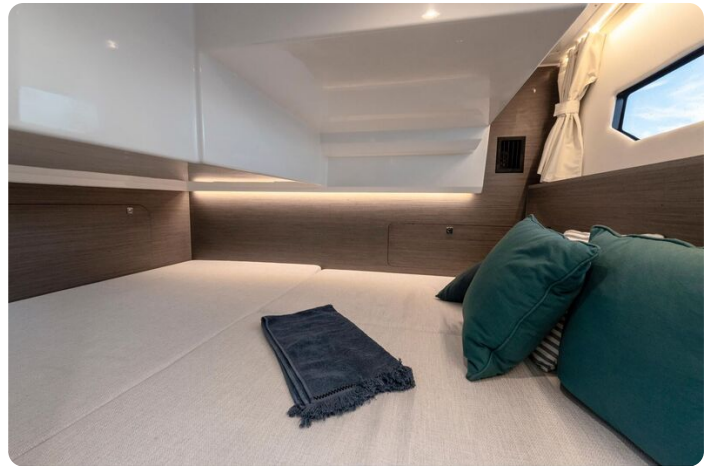
Jeanneau Merry Fisher 895 - double berth in aft cabin