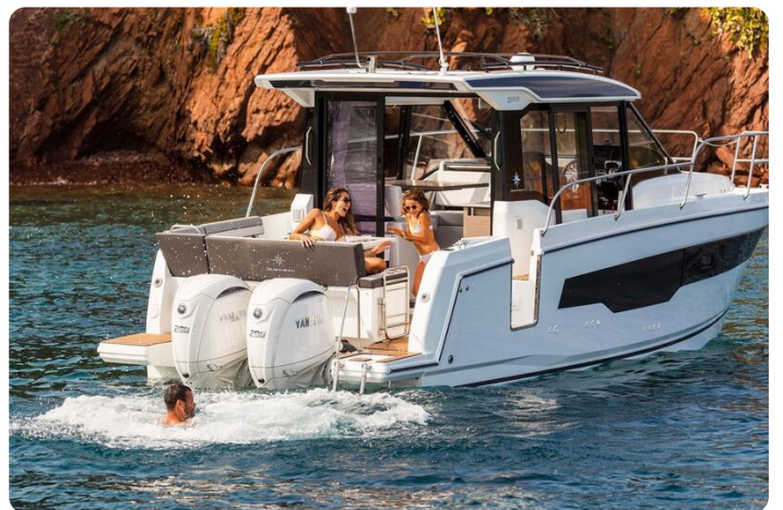
Jeanneau Merry Fisher 895 - transom with twin engines and swim platforms