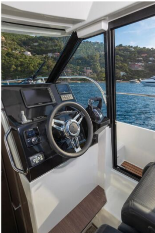
Jeanneau Merry Fisher 895 - helm position