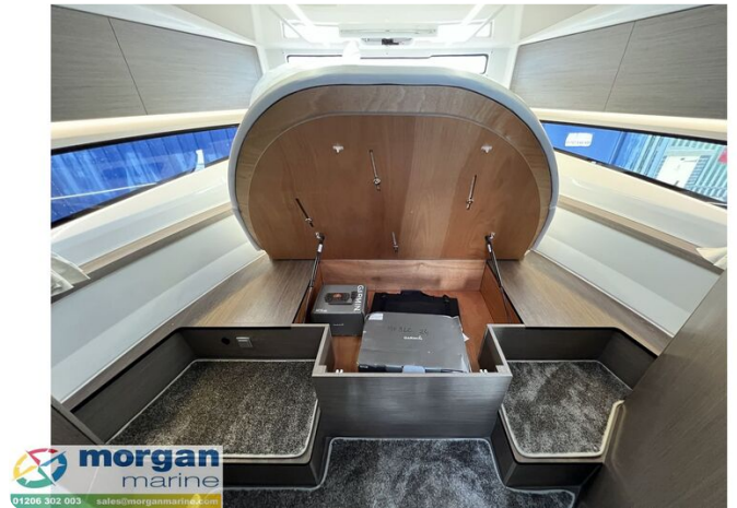
Jeanneau Merry Fisher 895 Series 2 - storage under berth