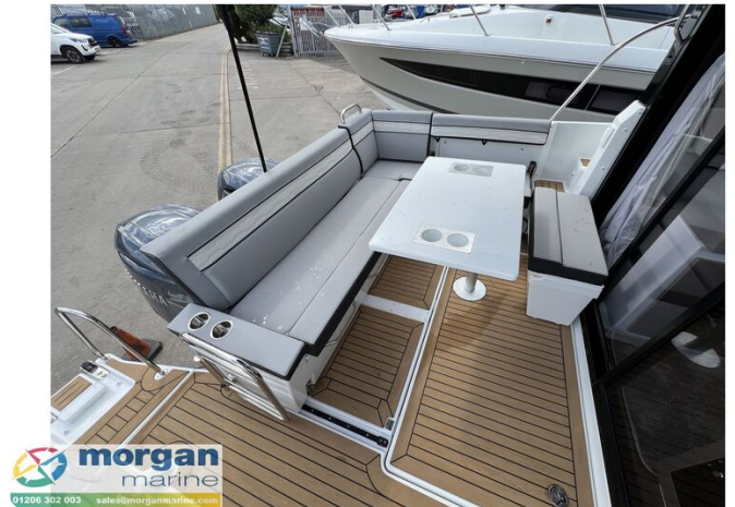
Jeanneau Merry Fisher 895 Series 2 - U shape cockpit seating and table