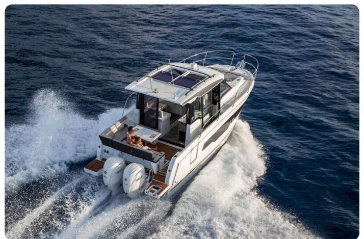
Jeanneau Merry Fisher 895 - overhead view from starboard side aft