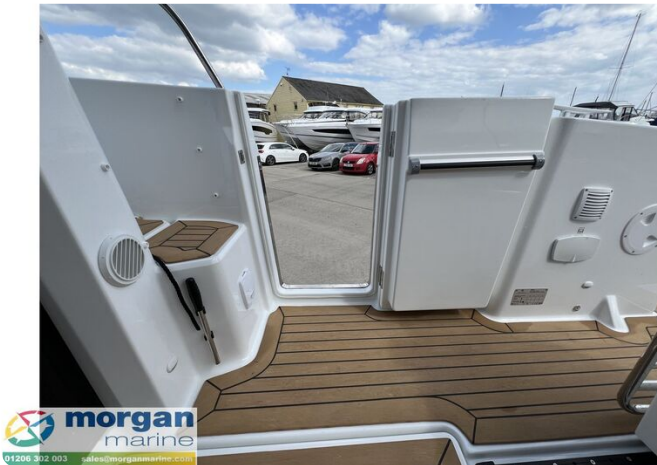
Jeanneau Merry Fisher 895 Series 2 - cockpit side gate