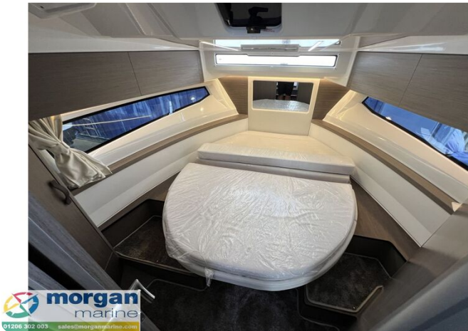
Jeanneau Merry Fisher 895 Series 2 - forward cabin