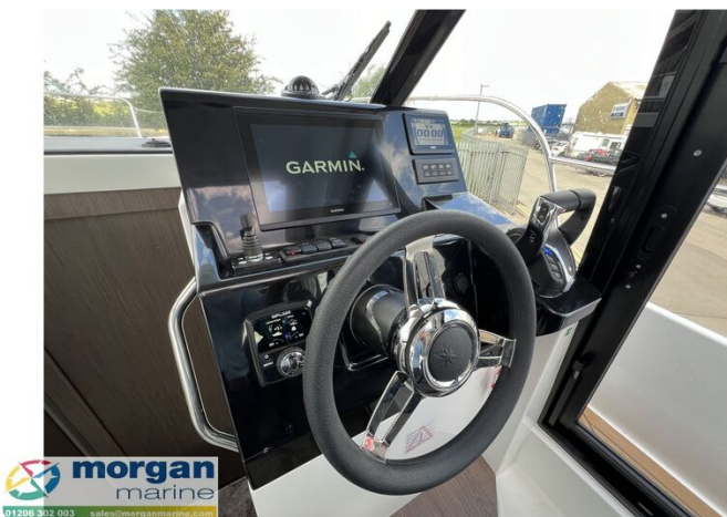
Jeanneau Merry Fisher 895 Series 2 - helm position and side door