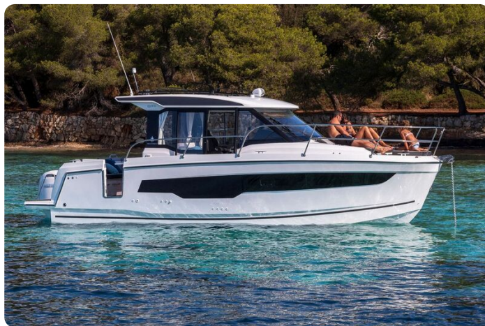
Jeanneau Merry Fisher 895 Series 2 - starboard side view on the water