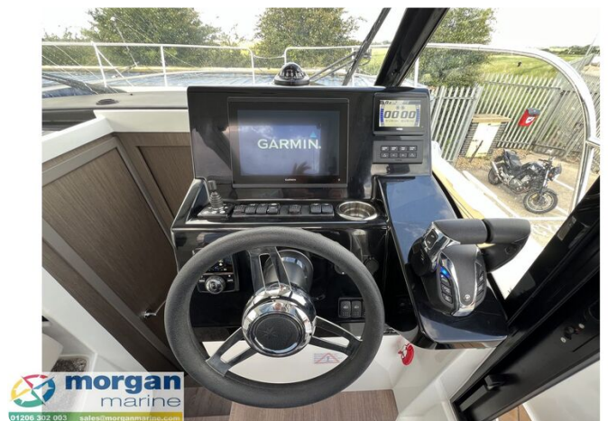
Jeanneau Merry Fisher 895 Series 2 - engine controls