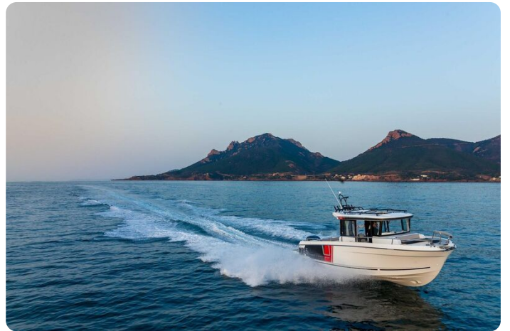
Jeanneau Merry Fisher 795 Sport - Series 2 - moving through the water