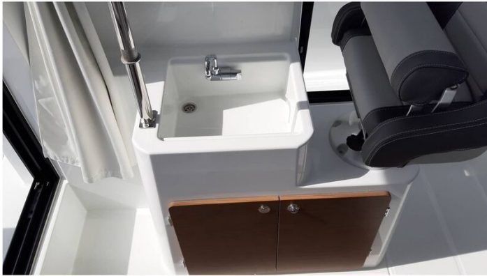
Jeanneau Merry Fisher 795 Sport - Series 2 - galley behind helm seat