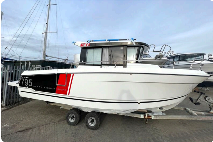
Jeanneau Merry Fisher 795 Sport - Series 2 - at Morgan Marine