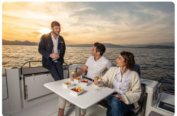
Jeanneau Merry Fisher 795 Sport - Series 2 - aft cockpit table and seating