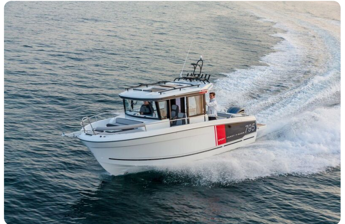
Jeanneau Merry Fisher 795 Sport - Series 2 - on the water