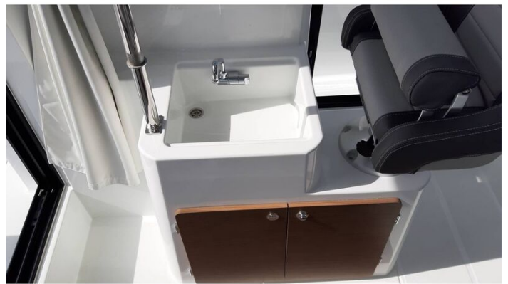
Jeanneau Merry Fisher 795 Sport - Series 2 - galley behind helm seat