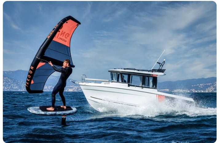
Jeanneau Merry Fisher 795 Sport - Series 2 - great for paddleboards and fun on the water