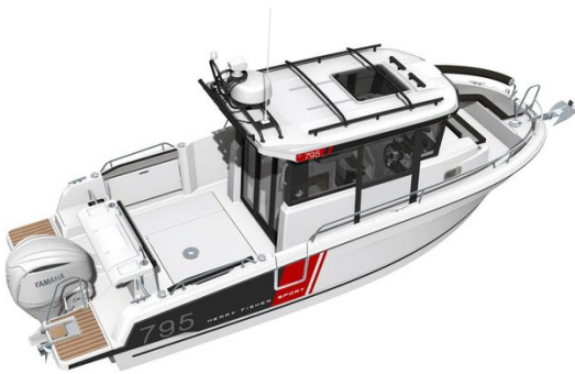
Jeanneau Merry Fisher 795 Sport - Series 2 - render of overhead view