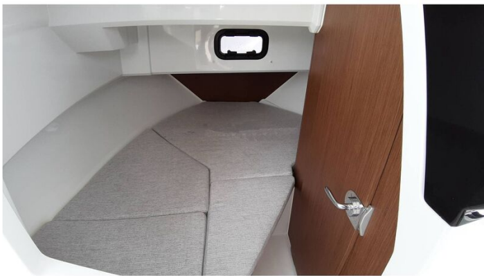
Jeanneau Merry Fisher 795 Sport - Series 2 - forward cuddy with cushions