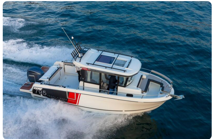
Jeanneau Merry Fisher 795 Sport - Series 2 - overhead view of starboard on the water