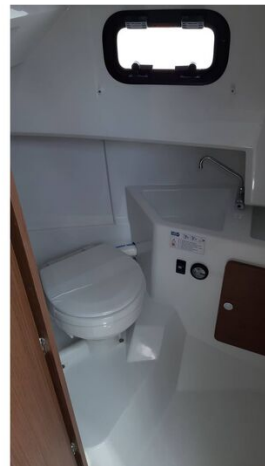
Jeanneau Merry Fisher 795 Sport - Series 2 - toilet compartment