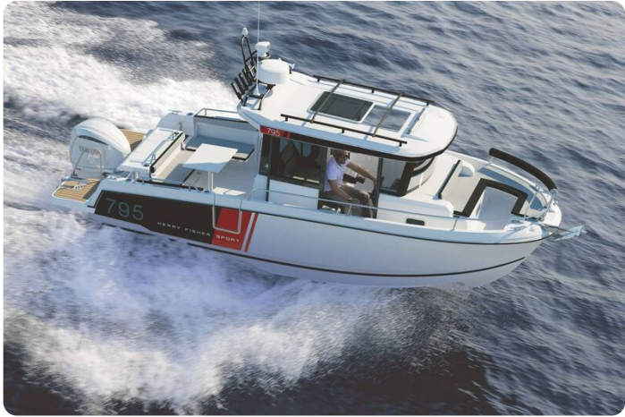
Jeanneau Merry Fisher 795 Sport - Series 2