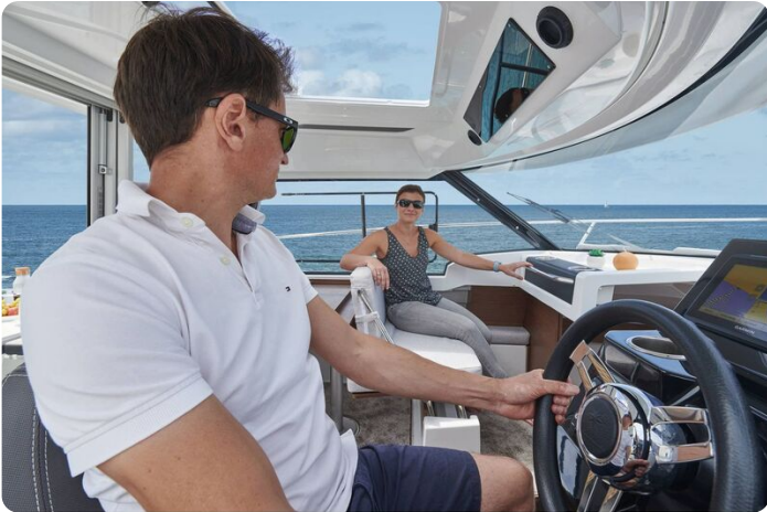
Jeanneau Merry Fisher 795 - pilot and co-pilot seating