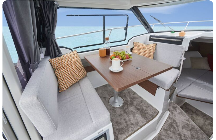
Jeanneau Merry Fisher 795 - wheelhouse saloon with table and seating