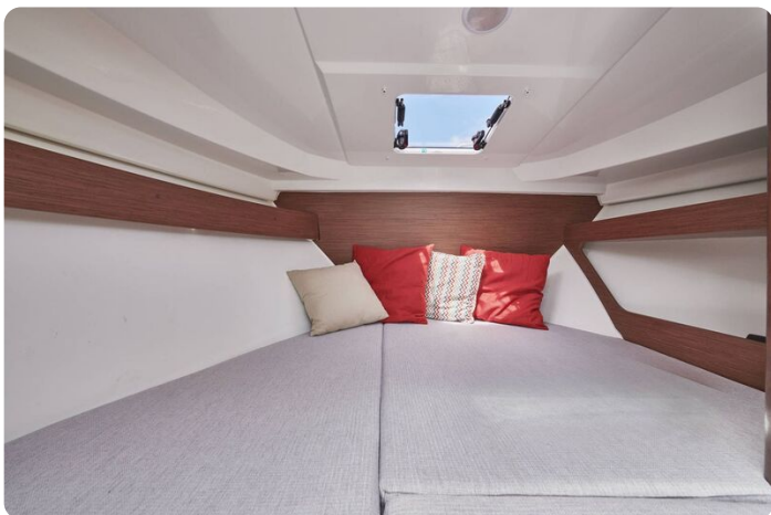
Jeanneau Merry Fisher 795 - double berth in forward cabin