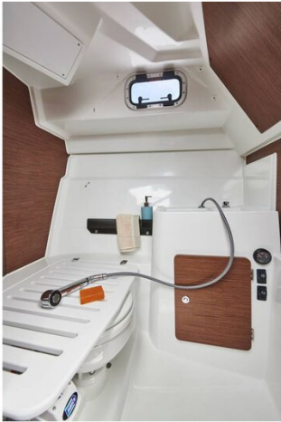
Jeanneau Merry Fisher 795 - toilet and shower compartment