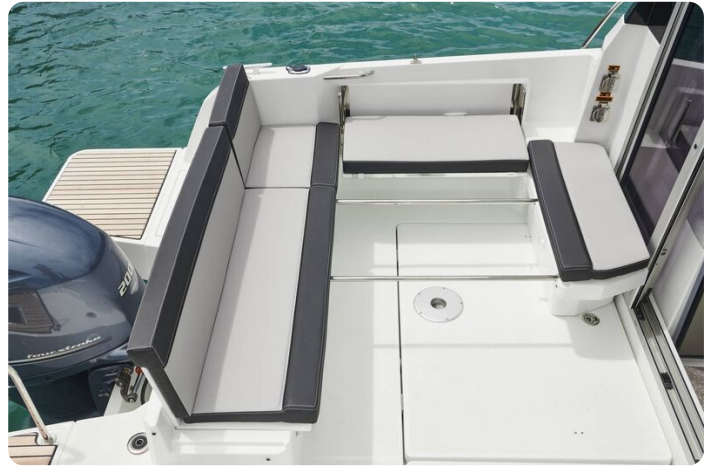
Jeanneau Merry Fisher 795 - U-shape cockpit seating