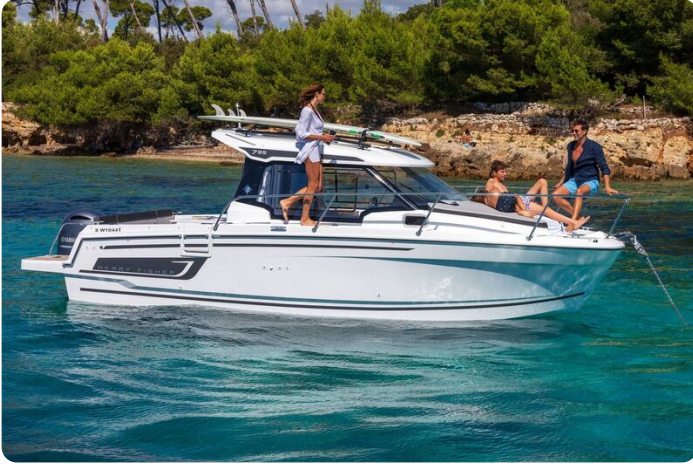
Jeanneau Merry Fisher 795