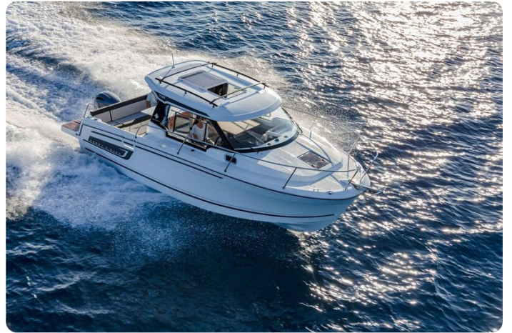
Jeanneau Merry Fisher 795 - overhead view towards bow