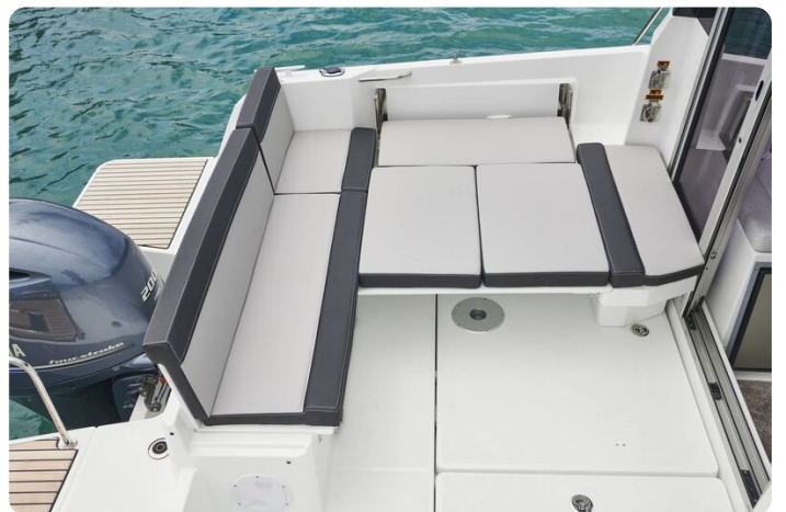
Jeanneau Merry Fisher 795 - cockpit saloon converts to sun lounger