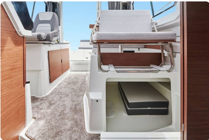
Jeanneau Merry Fisher 795 - storage under seating