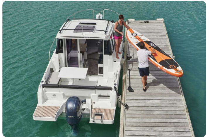
Jeanneau Merry Fisher 795 - storage rack on roof for SUP board