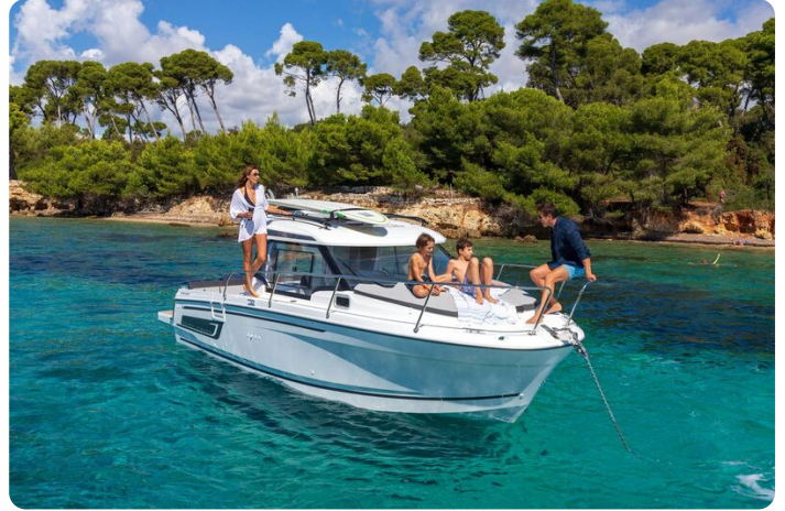
Jeanneau Merry Fisher 795 - side deck for easy access to bow