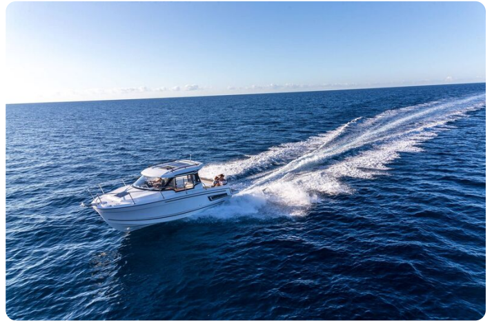
Jeanneau Merry Fisher 795 Series 2 - speeding through the water with a large wake