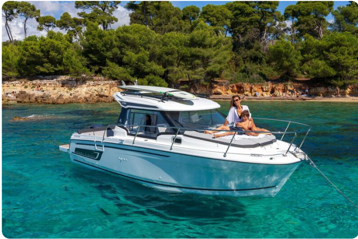
Jeanneau Merry Fisher 795 Series 2 - bow sun lounger