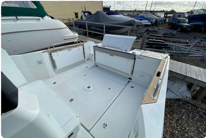
Jeanneau Merry Fisher 795 Marlin-deck