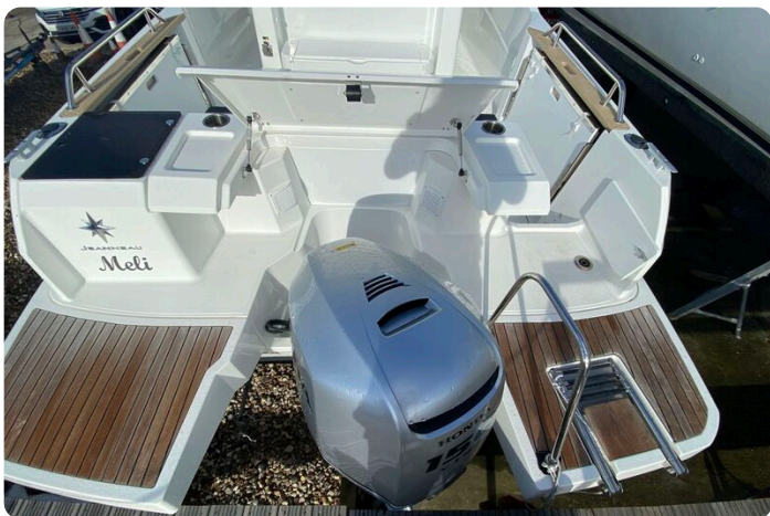
Jeanneau Merry Fisher 795 Marlin-engine