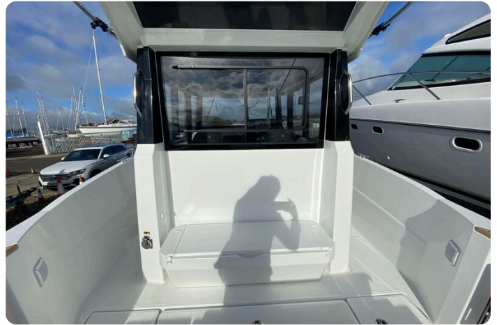
Jeanneau Merry Fisher 795 Marlin-window