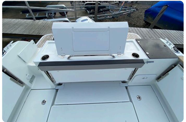
Jeanneau Merry Fisher 795 Marlin-storage