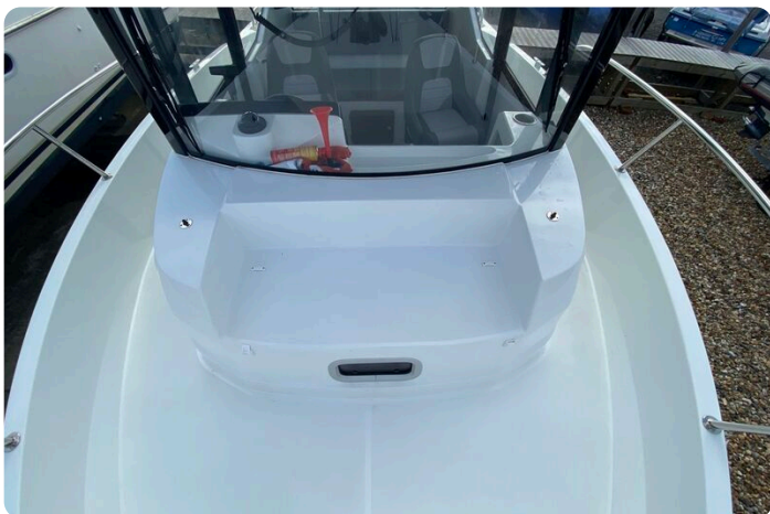
Jeanneau Merry Fisher 795 Marlin-front-seating