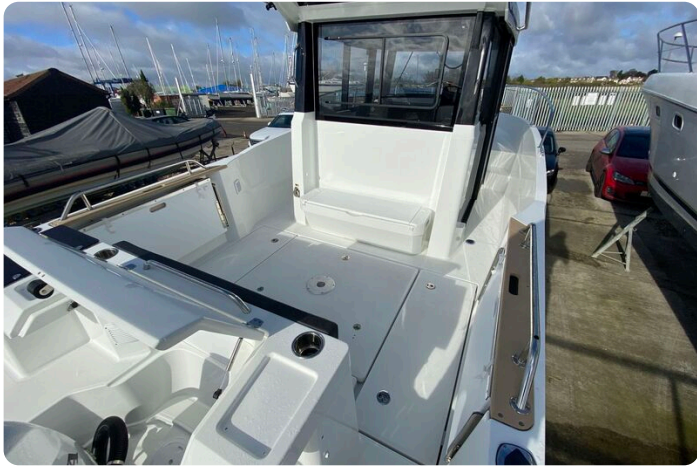
Jeanneau Merry Fisher 795 Marlin-back-deck