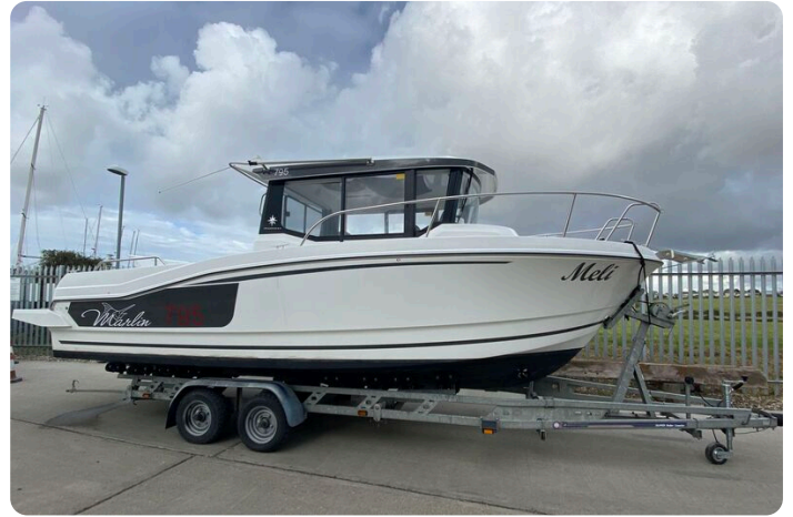
Jeanneau Merry Fisher 795 Marlin - starboard side