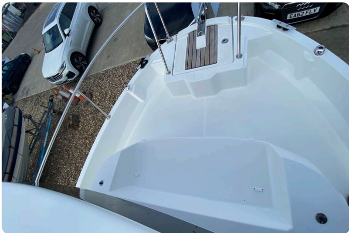
Jeanneau Merry Fisher 795 Marlin-Front