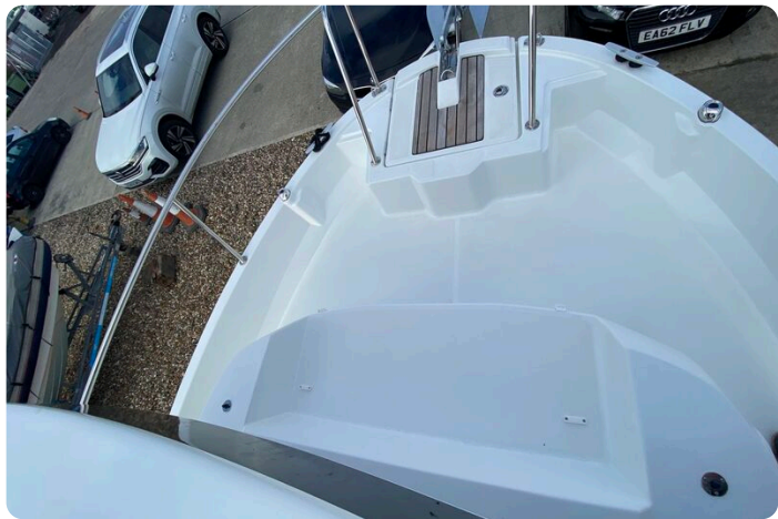
Jeanneau Merry Fisher 795 Marlin-Front