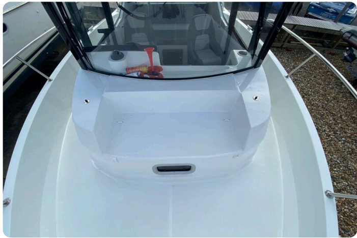
Jeanneau Merry Fisher 795 Marlin-front-seating