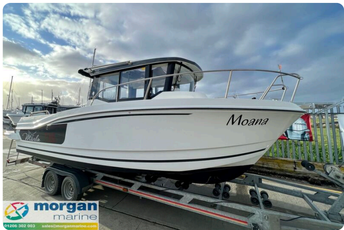
Jeanneau Merry Fisher 795 Marlin - starboard side