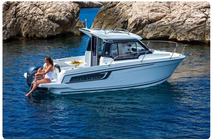
Jeanneau Merry Fisher 605 - on the water