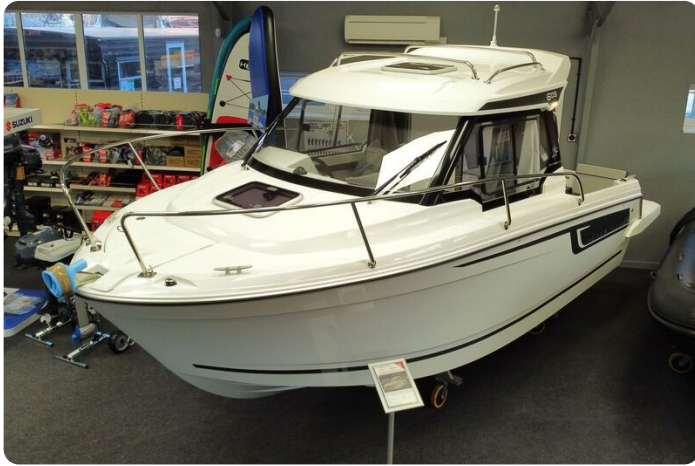
Jeanneau Merry Fisher 605