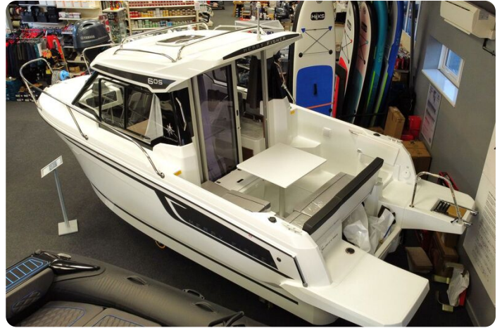
Jeanneau Merry Fisher 605 - aft cockpit salon and table