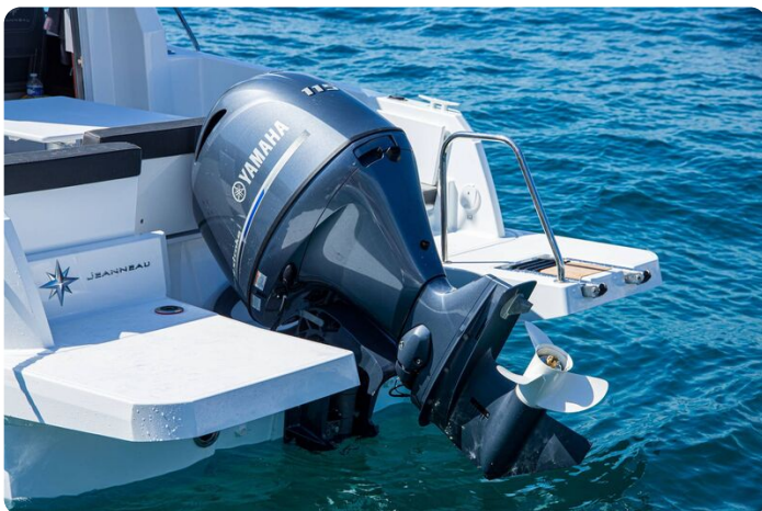
Jeanneau Merry Fisher 605 - swim transom and swim platforms