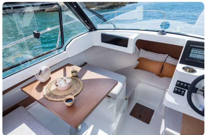
Jeanneau Merry Fisher 605 - wheelhouse with port side salon