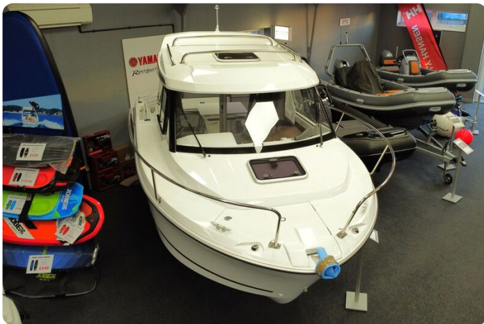
Jeanneau Merry Fisher 605 - bow