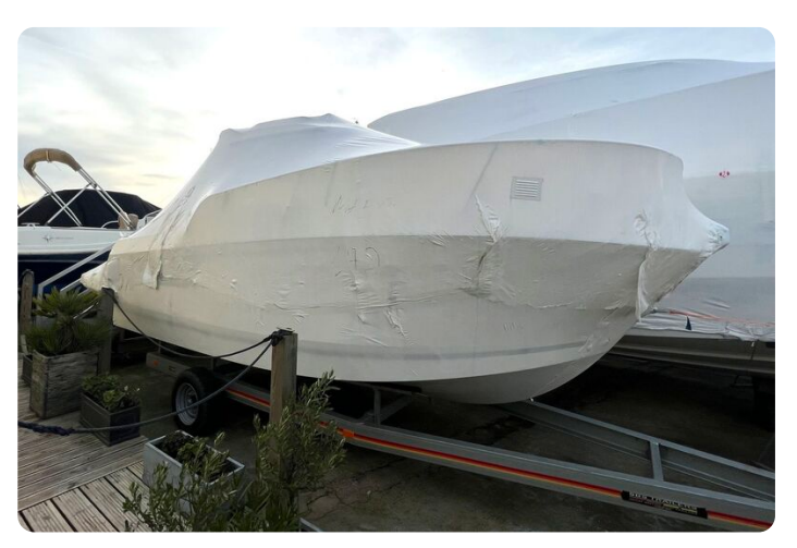
Jeanneau Merry Fisher 605 - still wrapped up