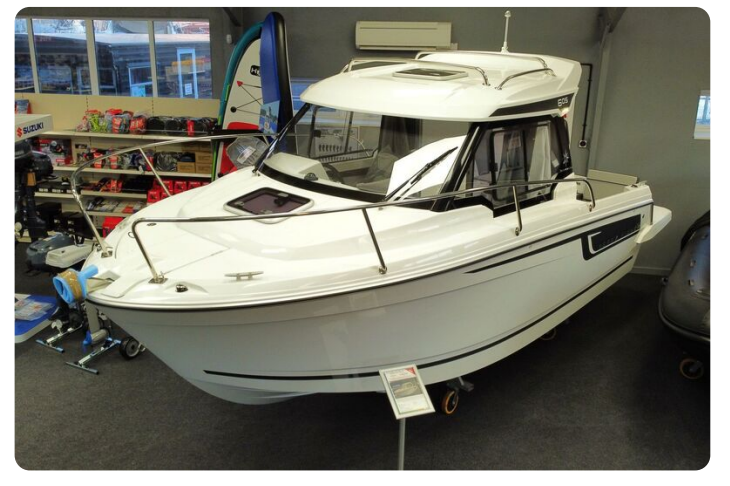
Jeanneau Merry Fisher 605 - in stock at Morgan Marine - view towards bow