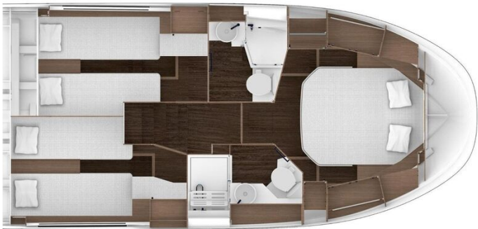
Jeanneau Merry Fisher 1295 Flybridge - diagram of cabins layout