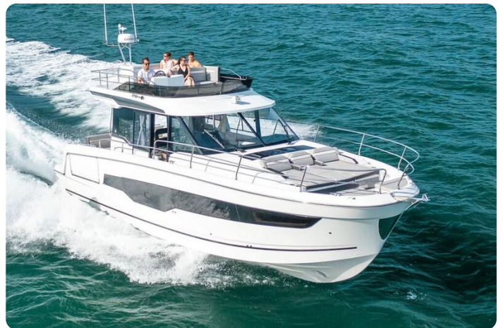
Jeanneau Merry Fisher 1295 Flybridge