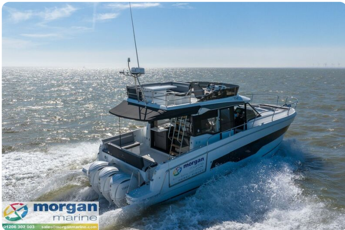
Jeanneau Merry Fisher 1295 Flybridge - overhead view from starboard side aft