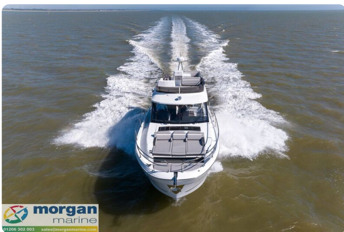
Jeanneau Merry Fisher 1295 Fly - overhead view coming towards camera