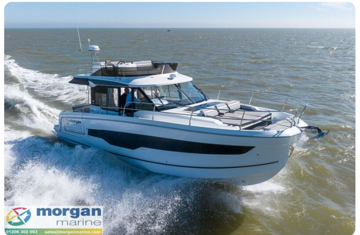
Jeanneau Merry Fisher 1295 Flybridge - overhead view from starboard side