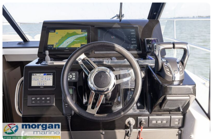
Jeanneau Merry Fisher 1295 Flybridge - dash and engine controls