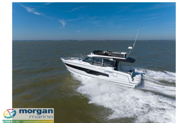
Jeanneau Merry Fisher 1295 Flybridge - port side on the water