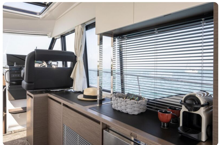
Jeanneau Merry Fisher 1295 Coupe - starboard side galley