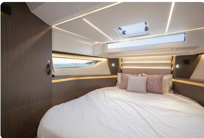
Jeanneau Merry Fisher 1295 Coupe - forward cabin view towards port