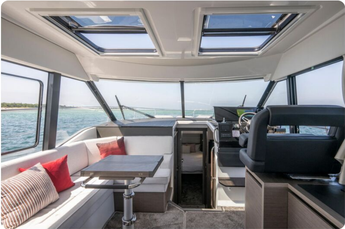
Jeanneau Merry Fisher 1295 Coupe - wheelhouse interior with port side saloon and starboard side galley