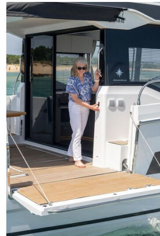
Jeanneau Merry Fisher 1295 Coupe - electric folding starboard side terrace