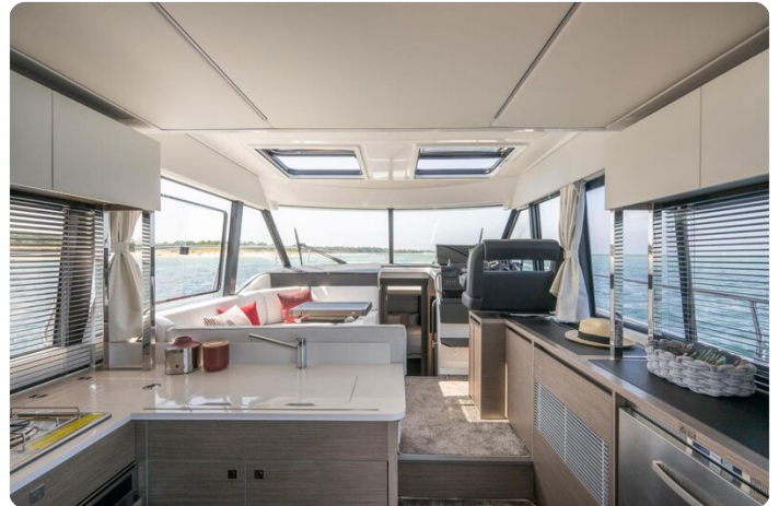
Jeanneau Merry Fisher 1295 Coupe - starboard side and aft galley