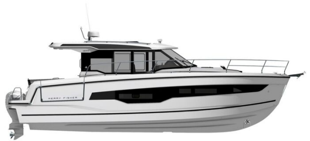
Jeanneau Merry Fisher 1295 Coupe - diagram of side view