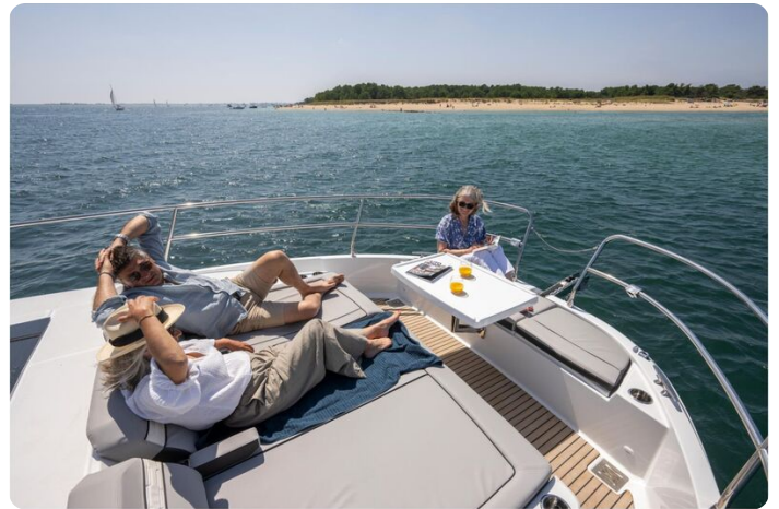
Jeanneau Merry Fisher 1295 Coupe - bow cockpit seating