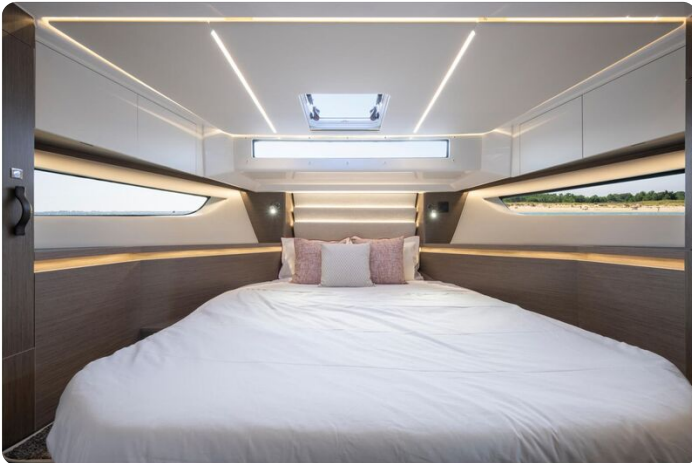
Jeanneau Merry Fisher 1295 Coupe - forward cabin