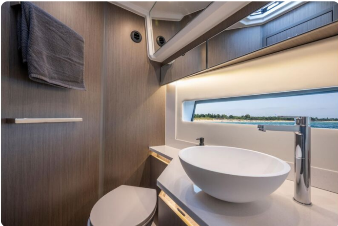
Jeanneau Merry Fisher 1295 Coupe - toilet and wash basin