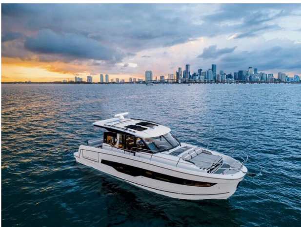
Jeanneau Merry Fisher 1295 Coupe - on the water