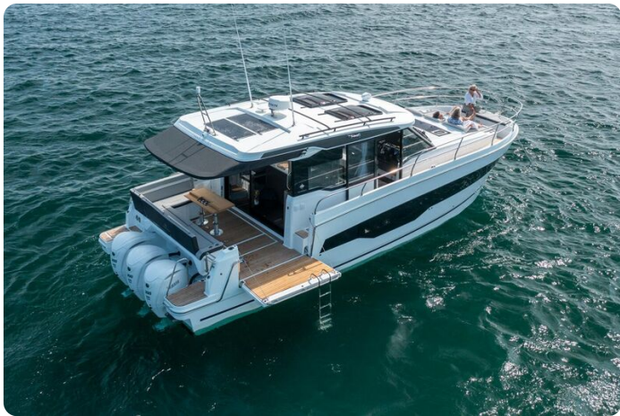
Jeanneau Merry Fisher 1295 Coupe