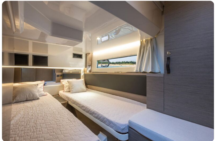
Jeanneau Merry Fisher 1295 Coupe - 2nd cabin