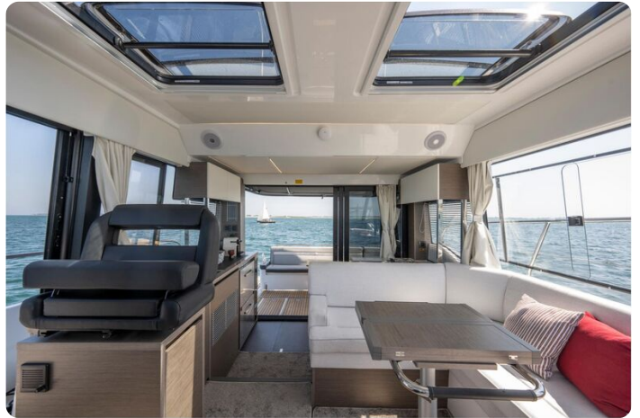
Jeanneau Merry Fisher 1295 Coupe - view from wheelhouse towards aft