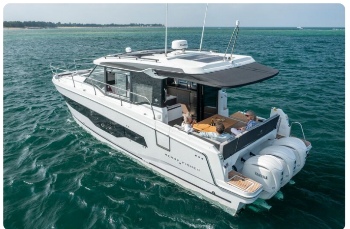
Jeanneau Merry Fisher 1295 Coupe - aft port side