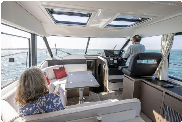
Jeanneau Merry Fisher 1295 Coupe - port side seating and starboard side helm position