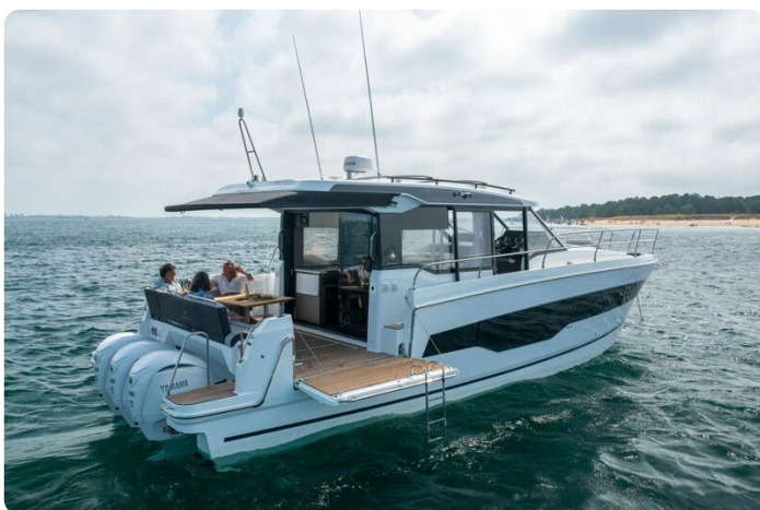
Jeanneau Merry Fisher 1295 Coupe - aft cockpit and starboard side terrace