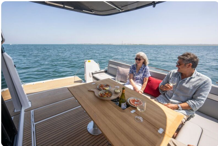
Jeanneau Merry Fisher 1295 Coupe - aft cockpit seating and table