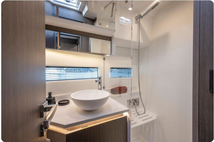
Jeanneau Merry Fisher 1295 Coupe - wash basin and shower