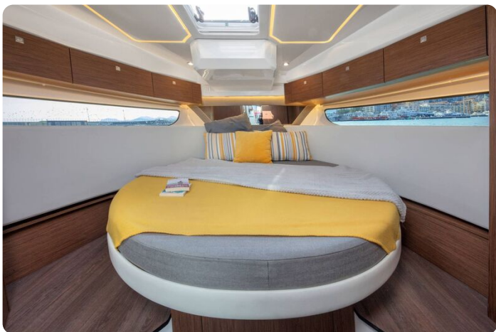
Jeanneau Merry Fisher 1095 Fly - forward cabin