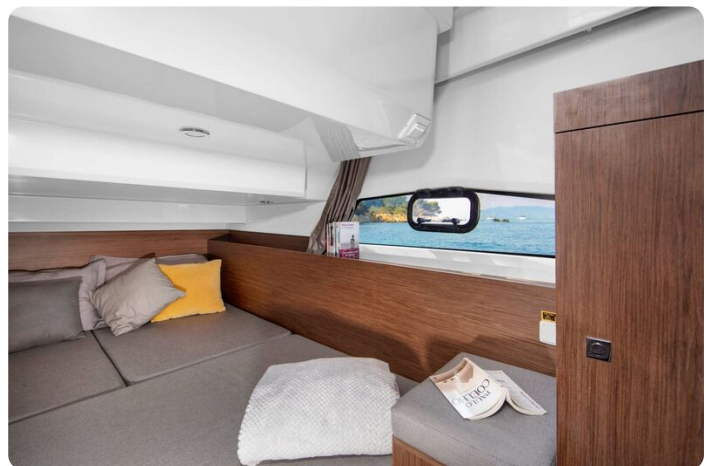
Jeanneau Merry Fisher 1095 Fly - 2nd cabin