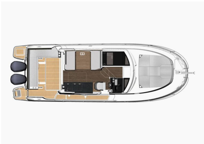
Jeanneau Merry Fisher 1095 Fly - diagram of top view and wheelhouse interior