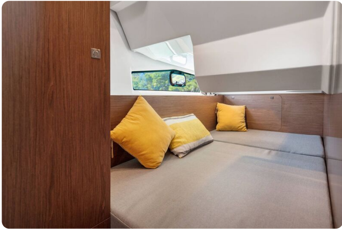
Jeanneau Merry Fisher 1095 Fly - 3rd cabin