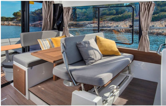
Jeanneau Merry Fisher 1095 Fly - co-pilot bench seat converts to saloon seating