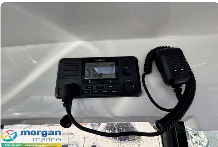
Merry Fisher 1095 - VHF