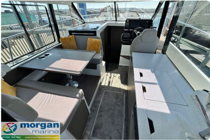
Merry Fisher 1095 - saloon