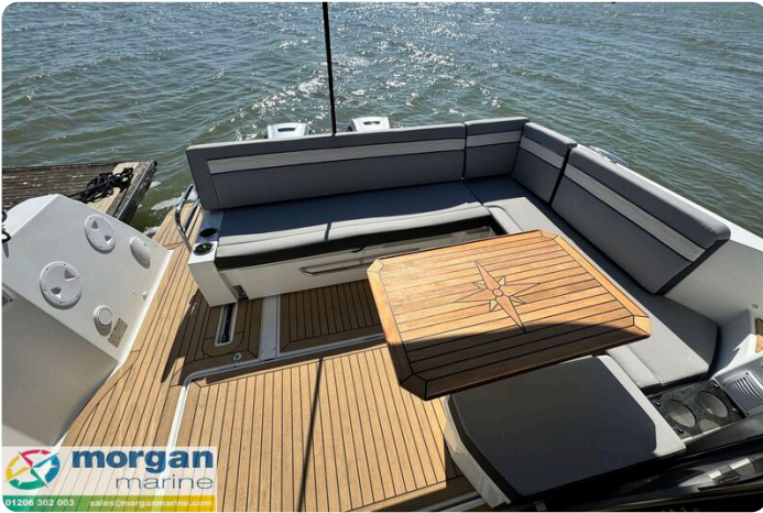
Merry Fisher 1095 - cockpit