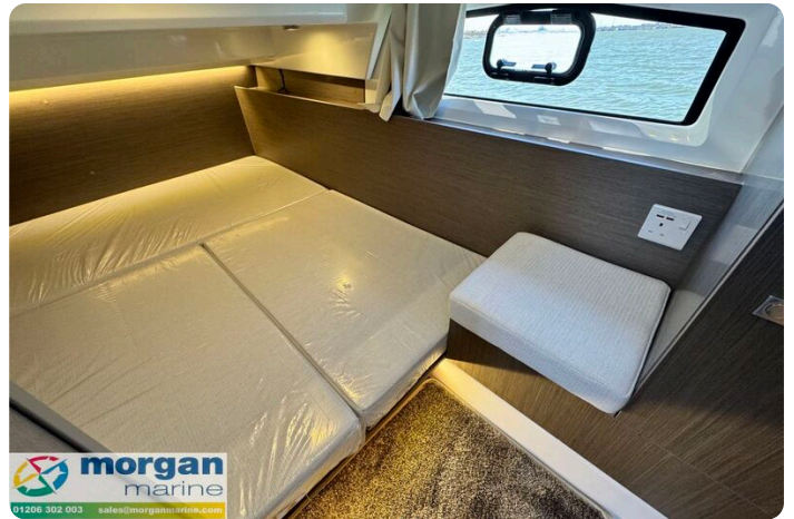
Merry Fisher 1095 - sec berth