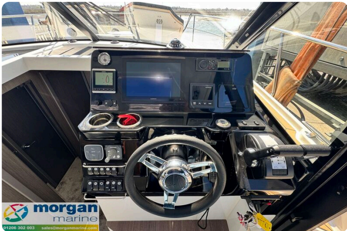
Merry Fisher 1095 - wheel