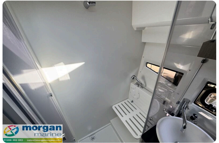
Merry Fisher 1095 - shower