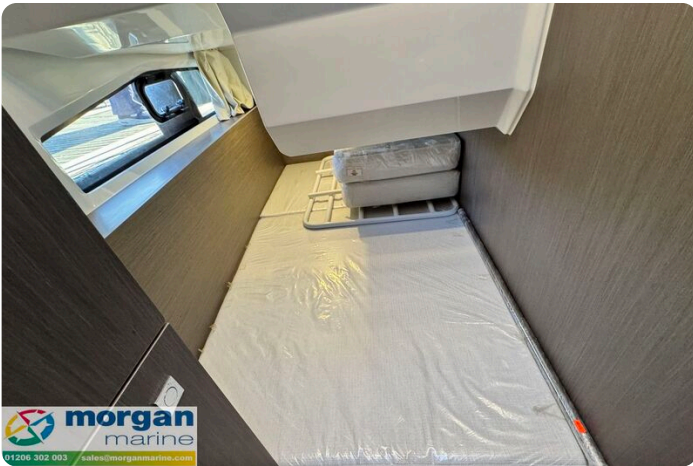
Merry Fisher 1095 - third berth