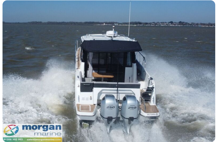
Merry Fisher 1095 - honda