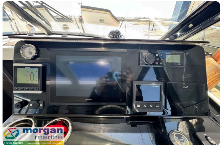
Merry Fisher 1095 - Garmin