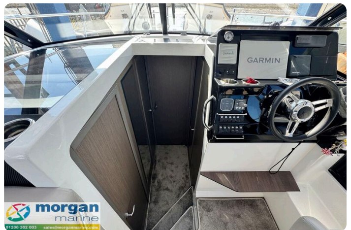
Merry Fisher 1095 - stairs