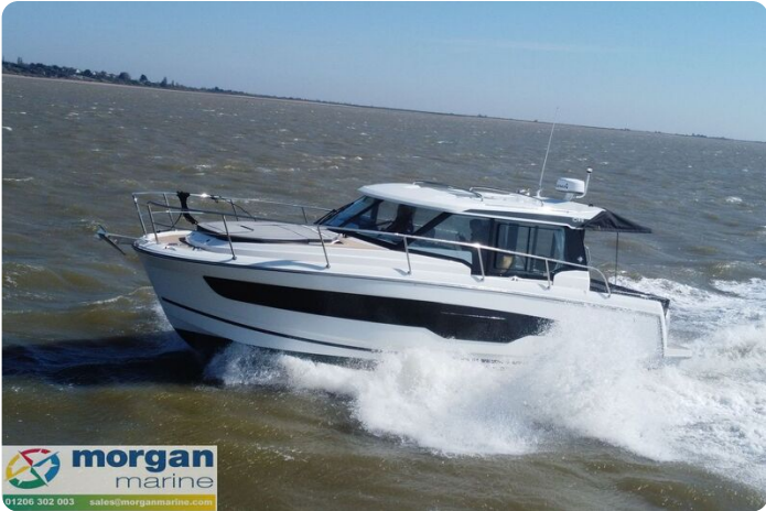
Merry Fisher 1095 - railings