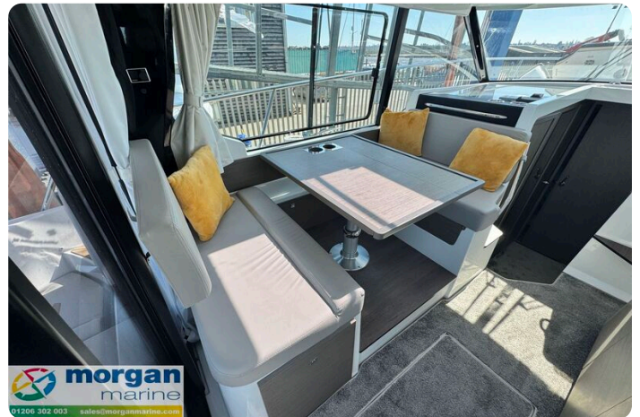
Merry Fisher 1095 - table