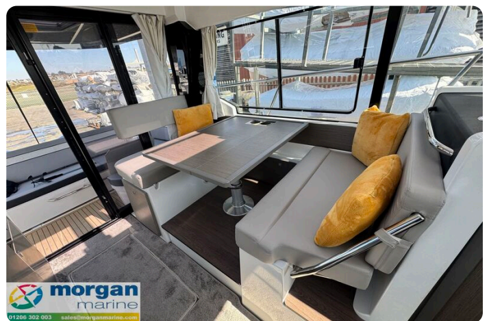
Merry Fisher 1095 - table view