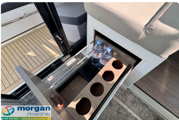
Merry Fisher 1095 - wine draw