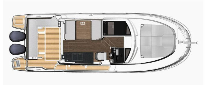
Jeanneau Merry Fisher 1095 - diagram of wheelhouse and bow