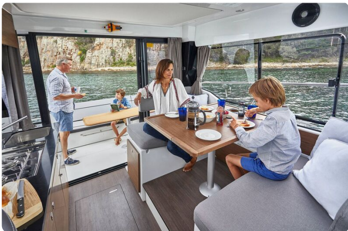
Jeanneau Merry Fisher 1095 - view from wheelhouse to cockpit