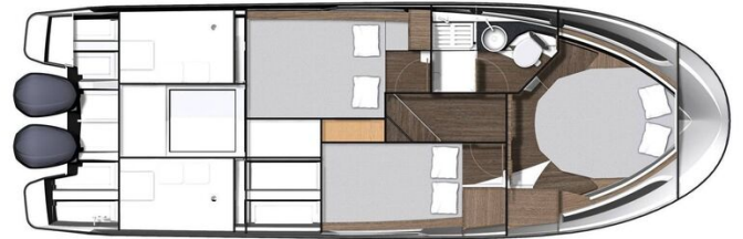
Jeanneau Merry Fisher 1095 - diagram of cabin layout