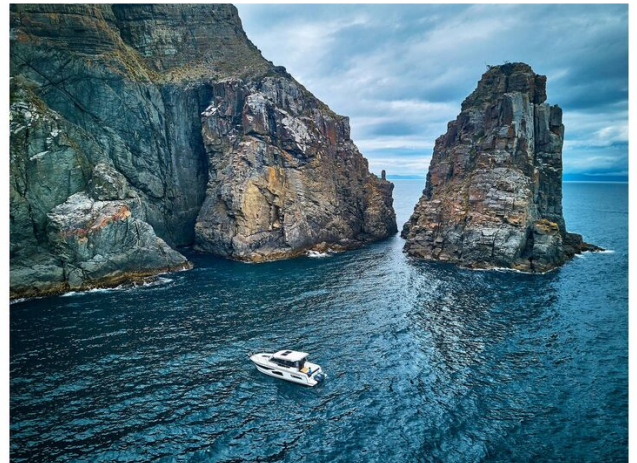
Jeanneau Merry Fisher 1095 - in beautiful surroundings