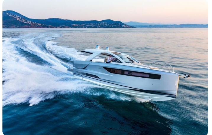
Jeanneau DB 43 inboard - on the water