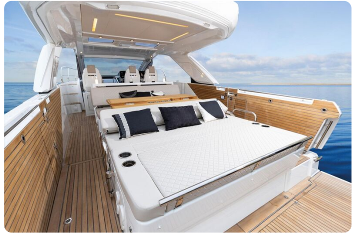
Jeanneau DB 43 inboard - aft sun lounger