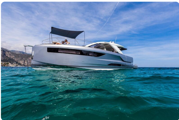
Jeanneau DB 43 inboard - port side hull