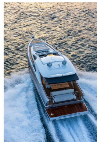
Jeanneau DB 43 inboard - overhead view from aft