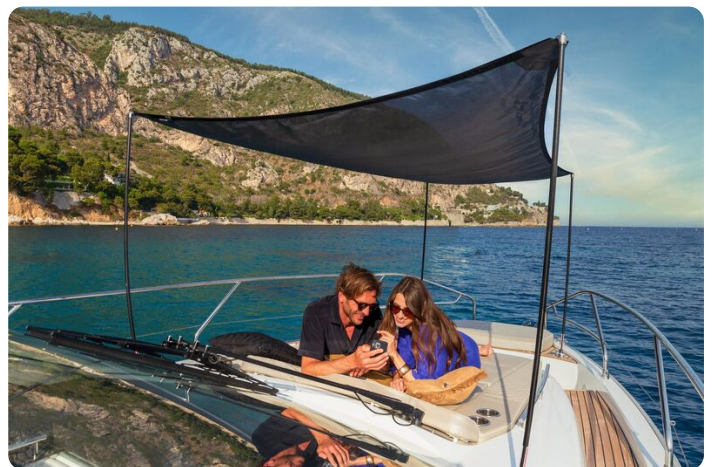
Jeanneau DB 43 inboard - forward cockpit sunshade