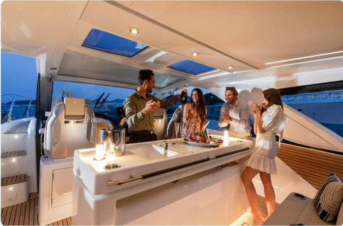
Jeanneau DB 43 inboard - cockpit galley