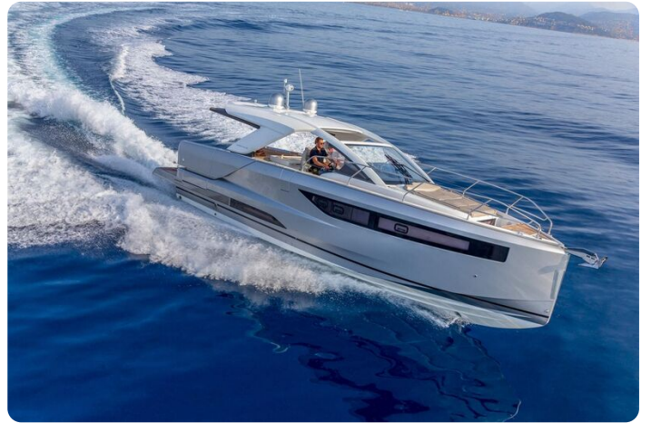
Jeanneau DB 43 inboard - speeding through the water