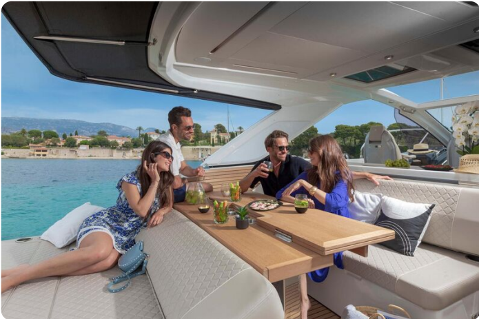
Jeanneau DB 43 inboard - sitting at cockpit table