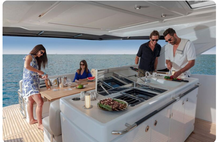
Jeanneau DB 43 inboard - cockpit galley