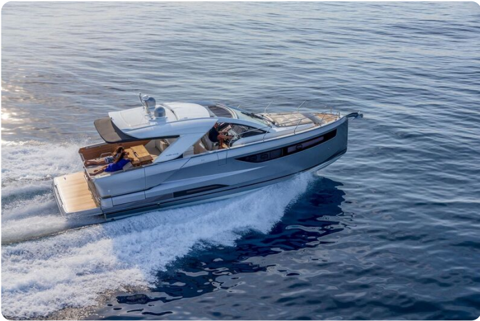
Jeanneau DB 43 inboard - overhead view from starboard side