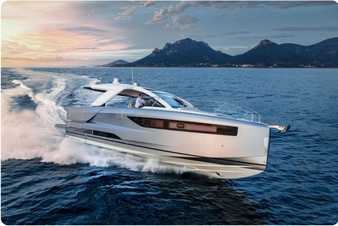
Jeanneau DB 43 inboard - on the water with beautiful sunset