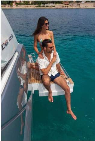
Jeanneau DB 43 inboard - relaxing on the port side terrace