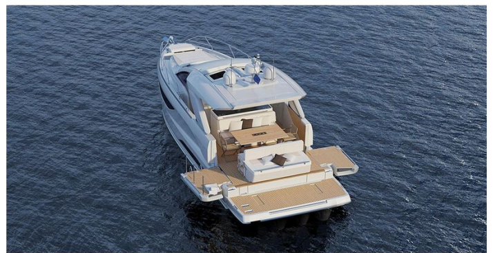
Jeanneau DB 43 inboard - overhead view of terraces