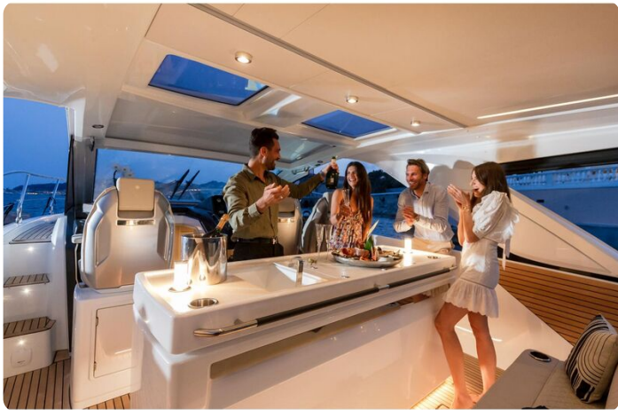
Jeanneau DB 43 inboard - cockpit galley