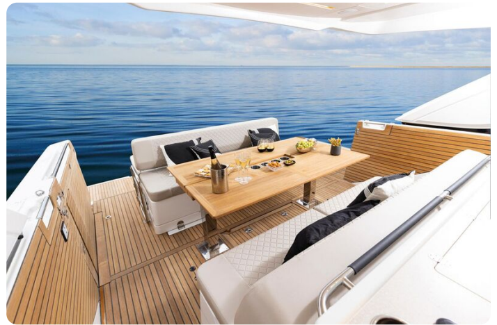
Jeanneau DB 43 inboard - aft cockpit table