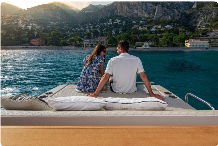
Jeanneau DB 43 inboard - looking out from the aft sun lounger