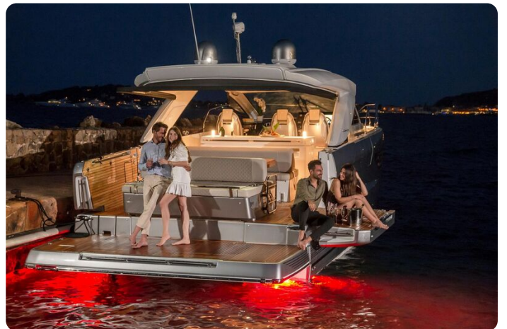
Jeanneau DB 43 inboard - socialising at night on the terraces with under water lights