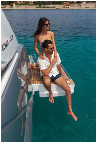
Jeanneau DB 43 inboard - relaxing on the port side terrace