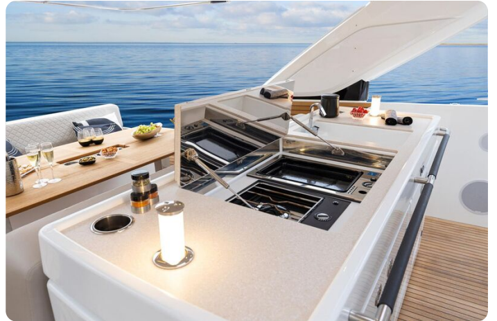
Jeanneau DB 43 inboard - cockpit galley