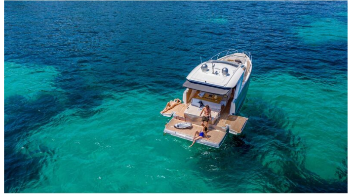
Jeanneau DB 43 inboard - view from high above