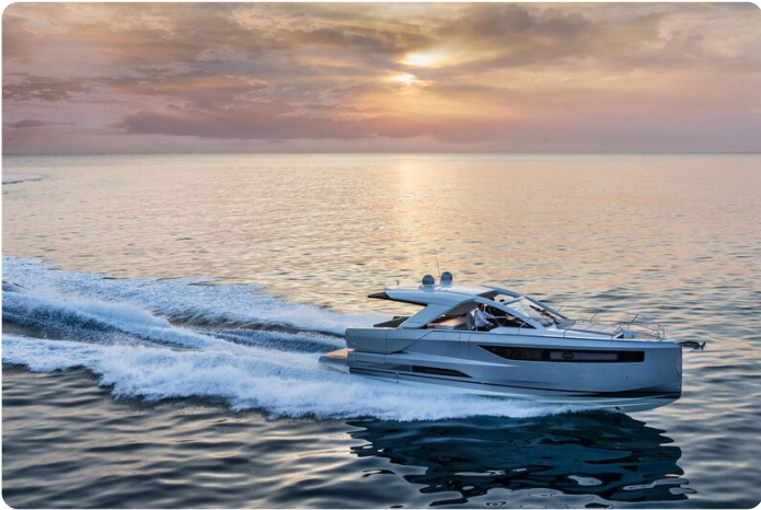
Jeanneau DB 43 inboard - cruising on the water