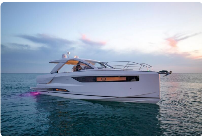
Jeanneau DB 43 inboard - view towards starboard side bow