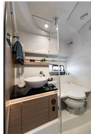
Jeanneau Cap Camarat 9.0 WA Series 2 -