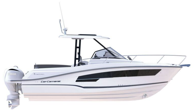
Jeanneau Cap Camarat 9.0 WA - diagram of side view