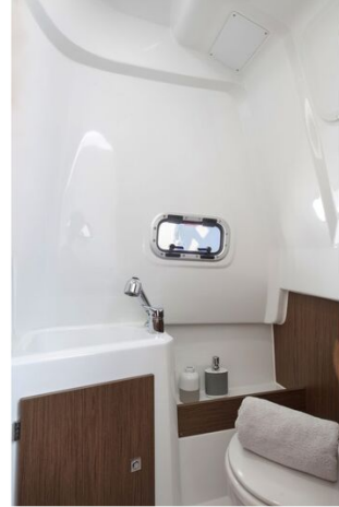
Jeanneau Cap Camarat 9.0 CC - toilet and shower compartment