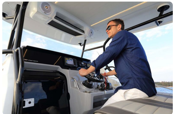
Jeanneau Cap Camarat 9.0 CC - helm position and plexi door to cabin