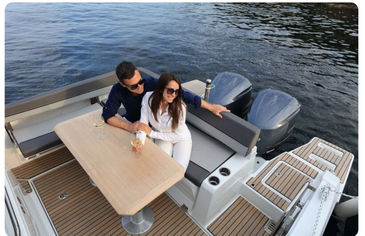
Jeanneau Cap Camarat 9.0 CC - aft cockpit bench seat and table