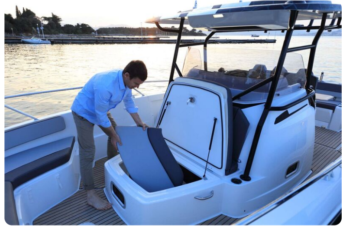
Jeanneau Cap Camarat 9.0 CC - access to cabin from bow