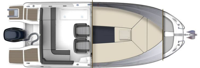
Jeanneau Cap Camarat 6.5 Walk Around - diagram of cuddy