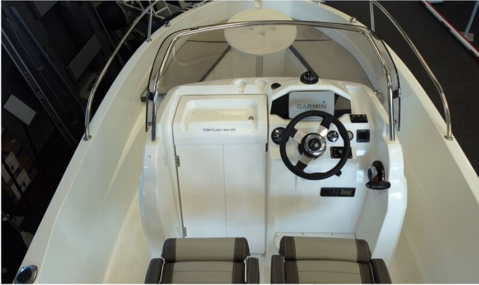
Jeanneau Cap Camarat 5.5 CC - helm position and dash