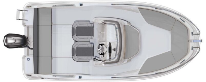
Jeanneau Cap Camarat 5.5 CC - diagram of overhead view