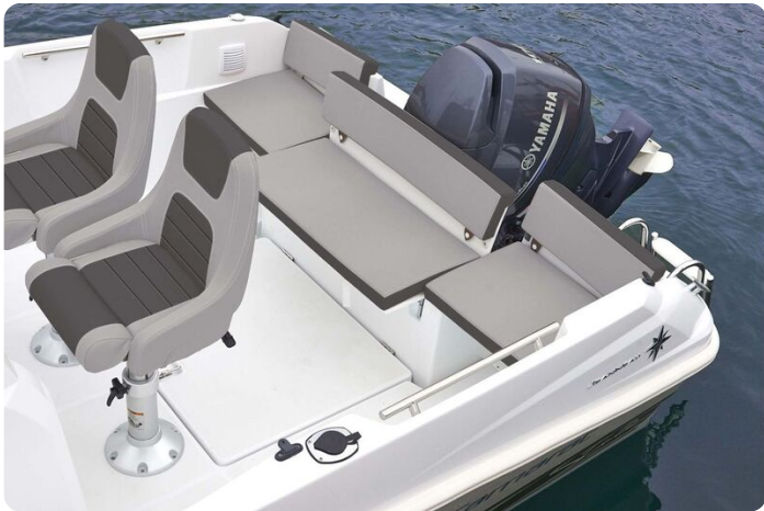
Jeanneau Cap Camarat 5.5 CC - sliding aft bench