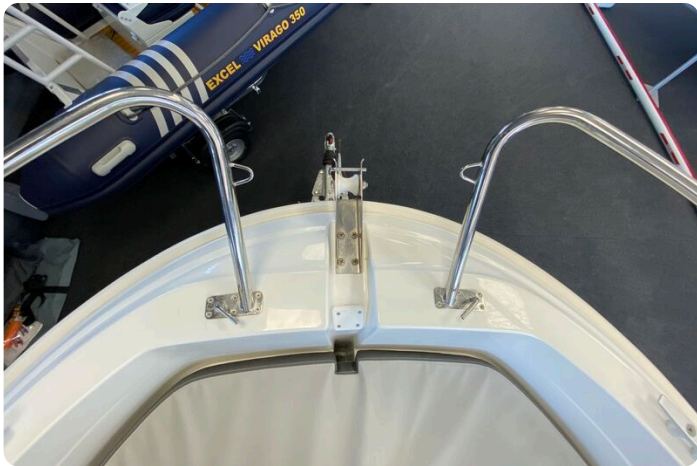
Jeanneau Cap Camarat 5.5 CC - pulpit rails and anchor roller