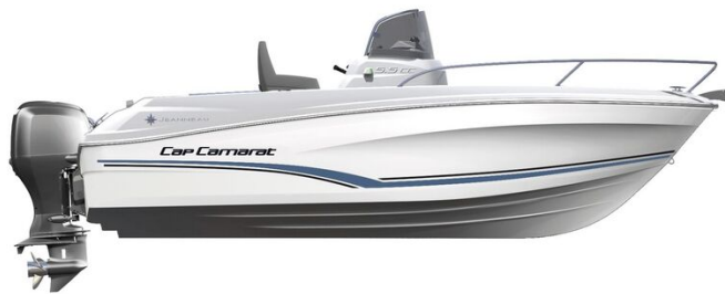
Jeanneau Cap Camarat 5.5 CC - diagram of side view