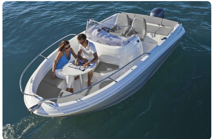
Jeanneau Cap Camarat 5.5 CC - with table in open bow