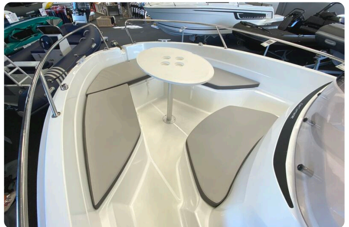
Jeanneau Cap Camarat 5.5 CC - bow seating with seating in-front of console