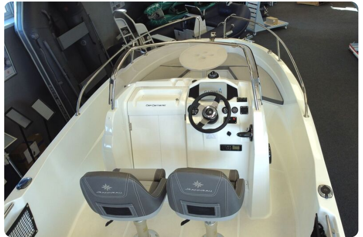
Jeanneau Cap Camarat 5.5 CC - pilot and co-pilot seats