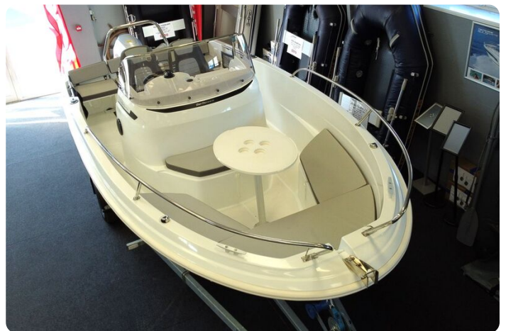
Jeanneau Cap Camarat 5.5 CC - bow seating and table