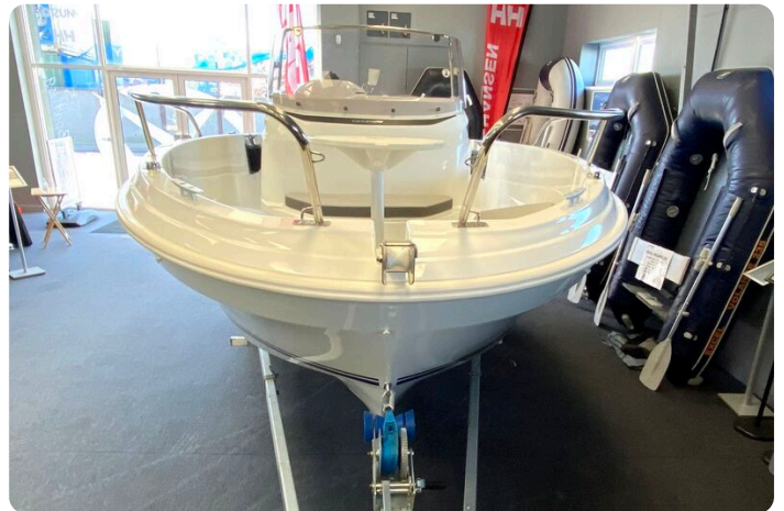
Jeanneau Cap Camarat 5.5 CC - bow