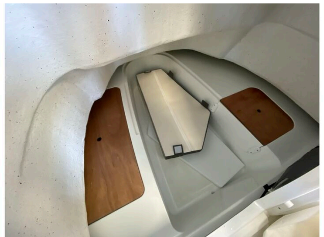
Jeanneau Cap Camarat 5.5 CC - cuddy / storage