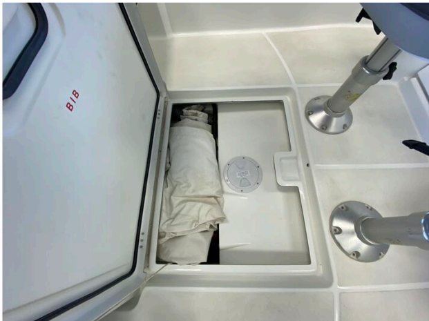
Jeanneau Cap Camarat 5.5 CC - storage under cockpit