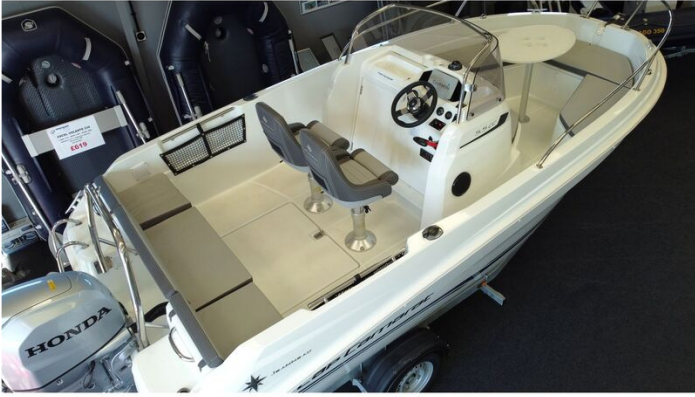
Jeanneau Cap Camarat 5.5 CC - cockpit and aft seating