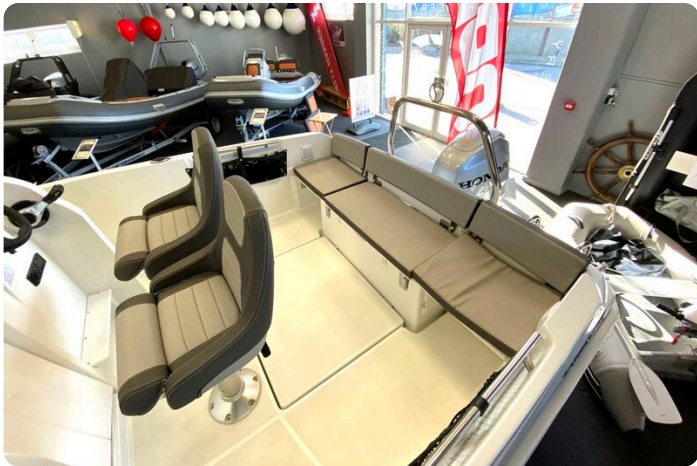
Jeanneau Cap Camarat 5.5 CC - aft cockpit seating from port side