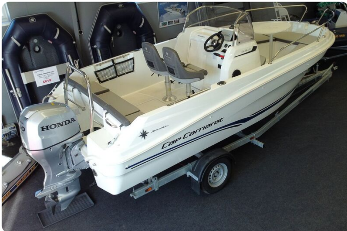
Jeanneau Cap Camarat 5.5 CC - cockpit seating and console