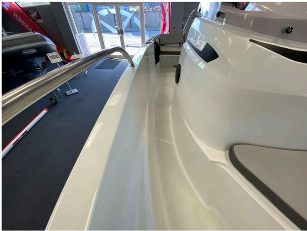
Jeanneau Cap Camarat 5.5 CC - starboard side deck from bow