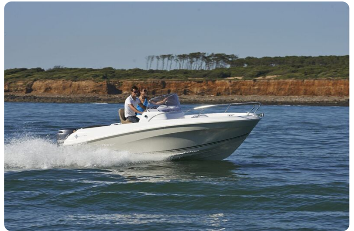
Jeanneau Cap Camarat 5.5 CC - starboard side