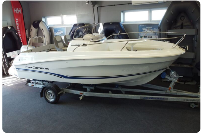
Jeanneau Cap Camarat 5.5 CC - starboard side