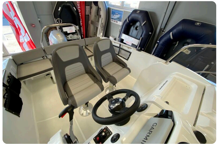
Jeanneau Cap Camarat 5.5 CC - view towards aft from helm position