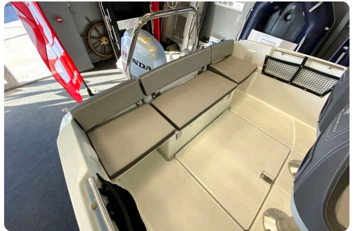
Jeanneau Cap Camarat 5.5 CC - aft cockpit seating from starboard side