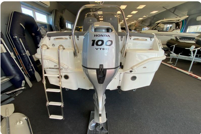
Jeanneau Cap Camarat 5.5 CC - transom with Honda 100hp outboard