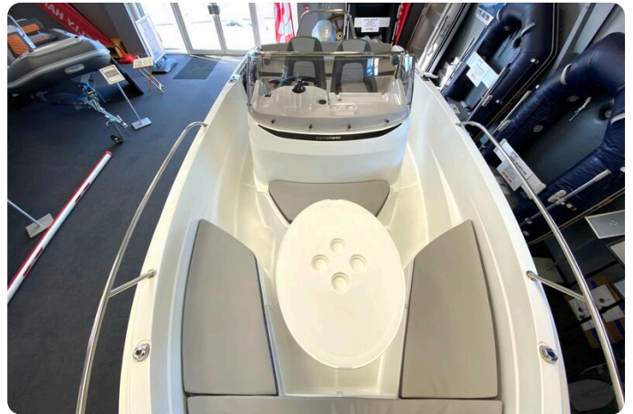
Jeanneau Cap Camarat 5.5 CC - view from bow towards aft