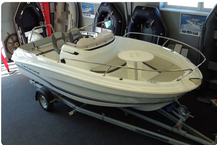
Jeanneau Cap Camarat 5.5 CC - bow seating from starboard side