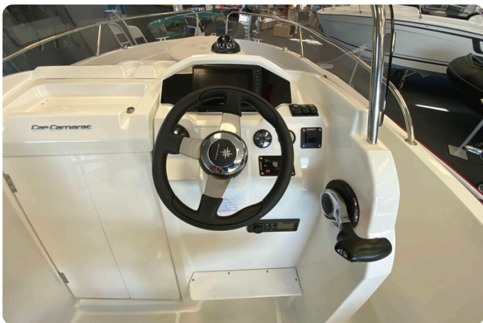
Jeanneau Cap Camarat 5.5 CC - dash and engine controls