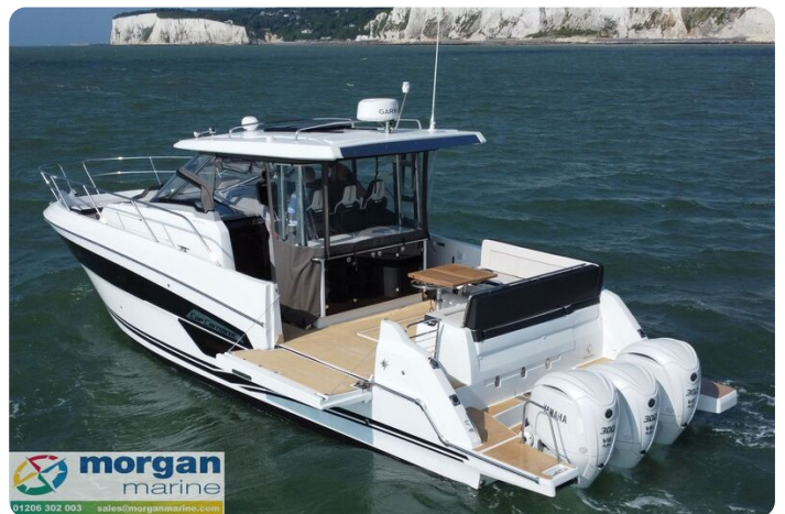
Jeanneau Cap Camarat 12.5 WA - open port side terrace