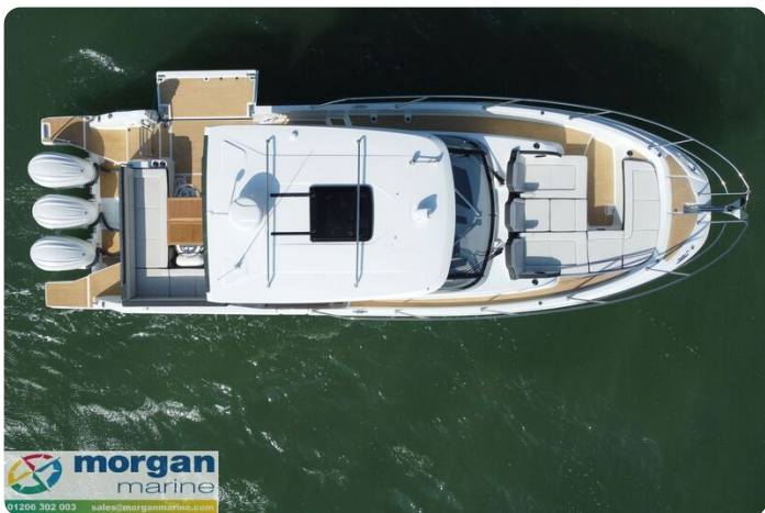
Jeanneau Cap Camarat 12.5 WA - overhead view of roof from port side