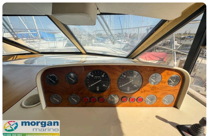
Humber 42 TSDY - dash