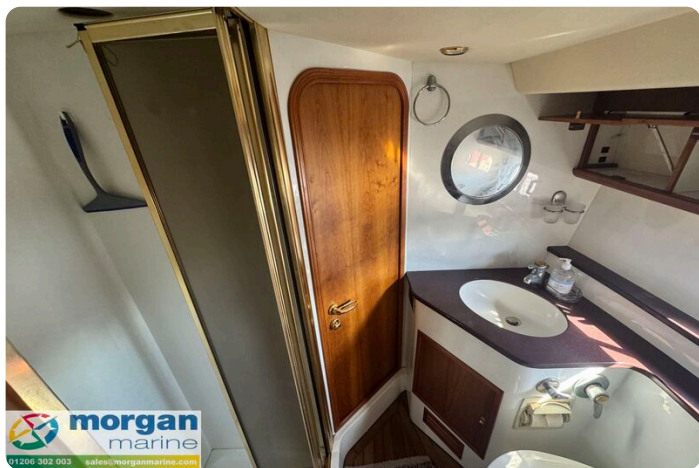
Humber 42 TSDY - sink