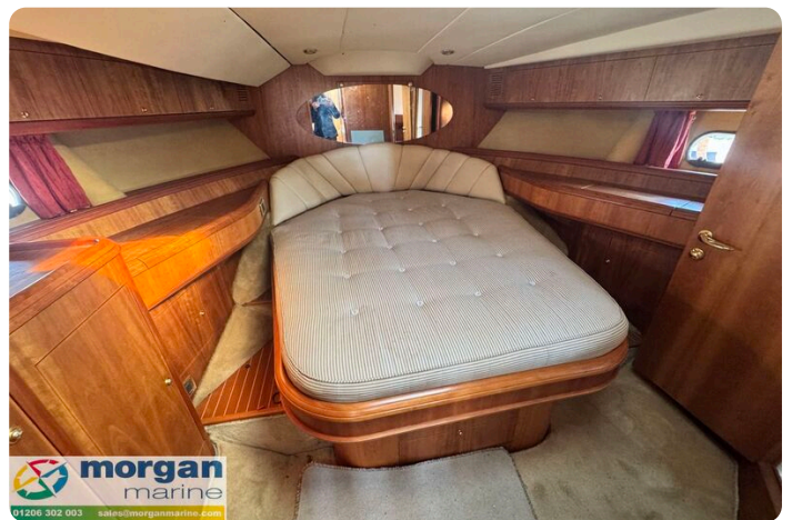
Humber 42 TSDY - main berth