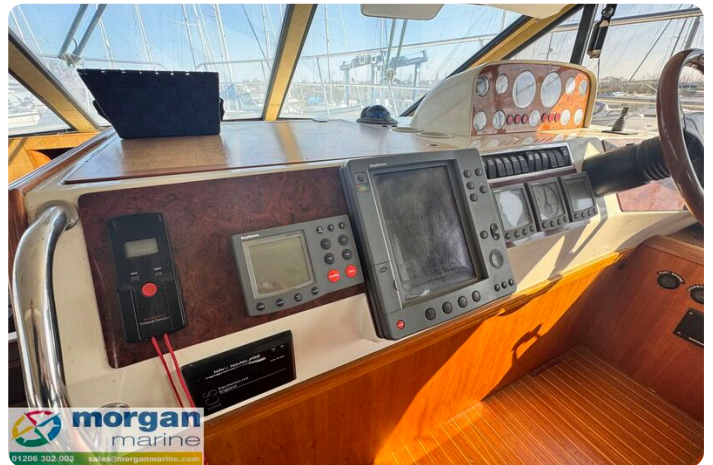
Humber 42 TSDY - plotter