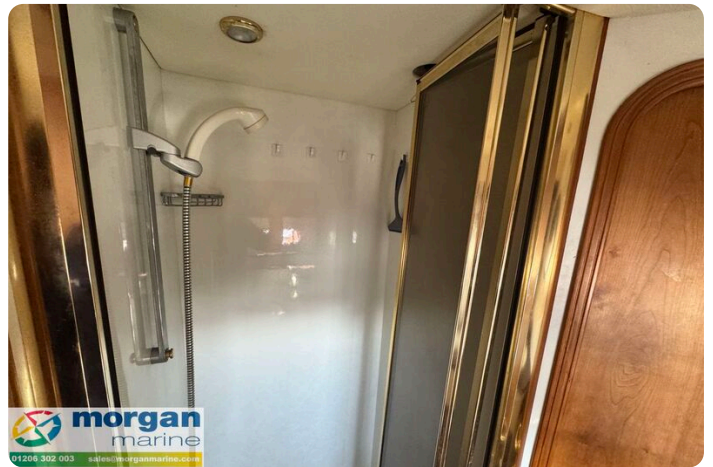
Humber 42 TSDY - shower