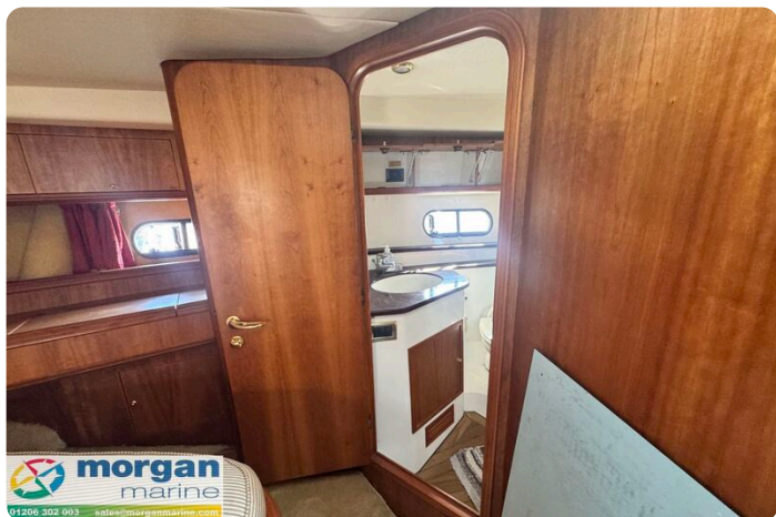
Humber 42 TSDY - door