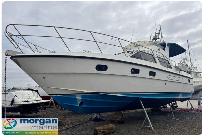
Humber 42 - Main