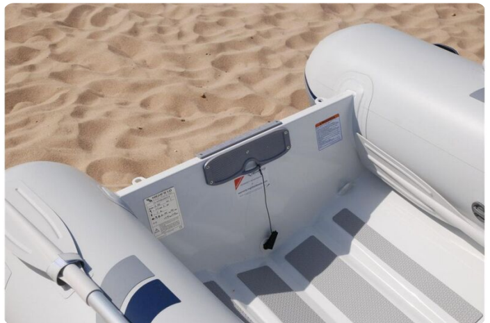
Highfield UL 340 aluminium RIB - deck and transom