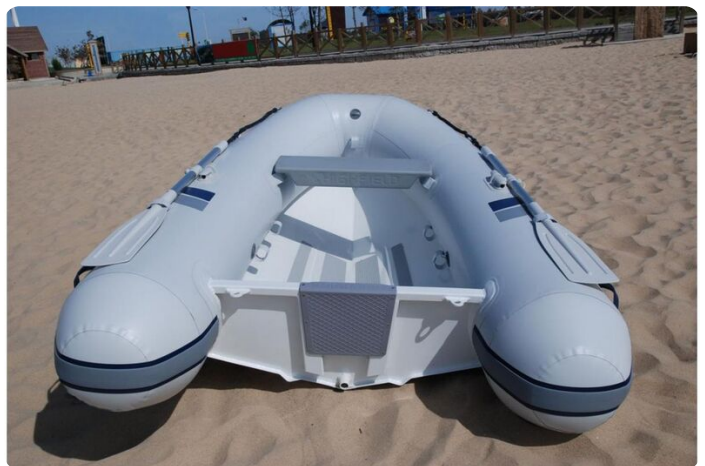
Highfield UL 340 aluminium RIB - overhead view