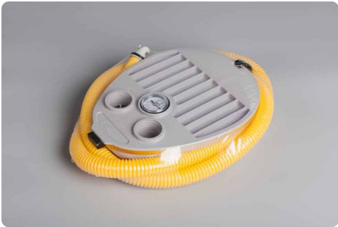
Highfield UL 340 aluminium RIB - pump