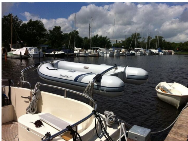
Highfield UL 340 aluminium RIB - on a larger boat