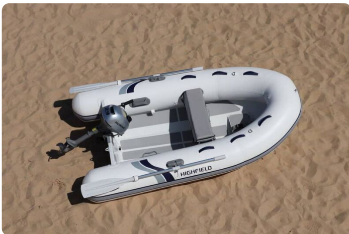
Highfield UL 290 aluminium-RIB - on a beach