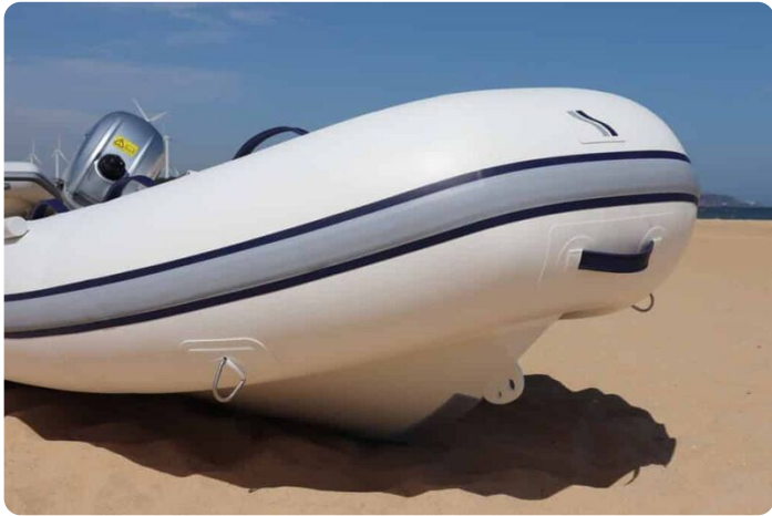
Highfield UL 290 aluminium-RIB - bow and keel