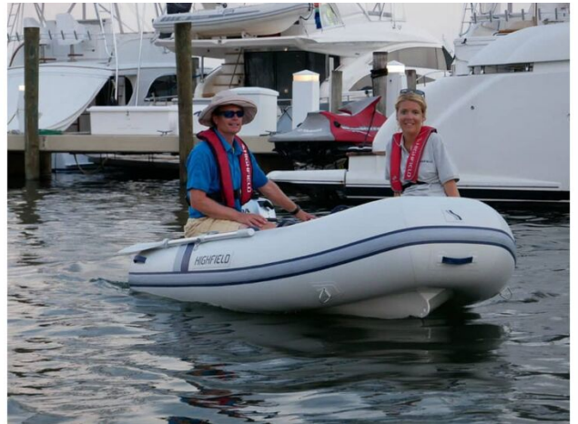
Highfield UL 290 aluminium-RIB - on the water