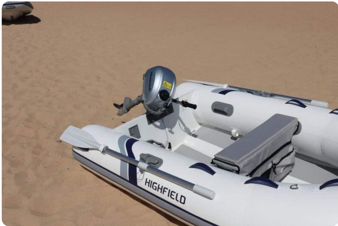
Highfield UL 290 aluminium-RIB - with Honda outboard