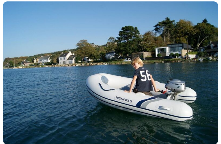
Highfield UL 240 aluminium RIB - on the water