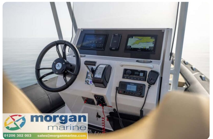
Highfield Sport 800 aluminium RIB - helm position with engine controls and electronics