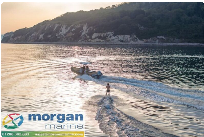
Highfield Sport 800 aluminium RIB - great for water sports