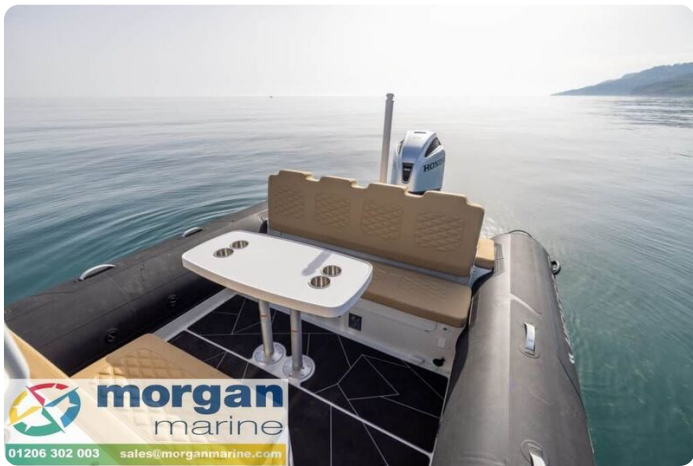
Highfield Sport 800 aluminium RIB - aft table and seating