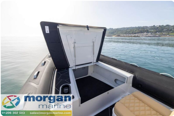
Highfield Sport 800 aluminium RIB - storage under bow