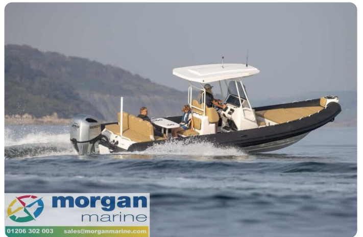
Highfield Sport 800 aluminium RIB - port side