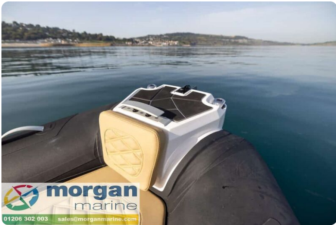
Highfield Sport 800 aluminium RIB - seat