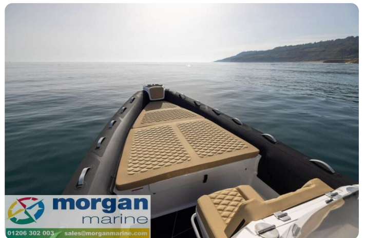
Highfield Sport 800 aluminium RIB - bow cushions