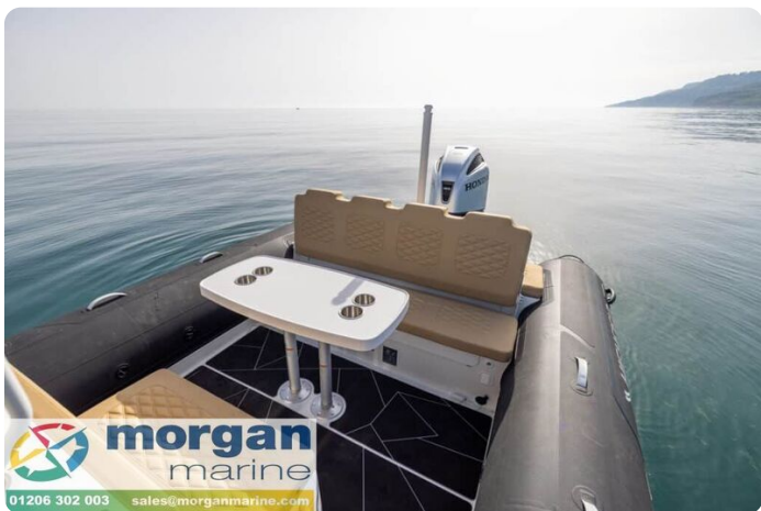
Highfield Sport 800 aluminium RIB - aft table and seating