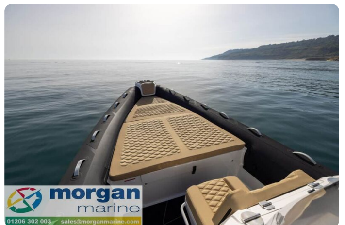
Highfield Sport 800 aluminium RIB - bow cushions