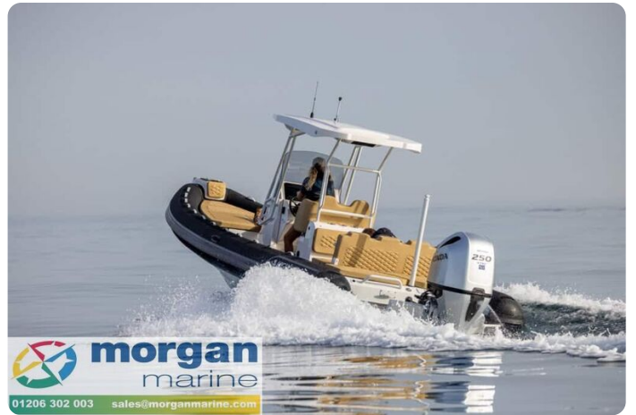
Highfield Sport 800 aluminium RIB - moving through the water