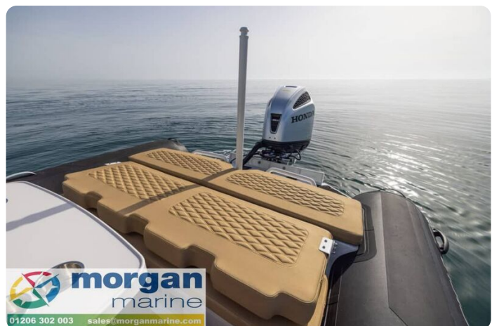
Highfield Sport 800 aluminium RIB - aft sun lounger