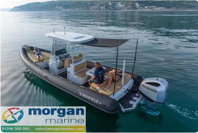
Highfield Sport 800 aluminium RIB