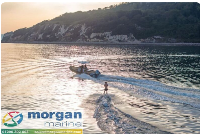
Highfield Sport 800 aluminium RIB - great for water sports