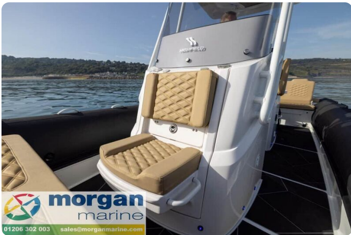
Highfield Sport 800 aluminium RIB - seat in front of console