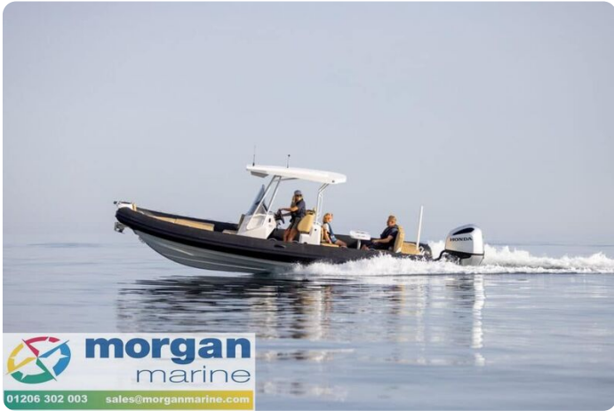
Highfield Sport 800 aluminium RIB - on the water