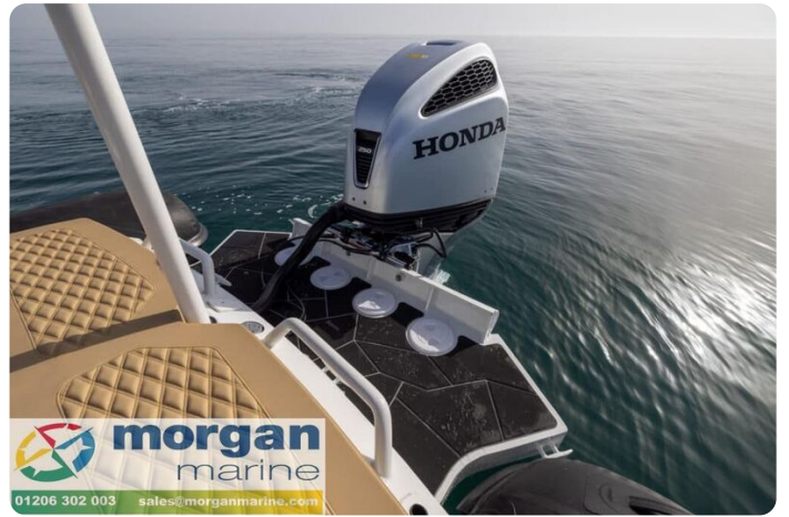
Highfield Sport 800 aluminium RIB - transom with Honda outboard