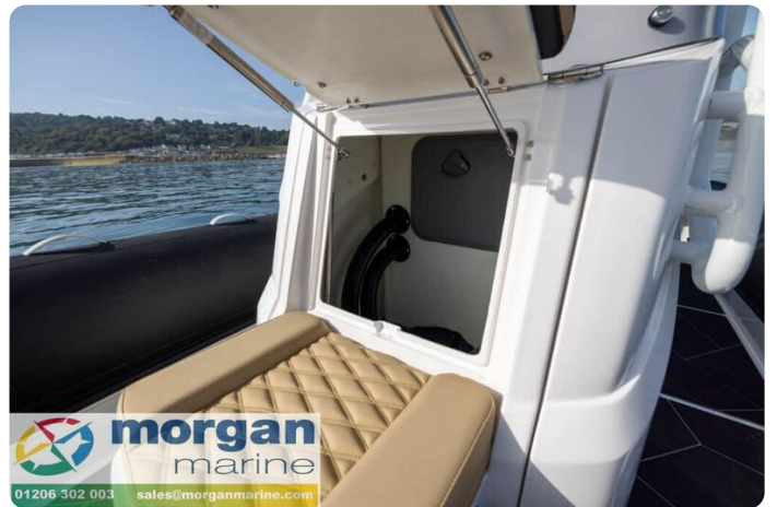
Highfield Sport 800 aluminium RIB - storage in console