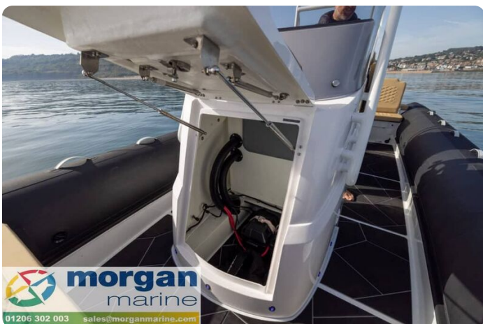
Highfield Sport 800 aluminium RIB - storage