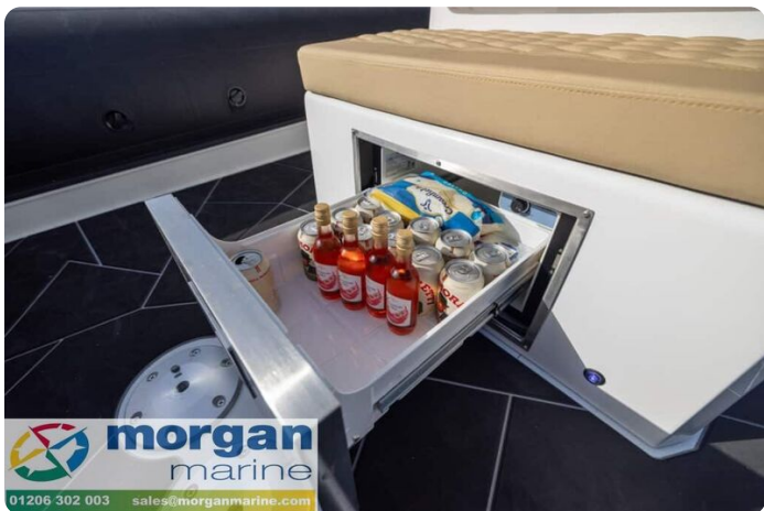
Highfield Sport 800 aluminium RIB - drinks storage