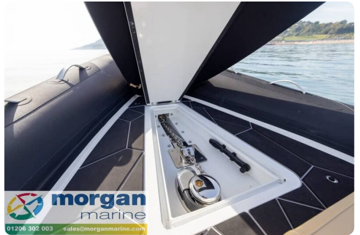
Highfield Sport 800 aluminium RIB - anchor locker