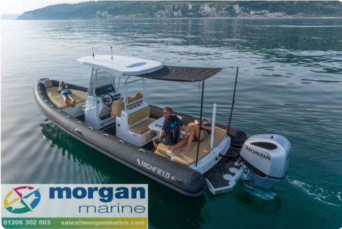
Highfield Sport 800 aluminium RIB