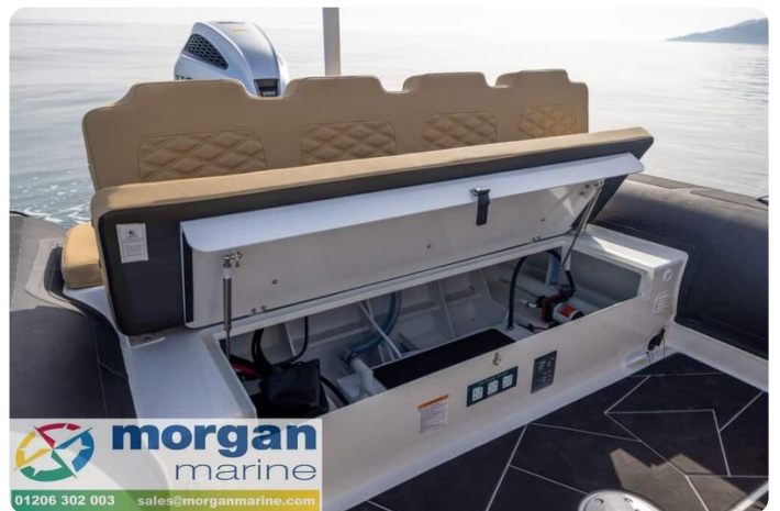
Highfield Sport 800 aluminium RIB - storage under seating