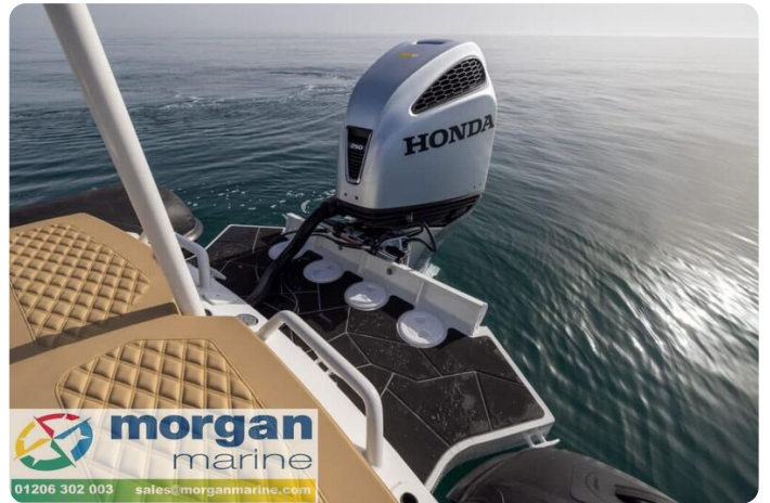
Highfield Sport 800 aluminium RIB - transom with Honda outboard