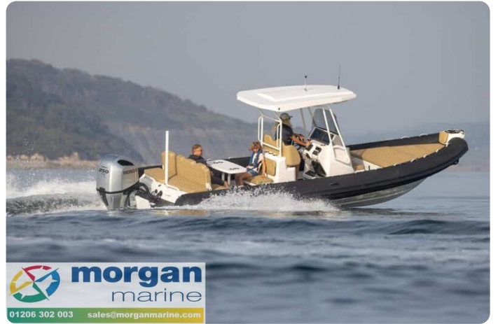
Highfield Sport 800 aluminium RIB - port side