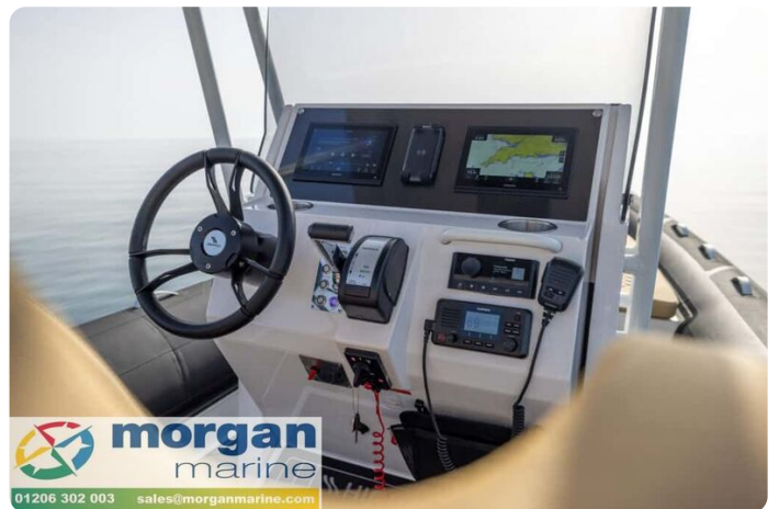
Highfield Sport 800 aluminium RIB - helm position with engine controls and electronics