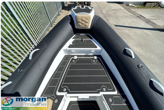
Highfield Sport 700 - bow locker closed