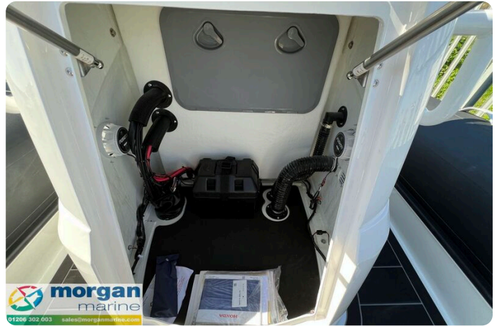
Highfield Sport 700 - battery compartment