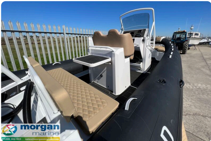
Highfield Sport 700 - starboard side tubes