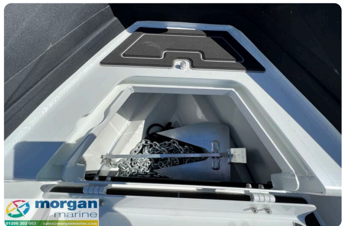
Highfield Sport 700 - anchor locker