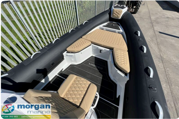
Highfield Sport 700 - bow cushions and forward console seat - without infill