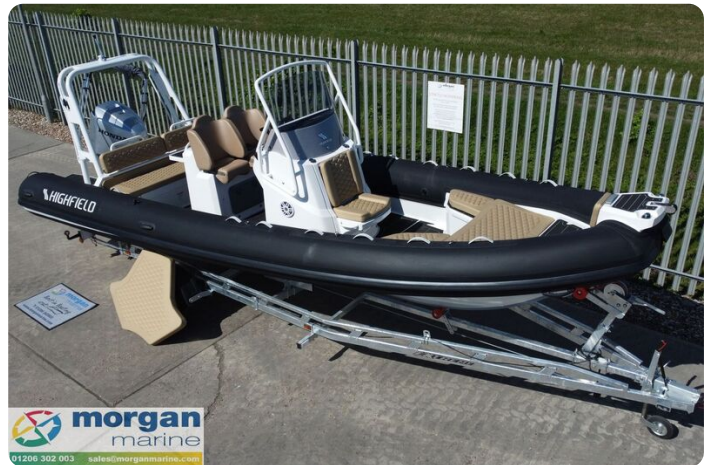
Highfield Sport 700 - overhead view from starboard side