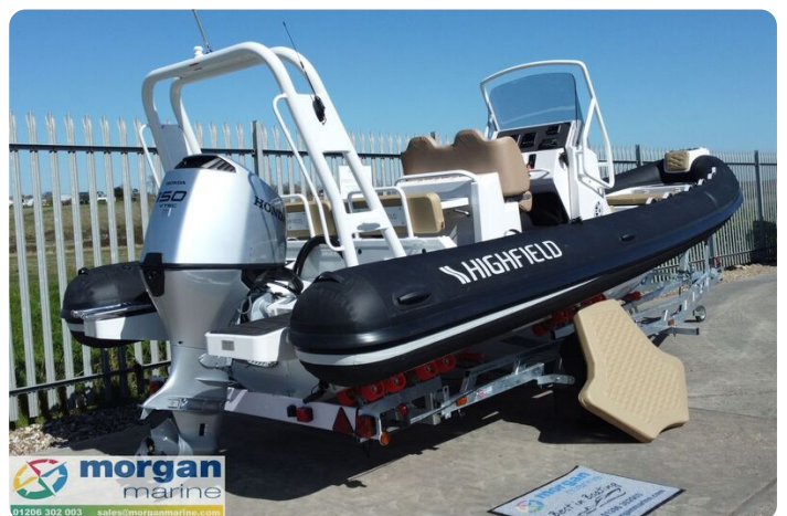
Highfield Sport 700 - A-frame