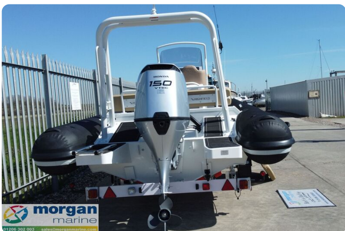
Highfield Sport 700 - transom and engine